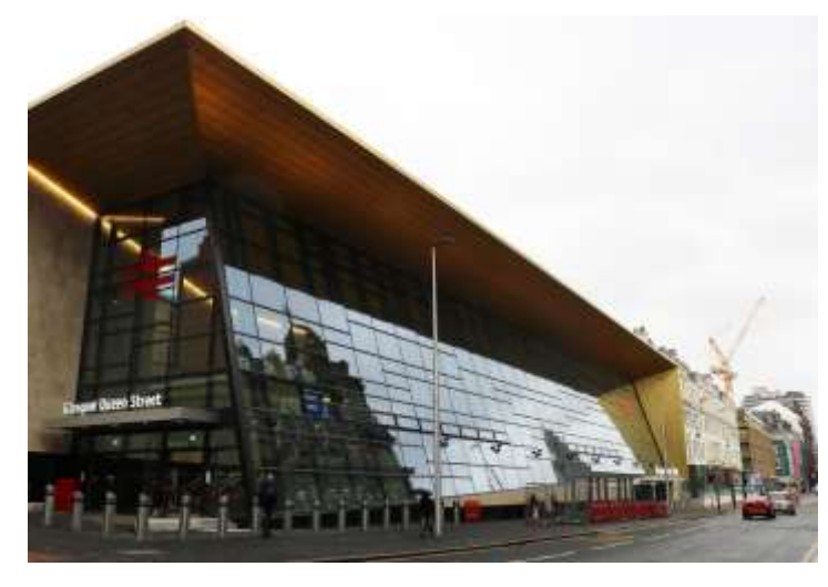
Glasgow Queen Street Station Improvements

The Edinburgh Waverley Masterplan proposes to improve city centre spaces for more efficient and effective public use, embracing active travel solutions, and refocusing the performance and operation of the centre of the city. In addition to better performance, enhancements in and around Edinburgh Waverley will enable a more frequent and reliable train service to operate, contributing to sustainable modal shift.