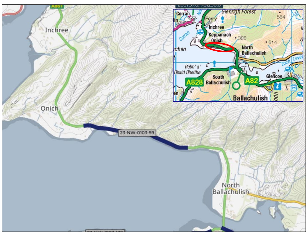
Figure 1. Location and scheme extent of the proposed resurfacing works at A82 Ballachulish to Onich. Source: BEAR Scotland. F108 – Environmental Assessment Request (Scheme ref: 23-NW-0103-106).

Scheme Start: NN 03967 61276Scheme End: NN 04083 61221