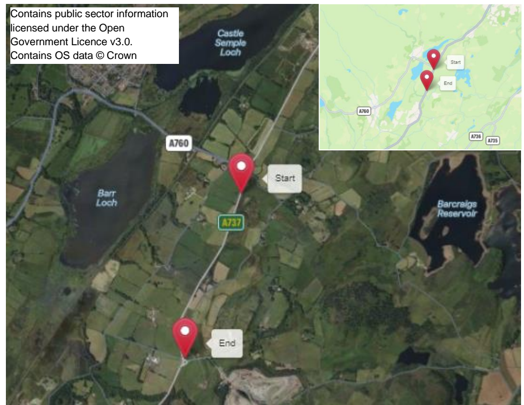
Figure 2: A737 Bourtrees to Clerksbridge Toll Rbt Scheme Location

The A737 Beith Road, Risk Brae is located at Howwood, Renfrewshire. This section of the scheme is located at the following National Grid References (NGRs):