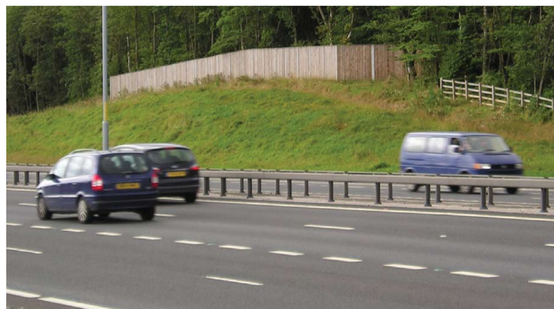
EXAMPLE OF TIMBER NOISE BARRIER