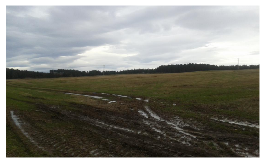
Plate 64. Parcel 18a before data collection, looking east