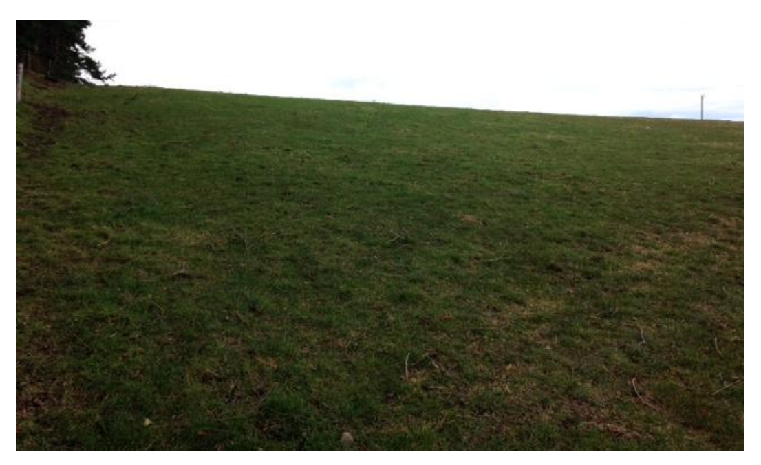
Plate 37. Parcel 13b after data collection, looking north