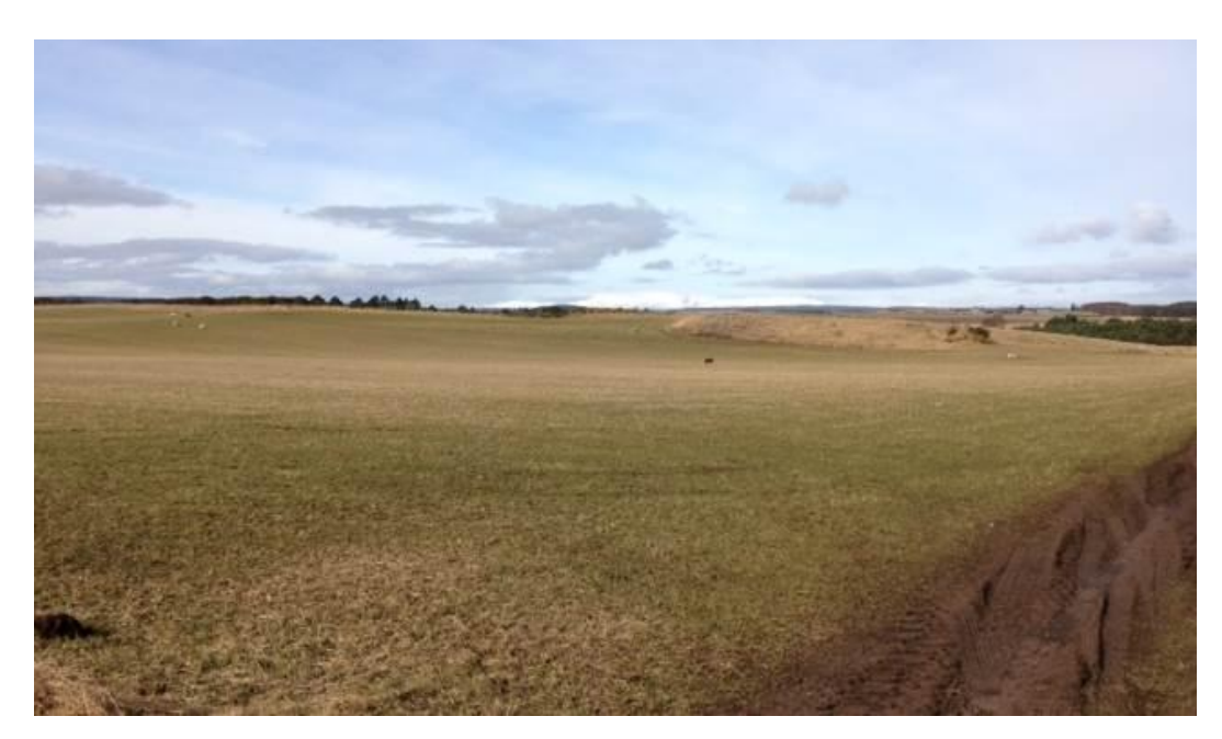
Plate 9. Parcel 6 after data collection, looking north-west