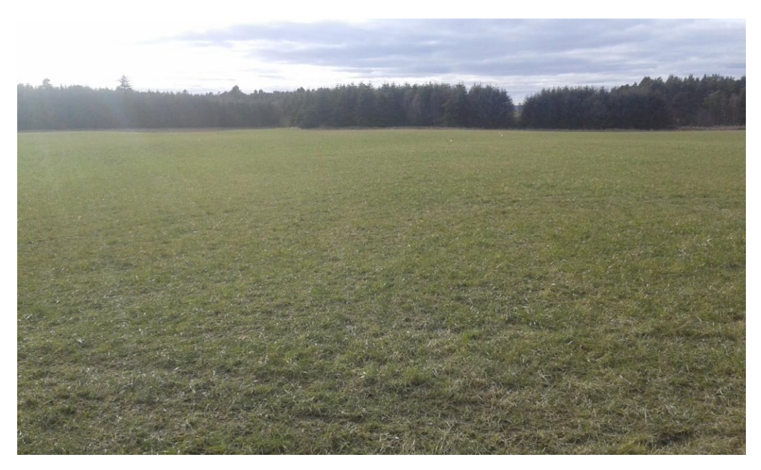
Plate 16. Parcel 8c after data collection, looking south-west