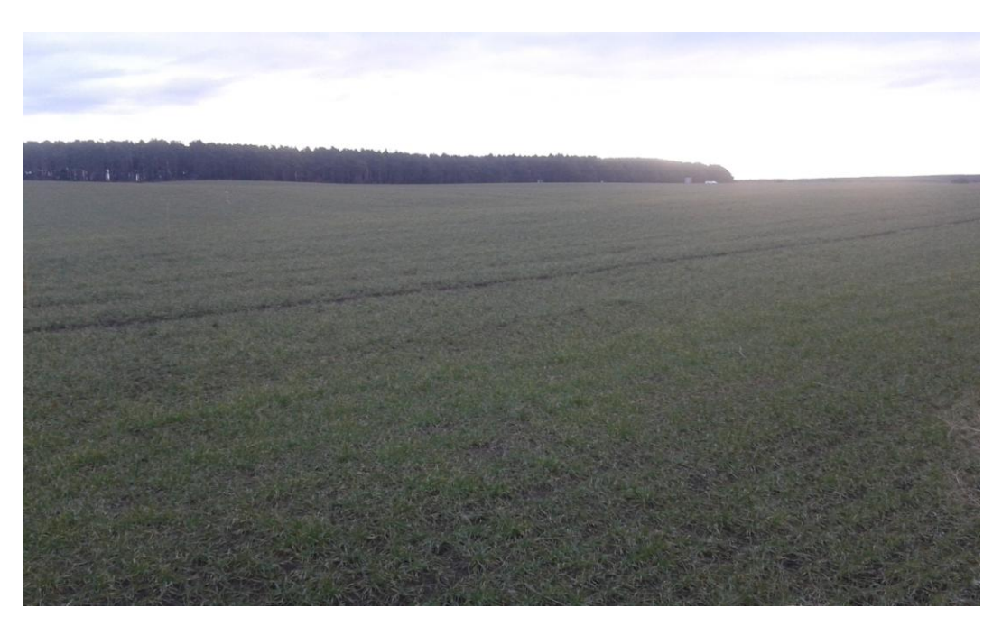
Plate 20. Parcel 9b after data collection, looking south-east