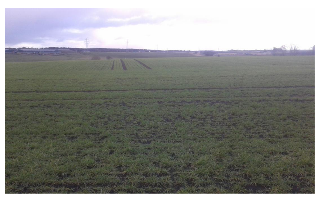
Plate 49. Parcel 15c after data collection, looking west