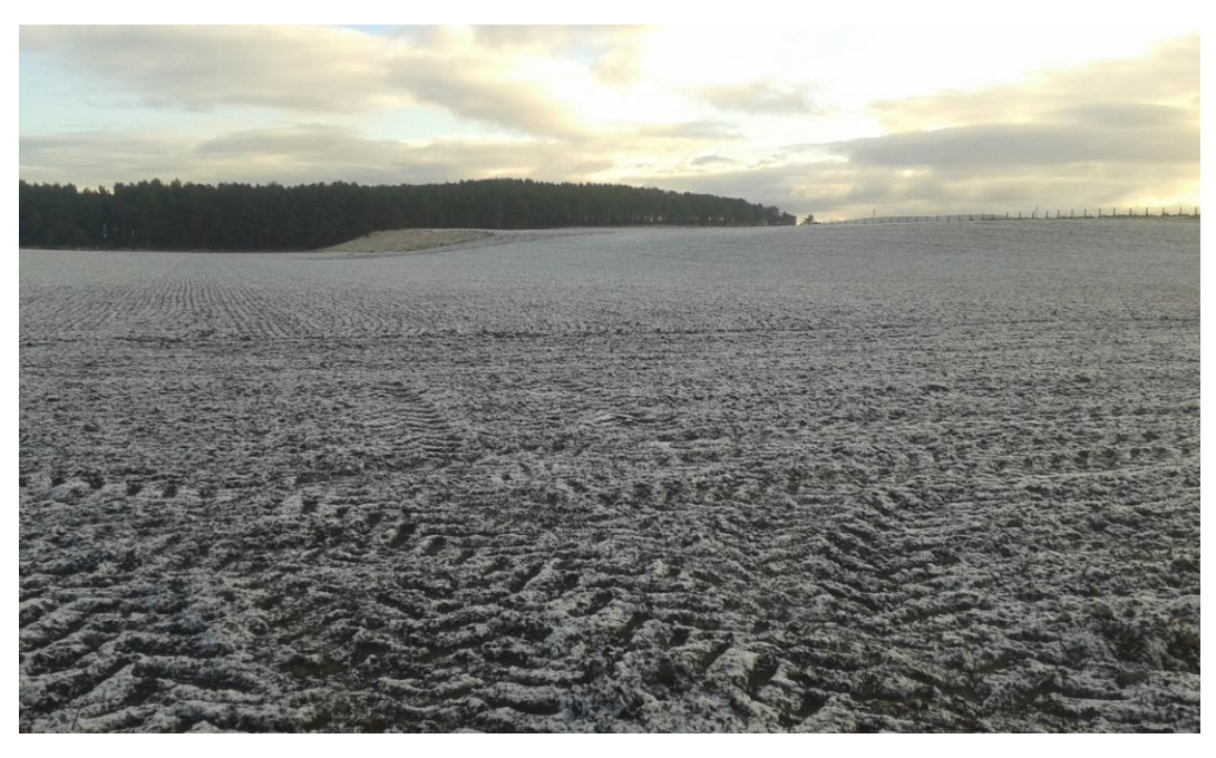
Plate 17. Parcel 9a before data collection, looking north-east