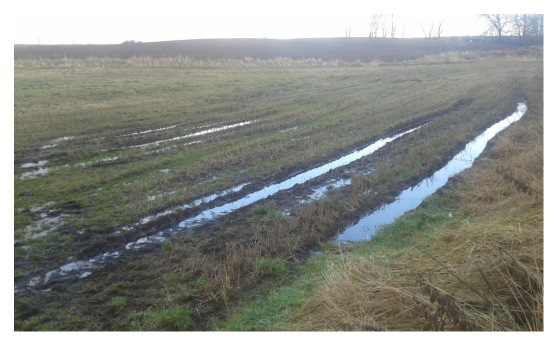
Plate 50. Parcel 15d after data collection, looking south-east