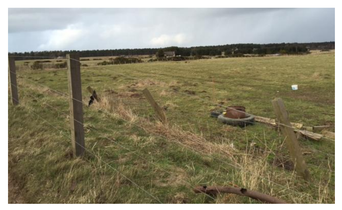
Plate 30. Parcel 12b after data collection, looking north