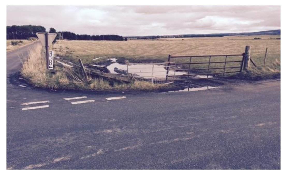
Plate 28. Parcel 12a after data collection, looking east