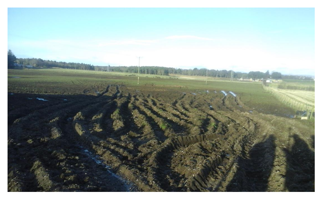
Plate 42. Parcel 14c before data collection, looking north-west