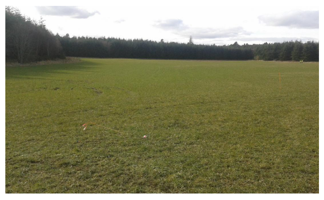
Plate 15. Parcel 8c before data collection, looking south-west