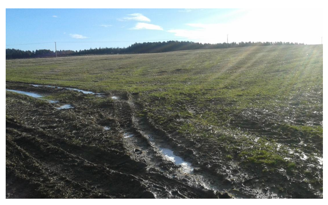
Plate 65. Parcel 18a after data collection, looking east