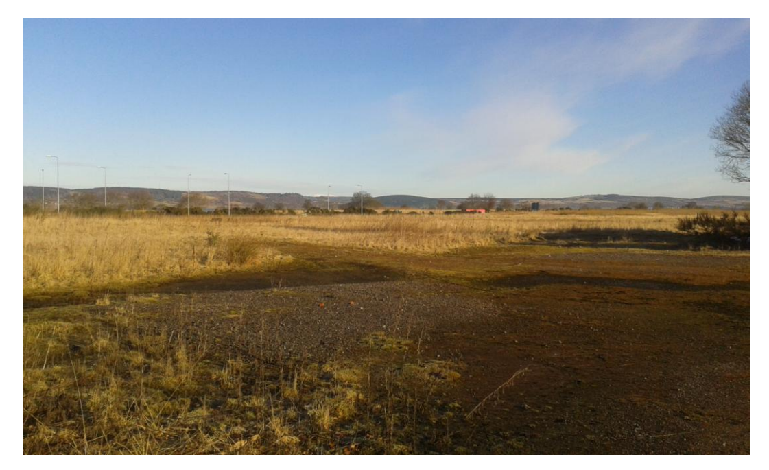
Plate 3. Parcel 2 before data collection, looking north