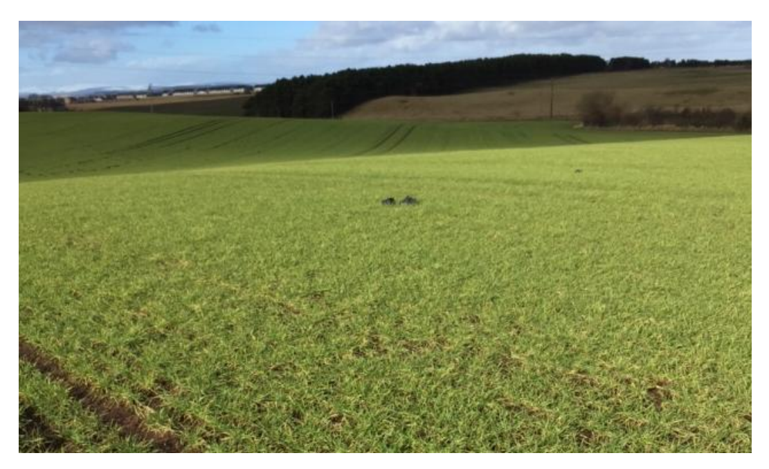
Plate 46. Parcel 15b before data collection, looking north-east