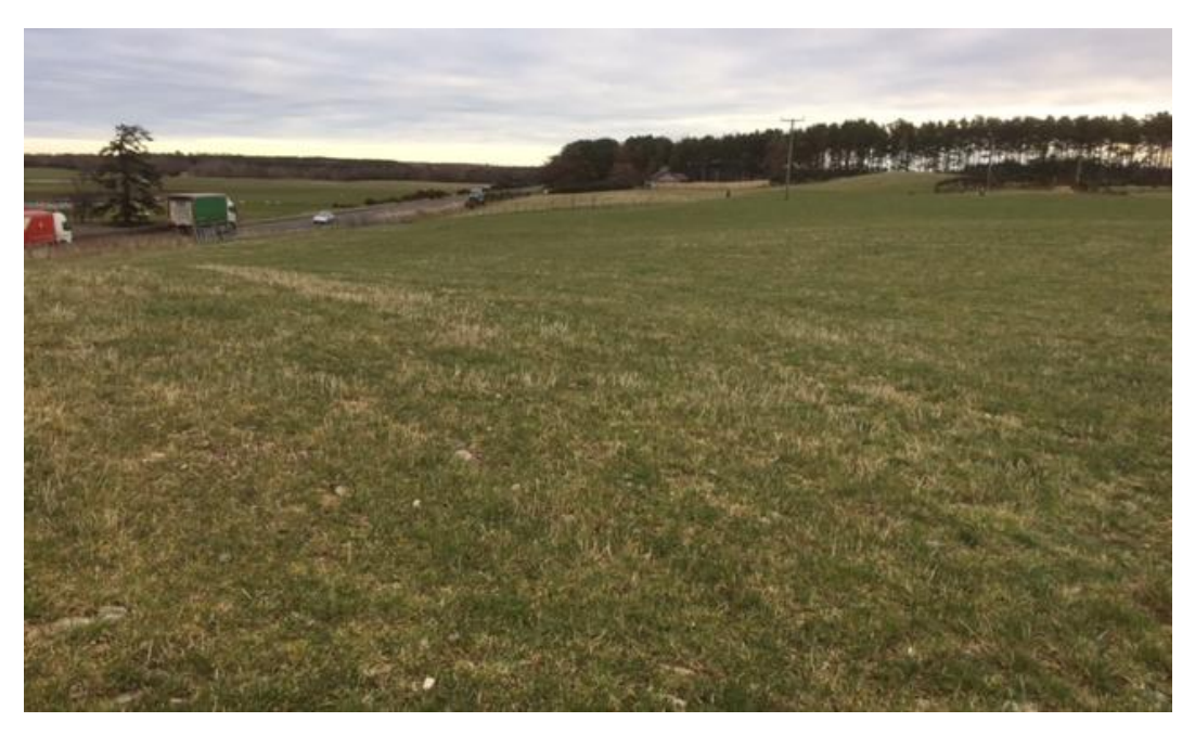
Plate 21. Parcel 10 before data collection, looking north-east