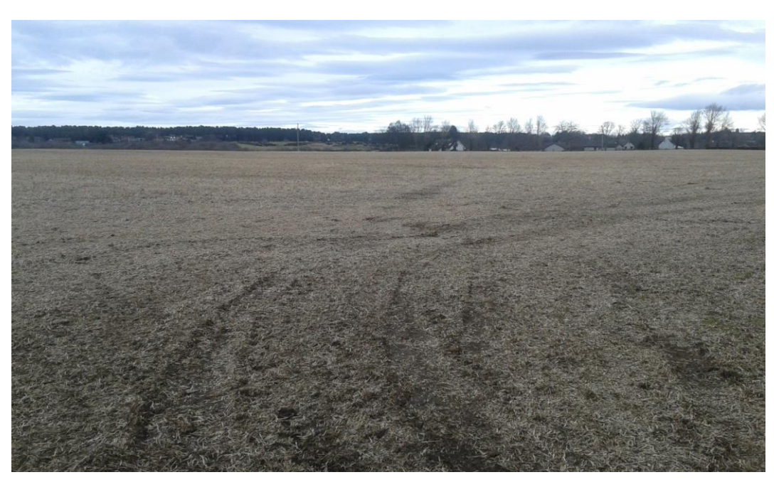
Plate 33. Parcel 12d after data collection, looking north-east