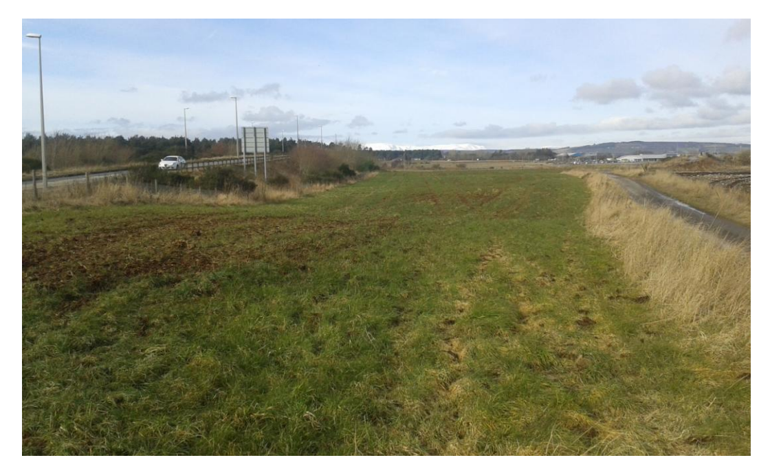
Plate 14. Parcel 8b after data collection, looking north-west