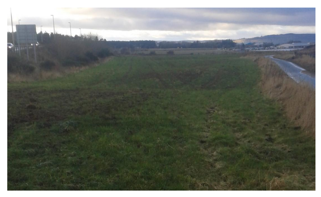
Plate 13. Parcel 8b before data collection, looking north-west