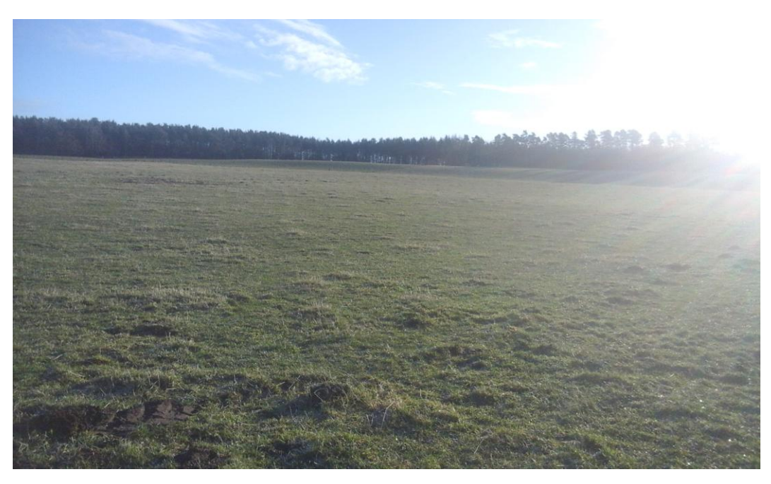
Plate 41. Parcel 14a and 14b after data collection, looking east