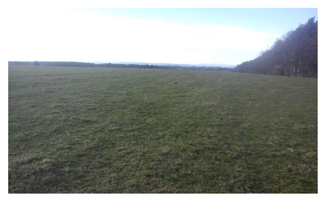
Plate 38. Parcel 14a before data collection, looking north