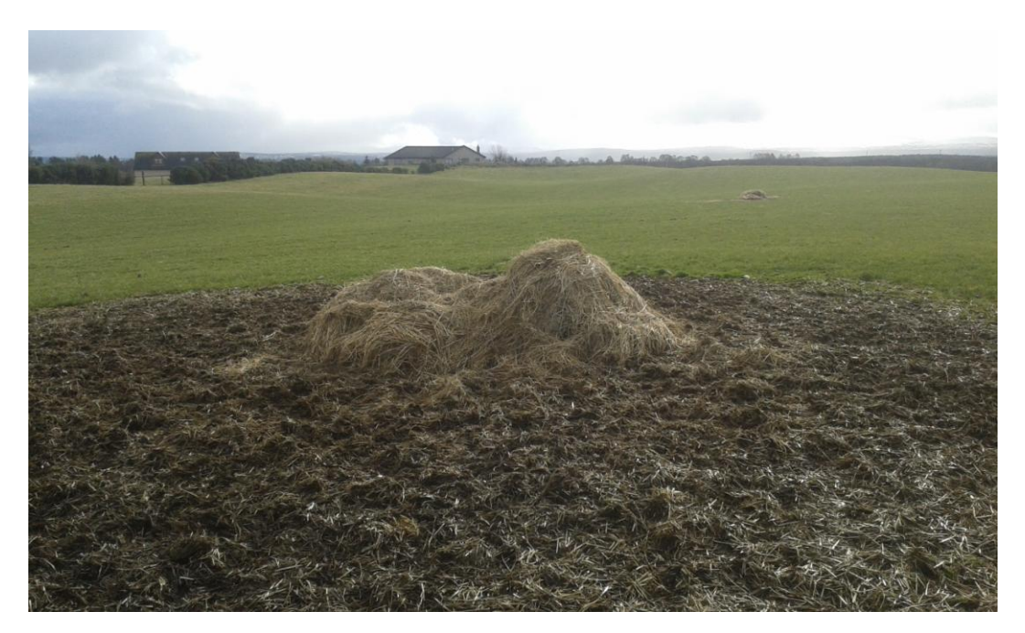
Plate 22. Parcel 10 after data collection, looking south-west