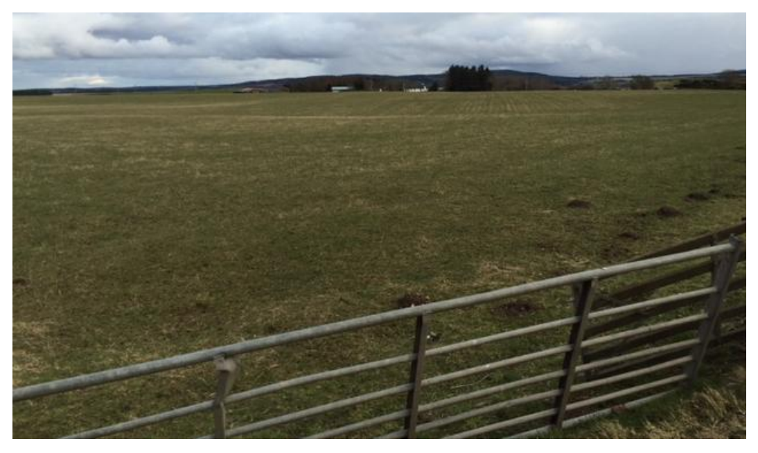
Plate 31. Parcel 12c before after data collection, looking east