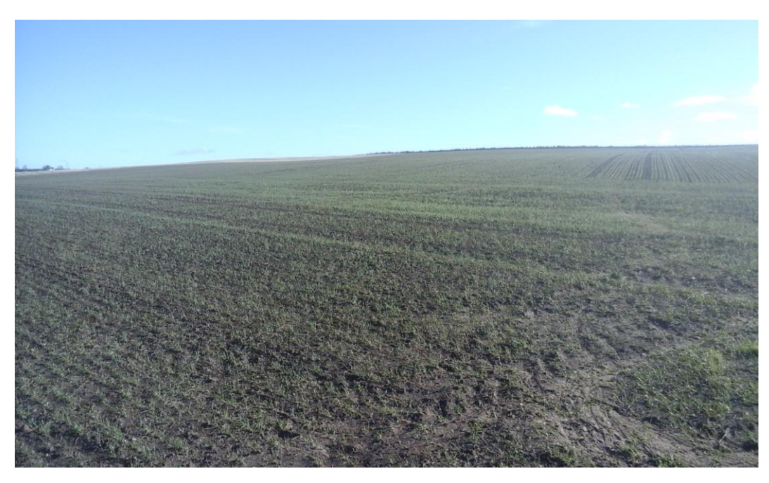
Plate 51. Parcel 16a before data collection, looking south-east