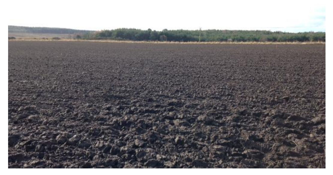
Plate 10. Parcel 7 after data collection, looking south-west