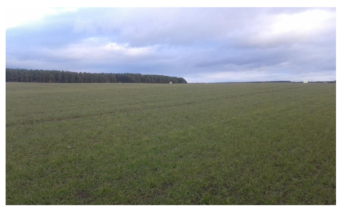
Plate 19. Parcel 9b before data collection, looking south-east