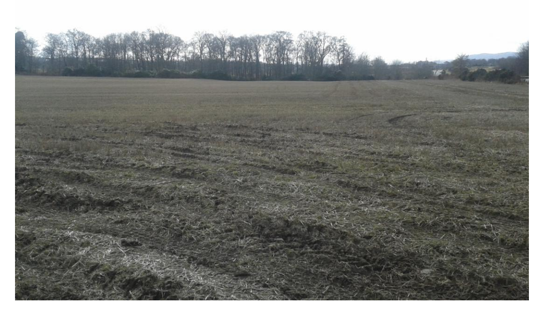
Plate 5. Parcel 3 before survey, looking south