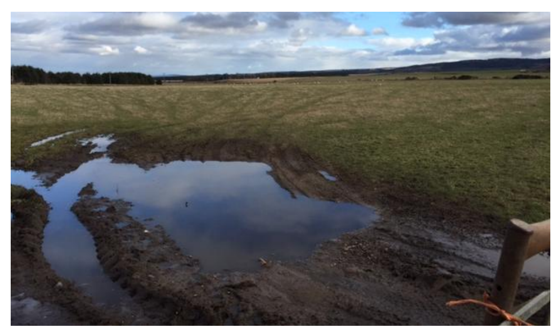
Plate 27. Parcel 12a before data collection, looking east