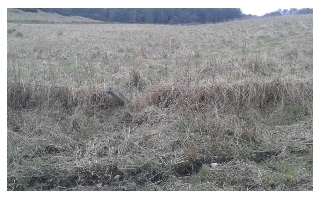
Plate 24. Parcel 11a after data collection, looking west