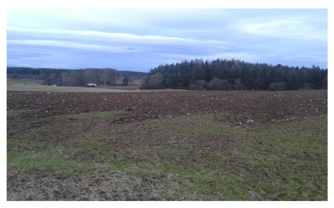
Plate 66. Parcel 18b before data collection, looking north-east