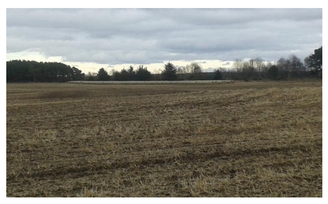
Plate 35. Parcel 13a before data collection, looking east