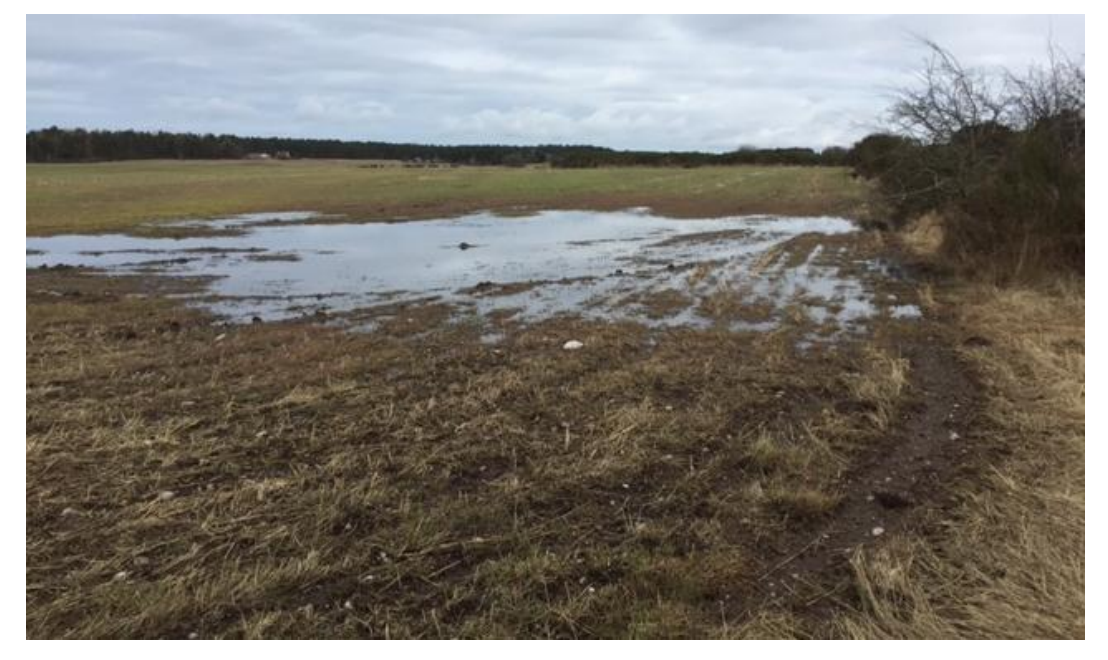
Plate 25. Parcel 11b before data collection, looking north-east