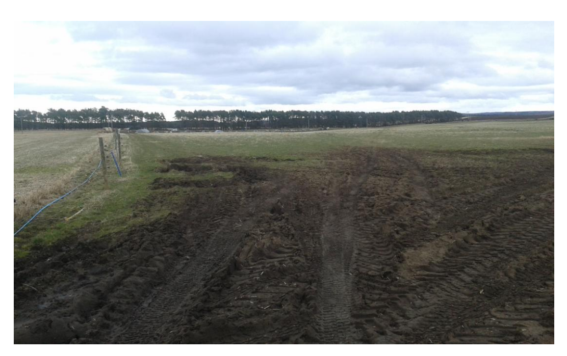
Plate 34. Parcel 12e after data collection, looking east