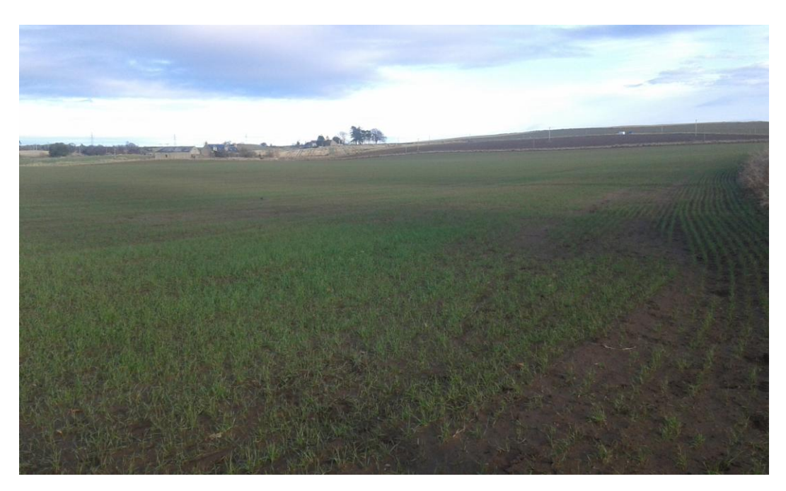
Plate 56. Parcel 16c after data collection, looking east