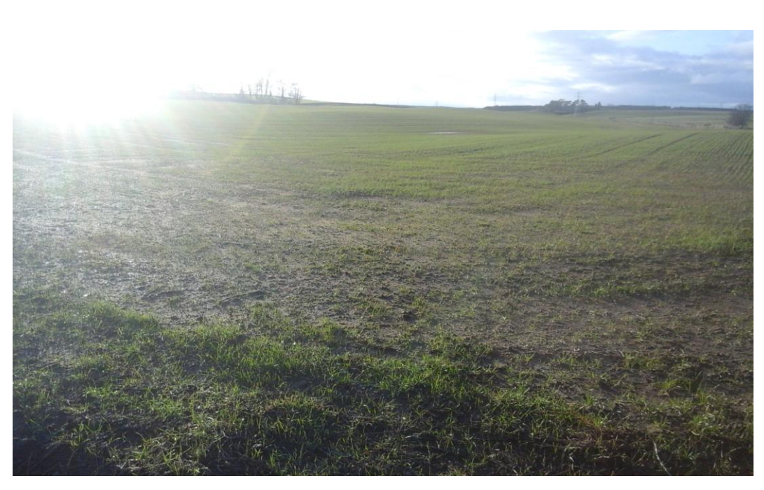
Plate 55. Parcel 16c before data collection, looking south-west