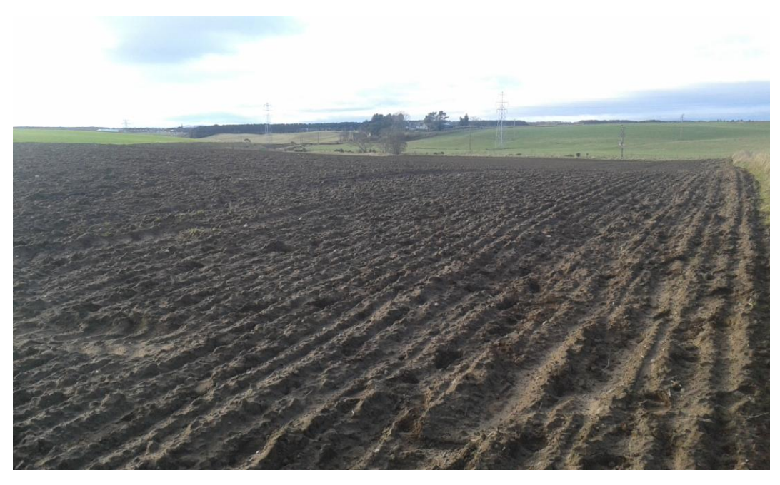
Plate 57. Parcel 16d after data collection, looking north-west