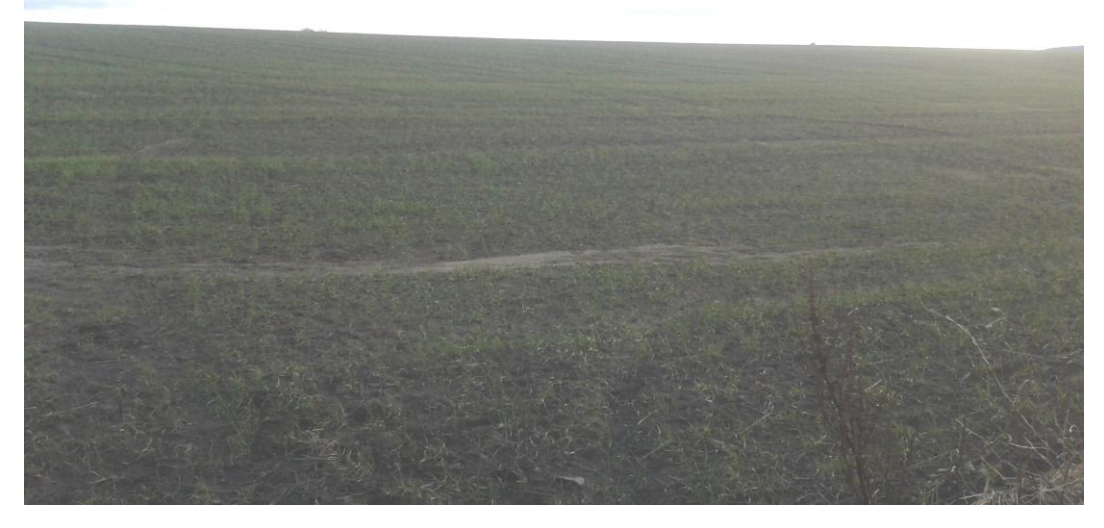
Plate 52. Parcel 16a after data collection, looking south-east