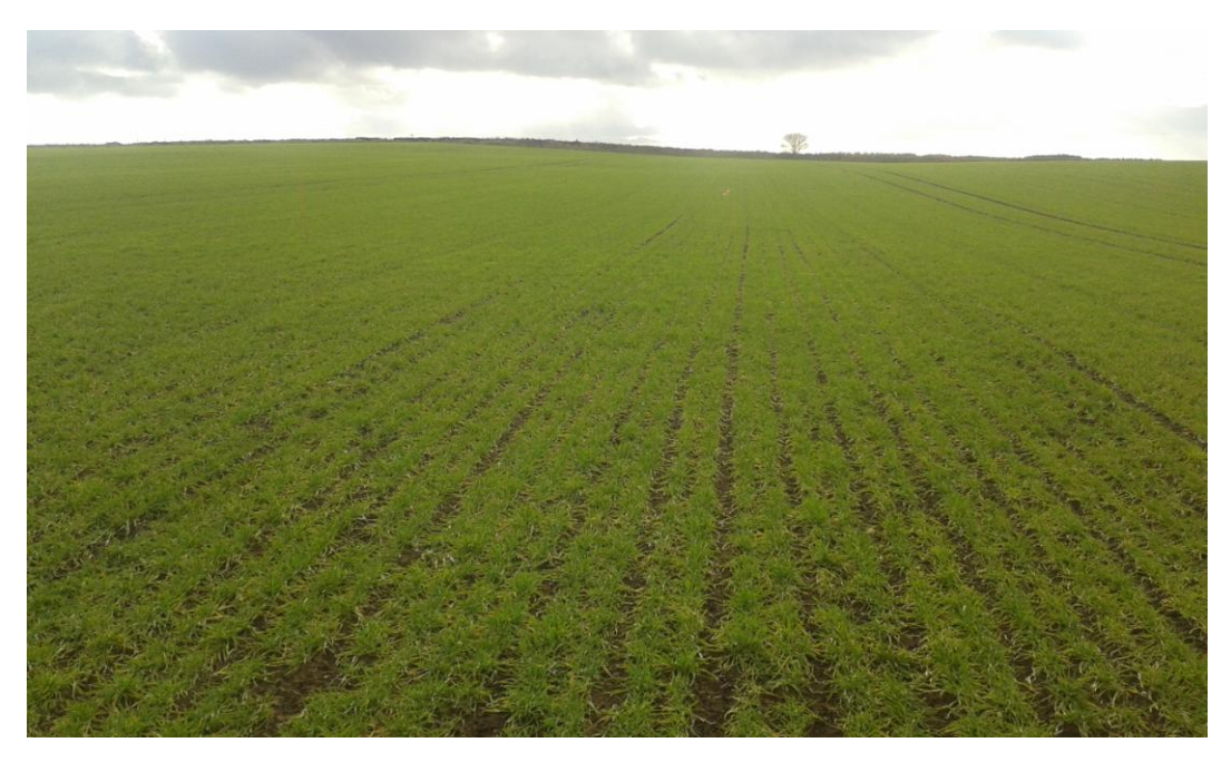
Plate 48. Parcel 15c before data collection, looking east