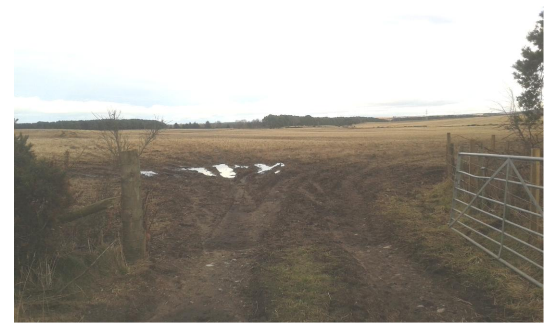
Plate 36. Parcel 13a after data collection, looking east