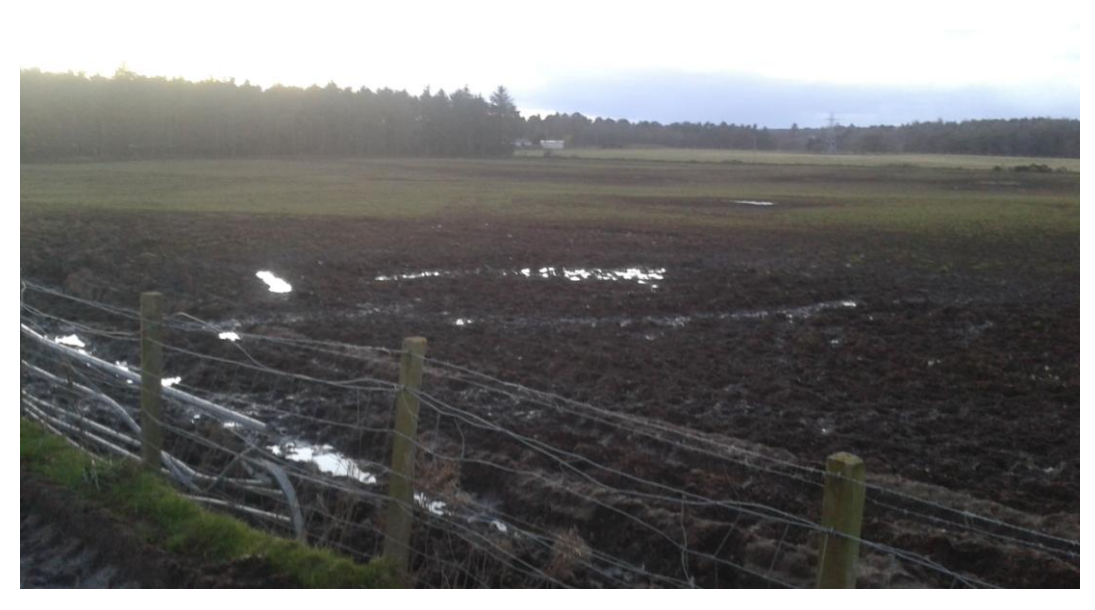
Plate 43. Parcel 14c after data collection, looking south-west