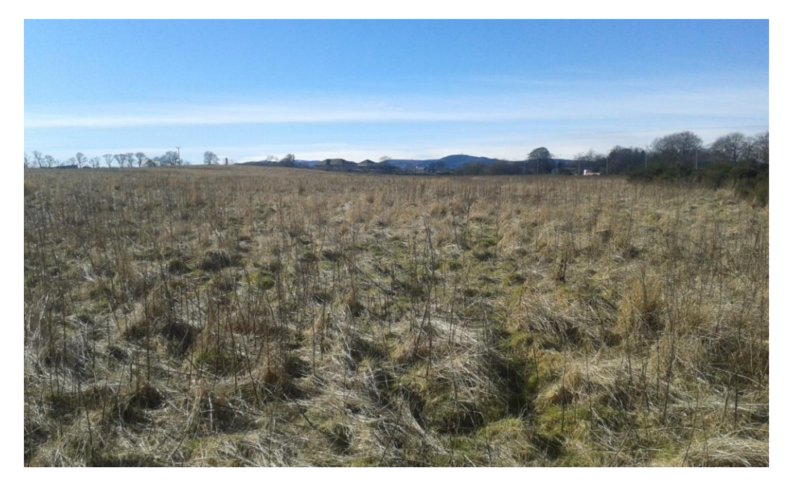
Plate 1. Parcel 1 before survey, looking south-west