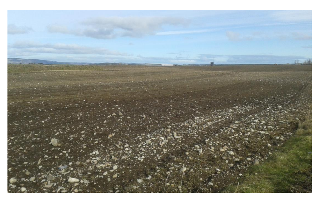
Plate 12. Parcel 8a after data collection, looking north-east