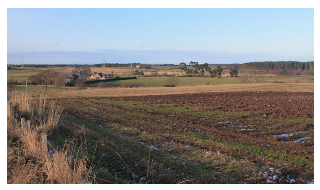
Plate 67. Parcel 18b after data collection, looking north-east