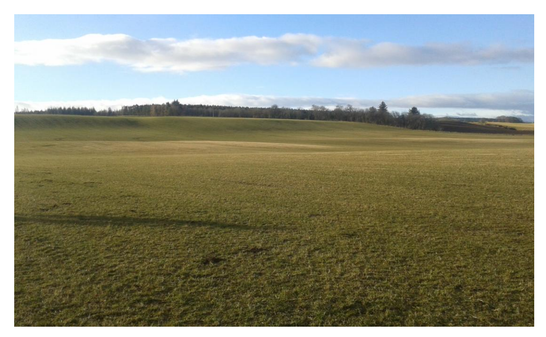
Plate 7. Parcel 5 before data collection, looking north-east