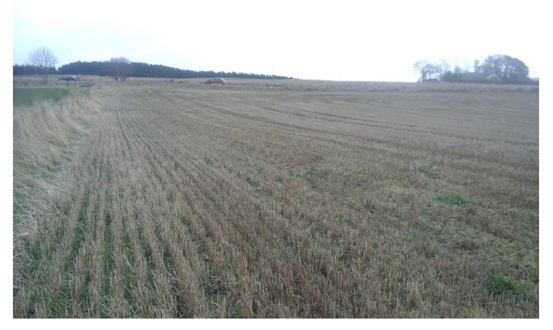
Plate 60. Parcel 17b before data collection, looking south