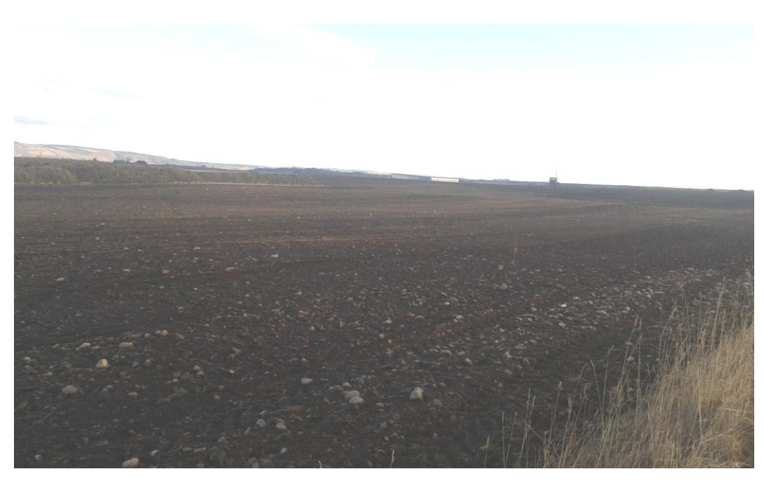
Plate 11. Parcel 8a before data collection, looking north-east