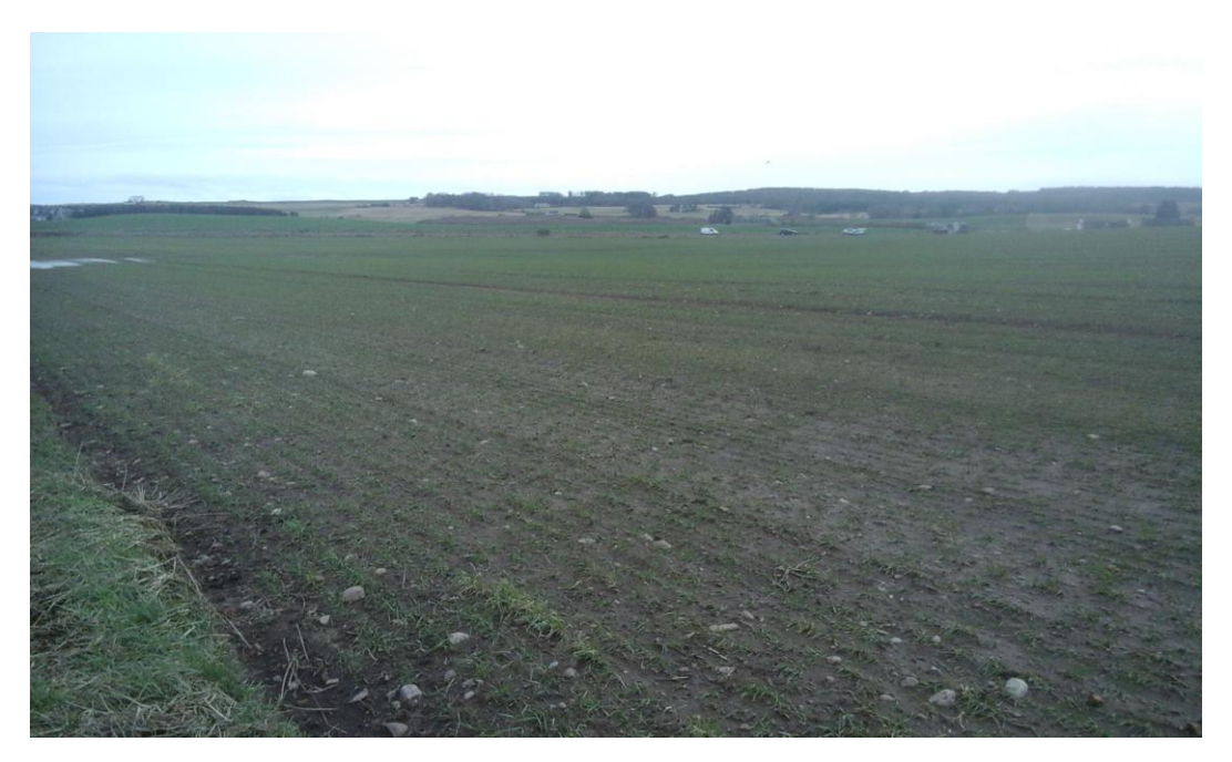
Plate 62. Parcel 17c before data collection, looking south