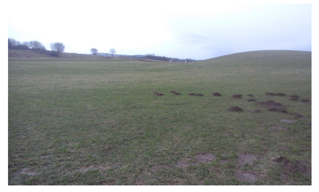
Plate 58. Parcel 17a before data collection, looking south-west