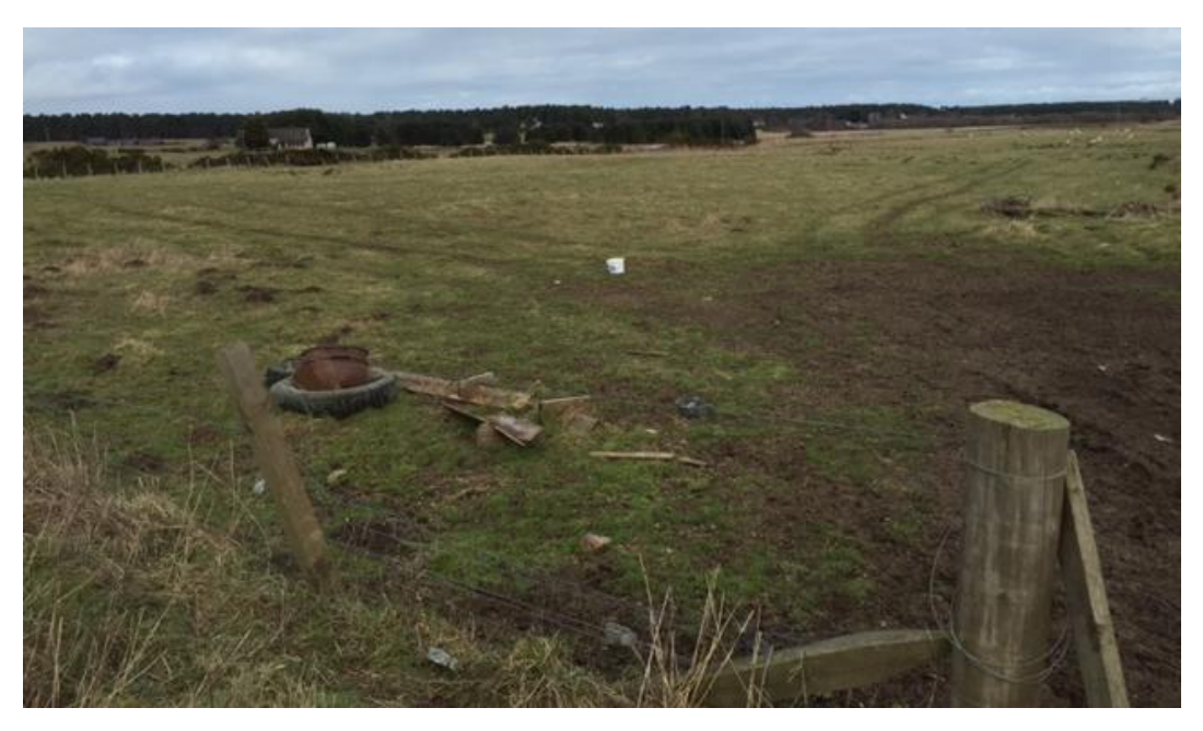
Plate 29. Parcel 12b before data collection, looking north