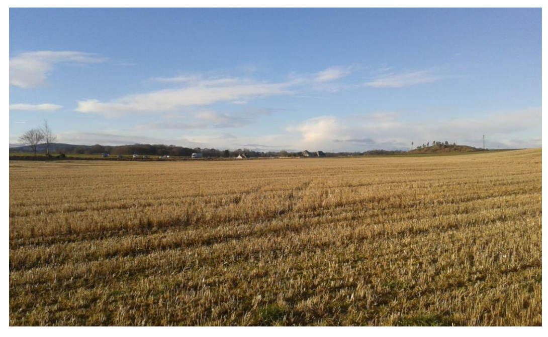
Plate 61. Parcel 17b after data collection, looking west