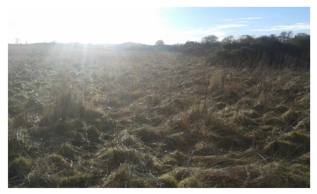
Plate 2. Parcel 1 after data collection, looking south-west