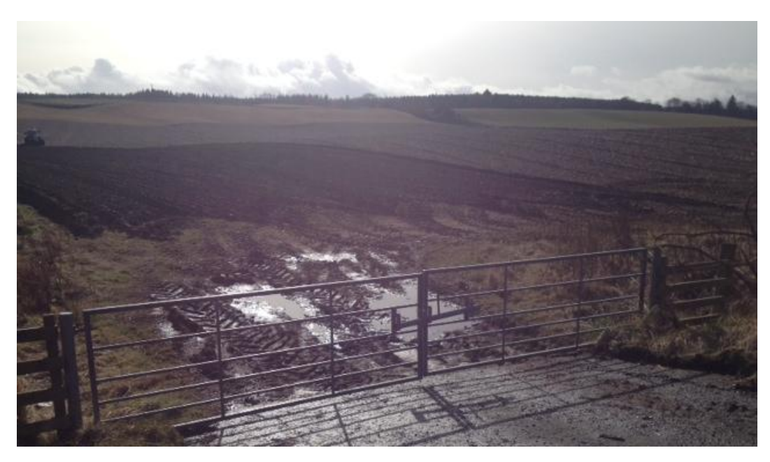
Plate 8. Parcel 5 after data collection, looking north-east