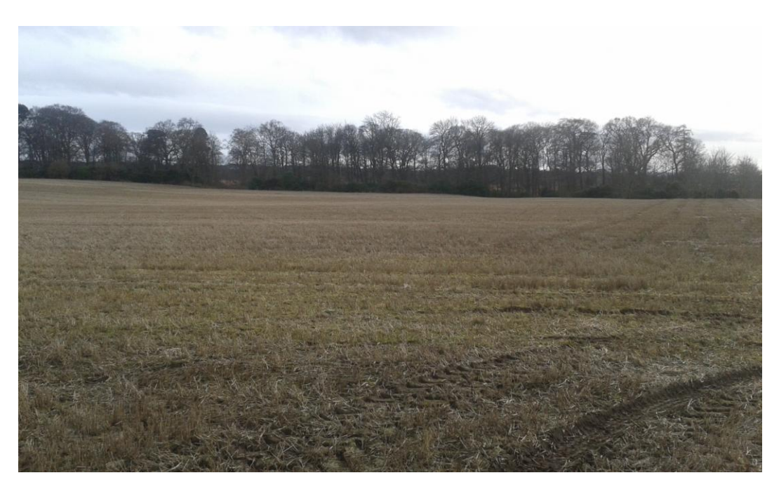
Plate 6. Parcel 3 after data collection, looking south