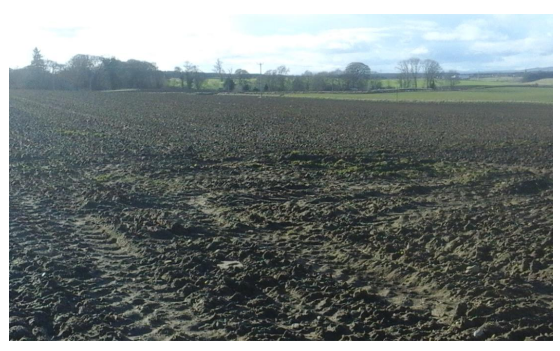
Plate 53. Parcel 16b before data collection, looking west