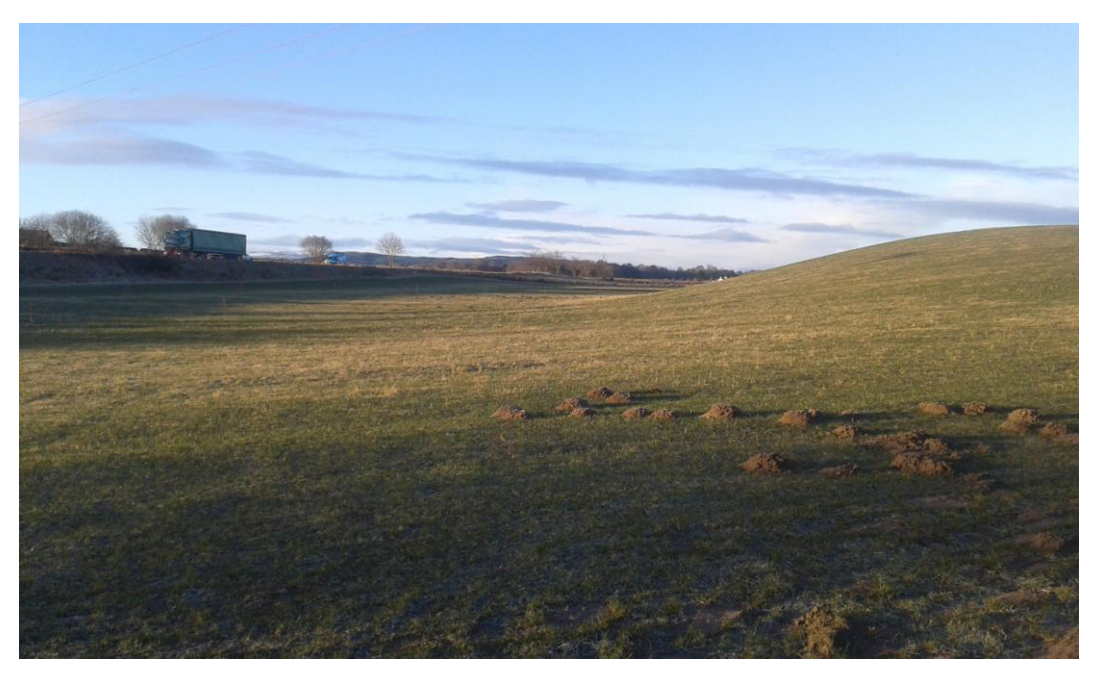
Plate 59. Parcel 17a after data collection, looking south-west