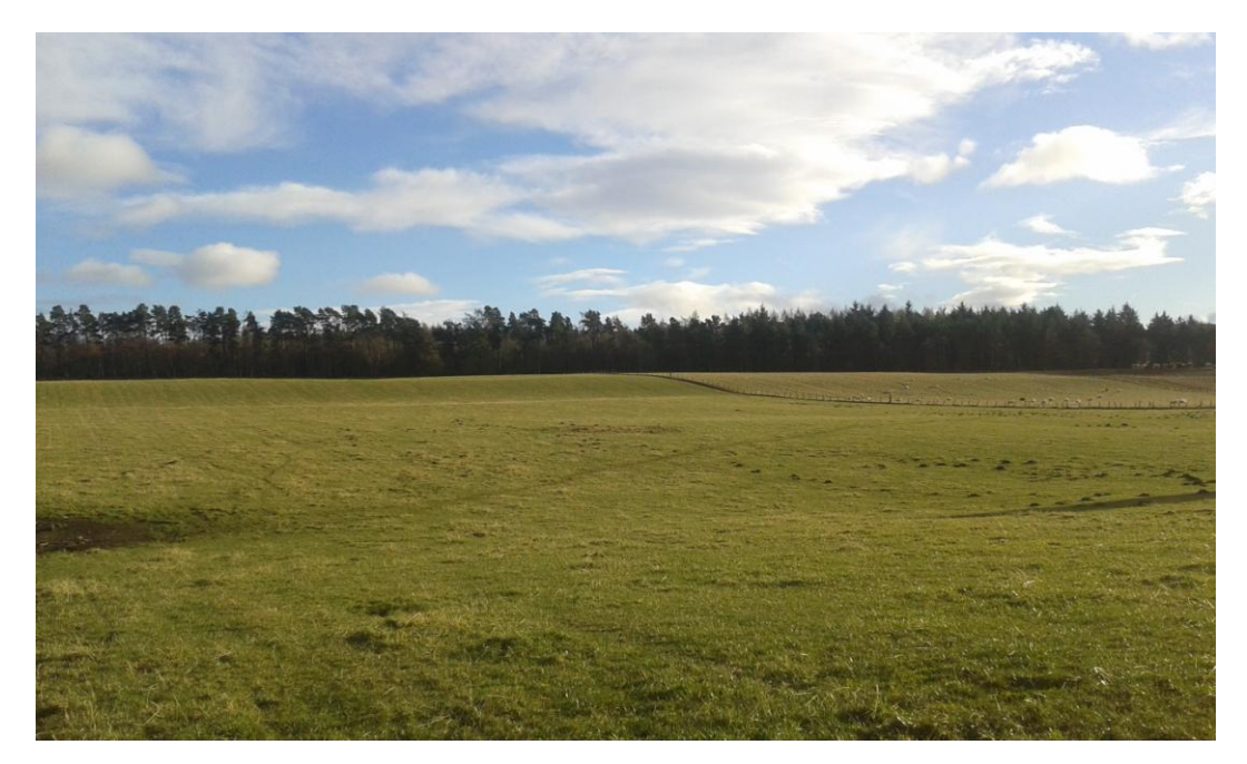
Plate 39. Parcel 14b after data collection, looking east