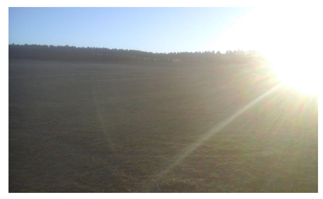
Plate 40. Parcel 14b before data collection, looking east