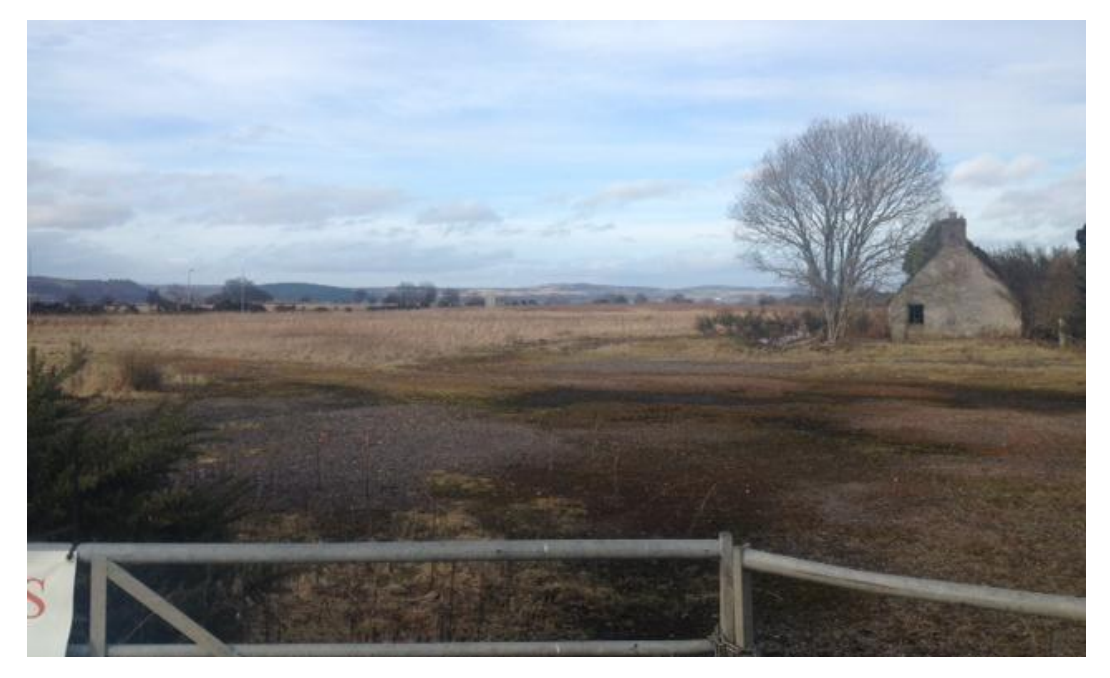
Plate 4. Parcel 2 after data collection, looking north