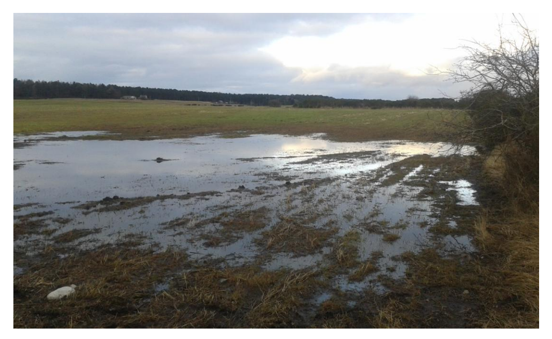
Plate 26. Parcel 11b after data collection, looking north-east