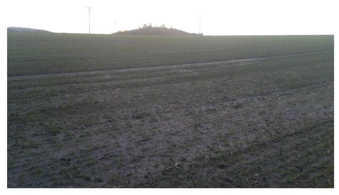
Plate 63. Parcel 17c after data collection, looking west