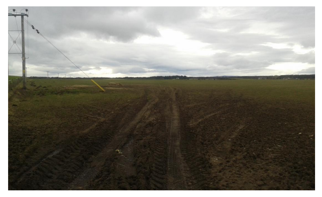
Plate 32. Parcel 12c after before data collection, looking west