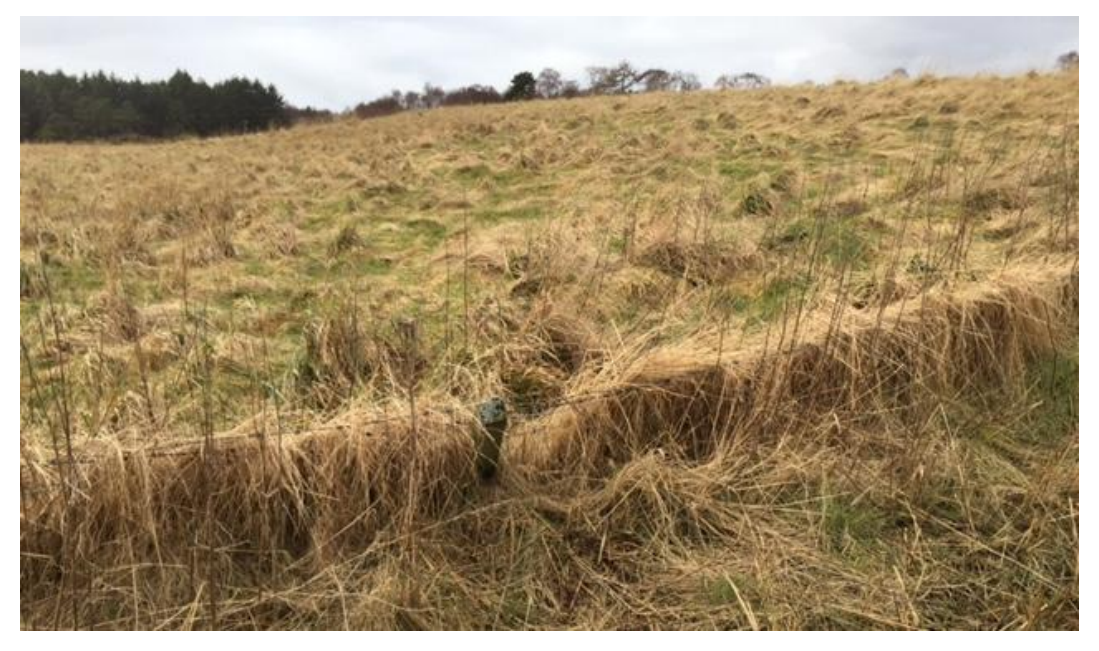
Plate 23. Parcel 11a before data collection, looking west