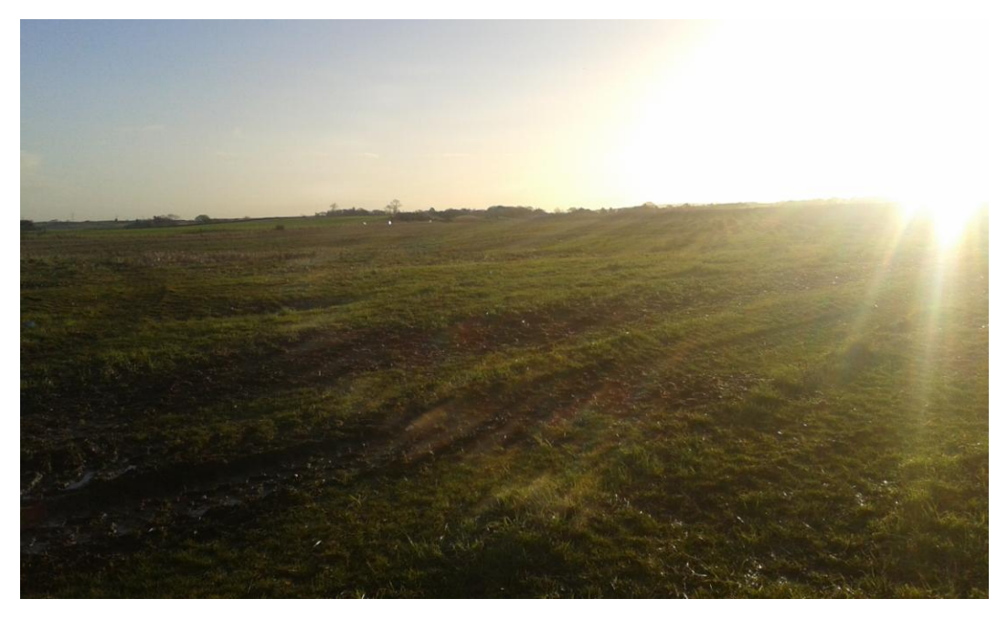
Plate 44. Parcel 15a before data collection, looking north-east