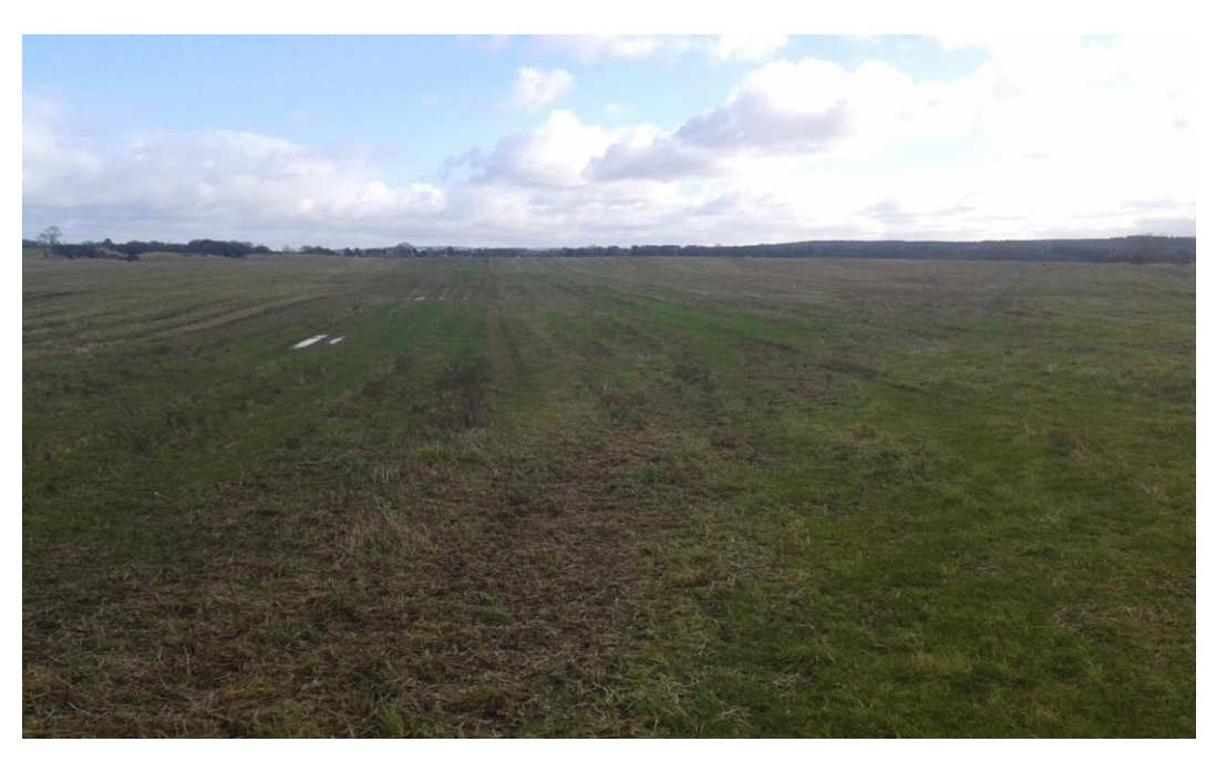
Plate 45. Parcel 15a after data collection, looking north-east