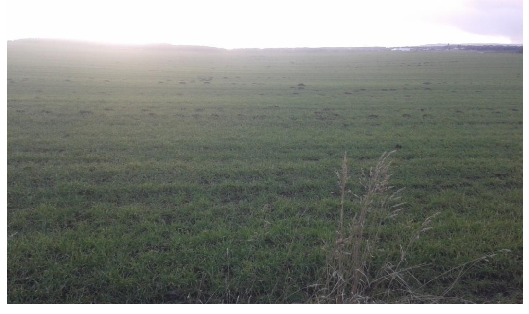
Plate 47. Parcel 15b after data collection, looking south-west