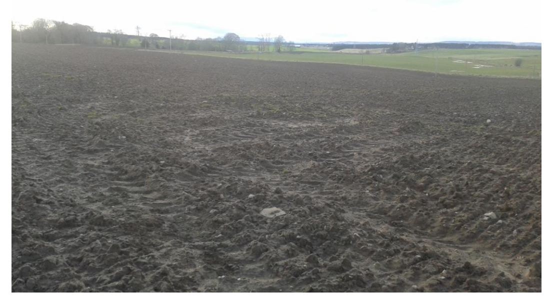
Plate 54. Parcel 16b after data collection, looking west