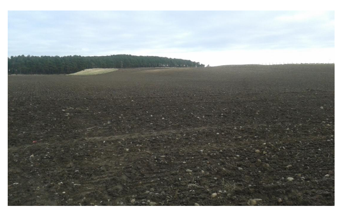
Plate 18. Parcel 9a after data collection, looking north-east