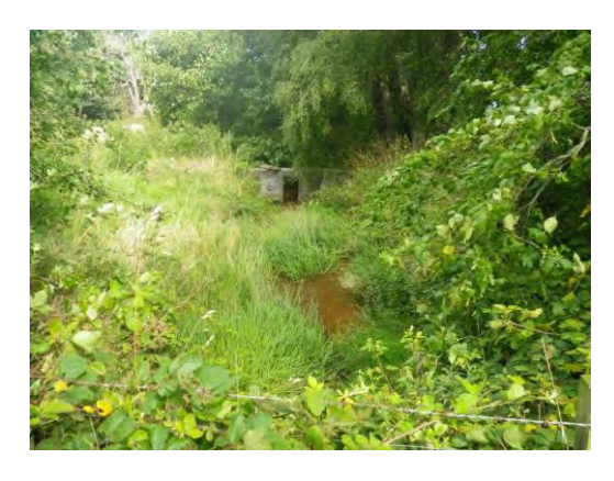
SWF 17: Drains at Culblair

SWF 17 appears to be an artificial ditch with one drainage pond branching off it and feeding another pond at Culblair Farm. There is no riparian zone and the surrounding land use appears to be rough pasture for grazing and marshland. A road also runs alongside the drain.