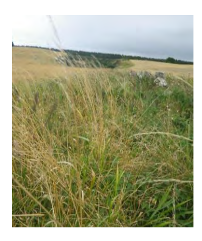
SWF 10: Indirect tributary of Rough Burn (1)

SWF 10 is very short and flows in a north-westerly direction from High Wood into SWF 08. The upper section of this SWF has an extensive riparian zone as it flows within a wood. The lower section flows through tilled land and has a riparian zone extending to approximately 20m either side of the channel. The exception to this is the last 200m before the confluence with SWF 08, where there is no riparian zone. This last section has undergone high impact realignment to a straight channel planform.