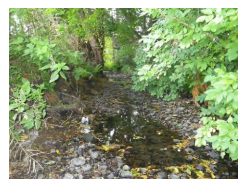
SWF 06: Kenneth's Black Well

SWF 06 is formed from drains on Culloden Muir. It has a sinuous planform as it flows along a moderate gradient in a north-westerly direction through Culloden Wood. The gradient becomes gentler as it flows through the urban settlement of Culloden, where it appears to have been realigned and culverted in places. The SWF has also been realigned to a straight planform as it flows out of Culloden and along a minor road in agricultural land and through some residential gardens by Milton of Culloden Smallholdings. It is also culverted to flow under the A96 and the railway, after which it meets SWF 03.