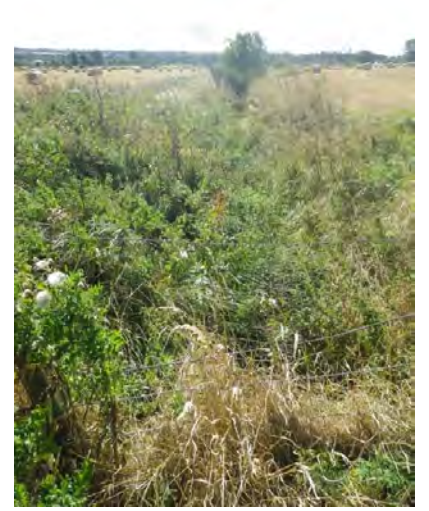
SWF 07: Drain at Allanfearn

SWF 07 is a straightened drain with right angle bends that runs along field boundaries. The banks have been reprofiled and the channel overdeepened to create a trapezoidal channel.