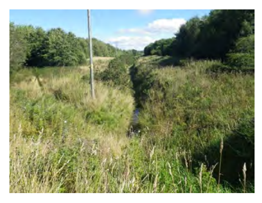
SWF 20: Tributary of Balnagowan Burn

SWF 20 appears to have been realigned along its entire length. There are two predominant land uses: mixed woodland and mixed farming (arable and pasture for grazing). The riparian zone is extensive where mixed woodland is the adjacent land use. Where arable land or rough pasture is adjacent there is a thin strip of riparian buffer zone. Aerial photography indicates the dominant vegetation to be grass and shrubs, with no trees.