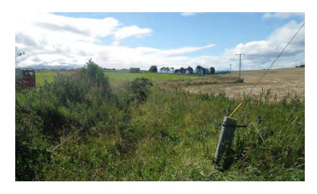
SWF 19: Balnagowan Burn

SWF 19 is classed as a WFD water body with Bad ecological status. It flows over a relatively gentle gradient towards the sea. Land use is mixed farming for arable and livestock. There is no riparian zone along any of this SWF.