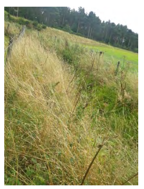
SWF 15: Tributary of 'Unnamed Burn - Castle Stuart to source (Tornagrain)' (2)

SWF 15 is a very short tributary of SWF 13.