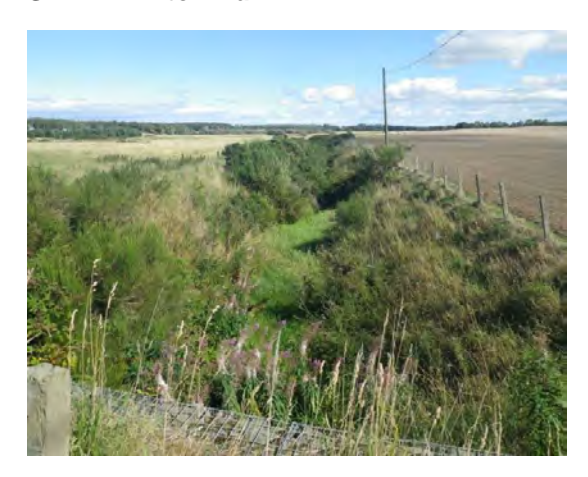
SWF 22: Alton Burn

SWF 22 flows along a very gentle gradient over a variety of land uses. The predominant land use is mixed farming (rough pasture for grazing and arable). However, the river also flows through the urban area of Nairn.