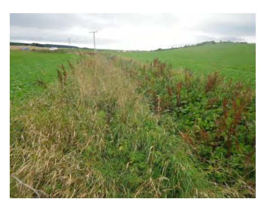
SWF 09: Tributary of Rough Burn

SWF 09 flows over forestry and agricultural (arable) land use. Through the arable land the channel is very straight and is choked with vegetation, which suggests it is a sediment sink. The riparian zone is non-existent along most of its length, except where it flows out of the woodland into the agricultural land. Here there is a distinct lack of trees and channel shading along the channel.