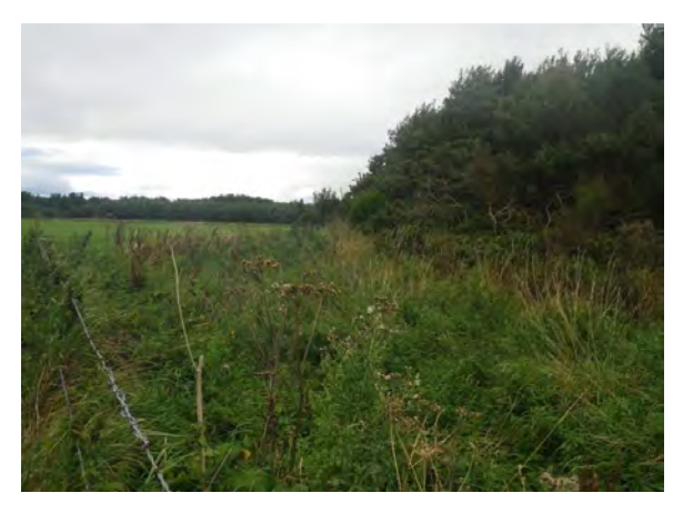
SWF 13: Tributary of 'Unnamed Burn - Castle Stuart to source (Tornagrain)' (1)

SWF 03 flows along a moderate gradient across arable agricultural land above Kerrowaird Farm, and along a low gradient downstream of this. The SWF is an agricultural drain that is very narrow with reprofiled banks and choked with vegetation.