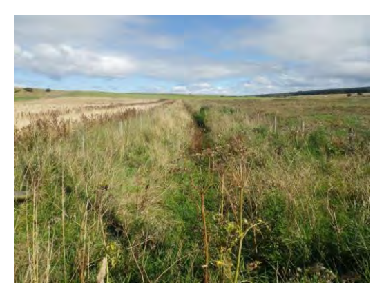
SWF 08: Fiddler's Burn

SWF 08 flows from springs at Viewhill down a relatively steep gradient along a natural, sinuous planform in woodland on the south-western side of Balloch. Part of the channel is culverted under streets in Balloch, but then continues along a natural, sinuous course through woodland. The SWF then becomes culverted at the edge of Balloch and emerges in agricultural fields to the north-west of the town. From this point the SWF is effectively an agricultural drain flowing along a very low gradient following an artificially straightened planform, with right angled bends and reprofiled banks as it flows towards the sea. The riparian zone in the agricultural land is non-existent and there is no buffer strip and no trees. The channel is choked with vegetation.