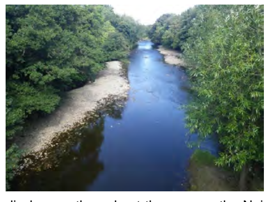
SWF 23: River Nairn

SWF 23 is divided into two WFD water bodies. The water body that the proposed route options could impact is the River Nairn – Moray Firth to River Farnack confluence, which has Good ecological status. This SWF is a relatively large, mid-altitude, siliceous river and flows for approximately 56km towards the Moray Firth after rising in the Monadhliath mountains.