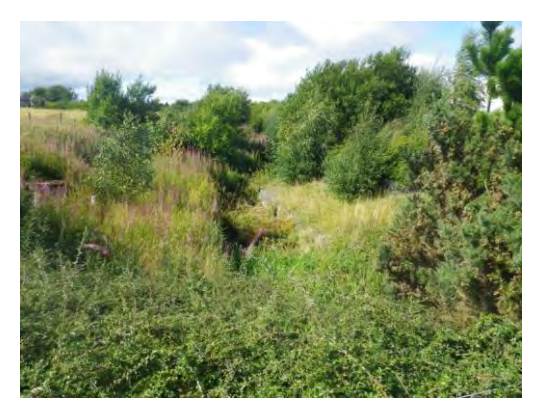
SWF 01: Inshes Burn

SWF 01 begins just south of Balvonie Wood, through which it then flows north-west towards Dell of Inshes along a moderate-high gradient. Down to Dell of Inshes, it flows along a natural, sinuous planform and is lined continuously with broadleaf trees. The channel is relatively small and appears to have a coarse gravel bed with vegetated banks. Land use adjacent to this section is predominantly agricultural.