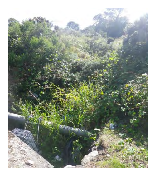
SWF 02: Scretan Burn

SWF 02 flows through arable agricultural land along a low gradient from the edge of Cradlehall to the sea. The riparian zone is varied, ranging from non-existent/scattered trees (along most of the SWF), to continuous on both banks (downstream of the A96). Aerial photography suggests that there are a mixture of trees and shrubs where there is a riparian zone.