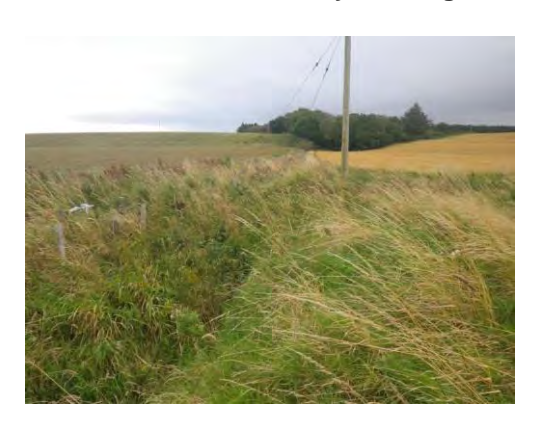
SWF 11: Indirect tributary of Rough Burn (2)

SWF 11 is very short and flows in a north-westerly direction. Most of this SWF is lined with woodland, which looks from aerial photography to be deciduous. Its flows down a moderate to steep gradient and after it exits the woodland there is a short section where it has been realigned to a straight planform. Here, the banks have been reprofiled and the channel overdeepened, creating a trapezoidal cross section.