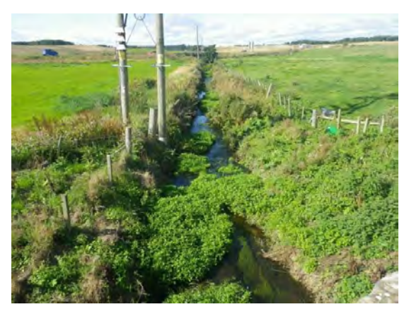
SWF 26: Auldearn Burn

SWF 26 is approximately 11.2km long. It is a WFD water body with Moderate ecological status and is classed as a small, lowland calcareous river. Gradient is variable along the length of this river; it is relatively steep in the upper reaches becoming progressively gentler as it flows towards SWF 23.