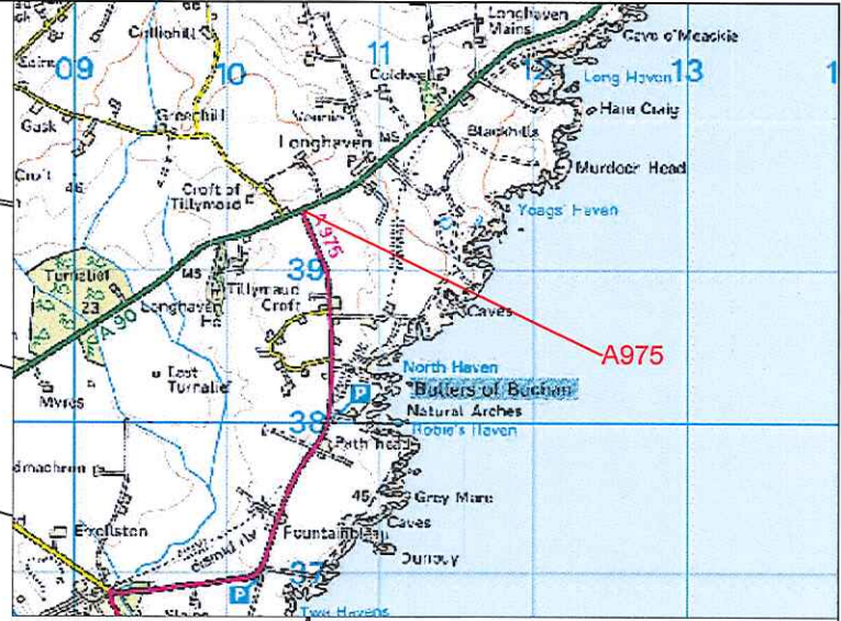
Location Plan (Not To Scale)