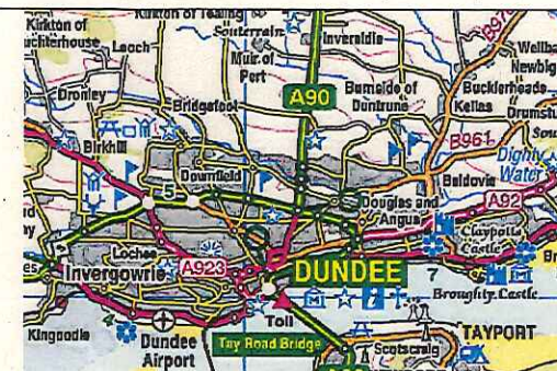
Location Plan (Not To Scale)