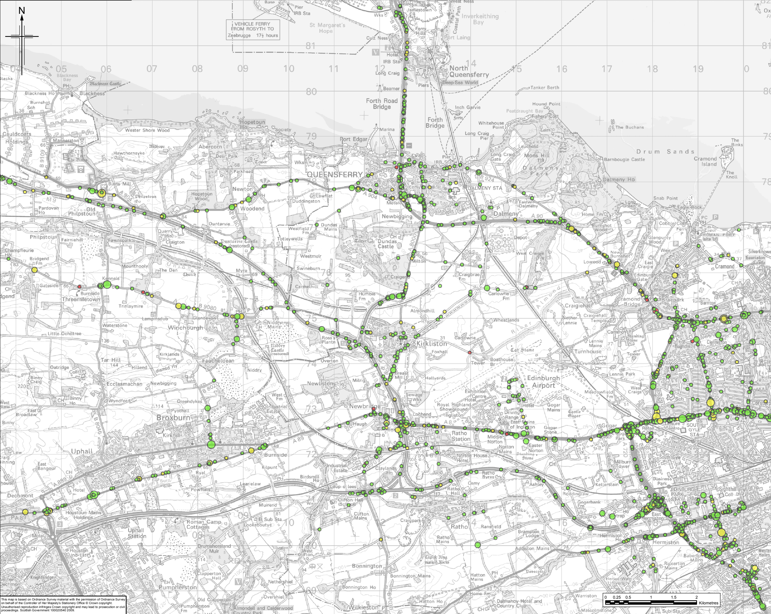
Drawing number / Rev FIGURE 2.6

Created by: ARUP File\\Global.arup.com\\europe\\Leeds\\Non-Jobs\\Geographic Information Systems\\Projects\\FNC\\Accident_Data\\MXD\\AccidentData_101008.mxd Date: 11/03/2009 16:50:38 Drawn by: VW