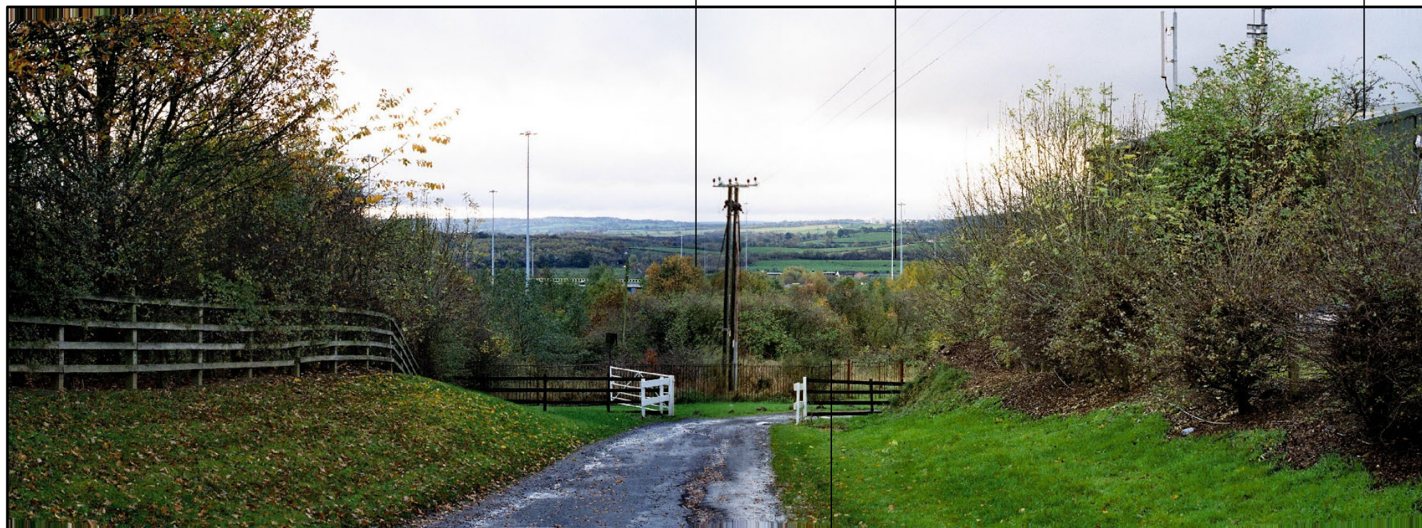
PROPOSED LOCATION OF NETWORK 3 SUDS FACILITY

J:\n53213a\Current\ANI Stage 3\ pl01560.dwg