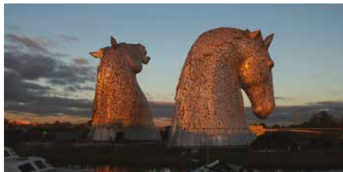
Above Kelpies at dusk