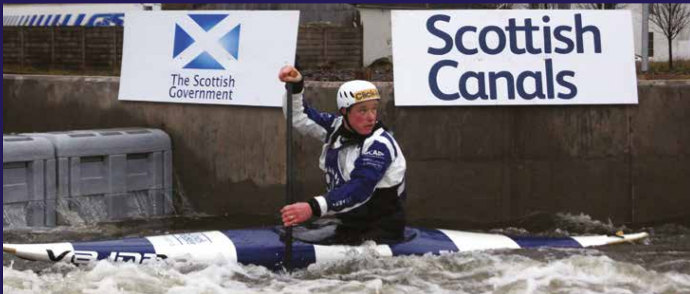
Above Paddler at Pinkston Watersports Centre, Glasgow