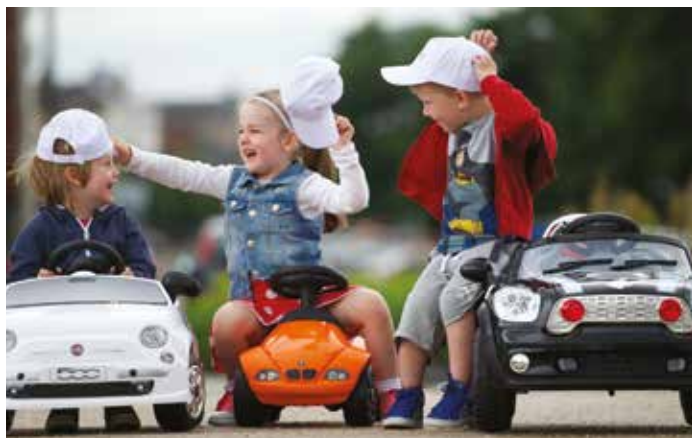
Above Parental Influence Road Safety Campaign

The multi-agency A9 Safety Group entered its second year since being set up in 2012. The main aim of the group is to explore measures to help reduce road casualties, both before and throughout the A9 dualling programme. As part of this work, the Minister for Transport and Veterans announced the Safety Group's recommendation that an average speed camera system be delivered on the route, between Dunblane and