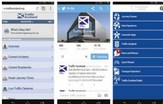
Above Traffic Scotland social media page