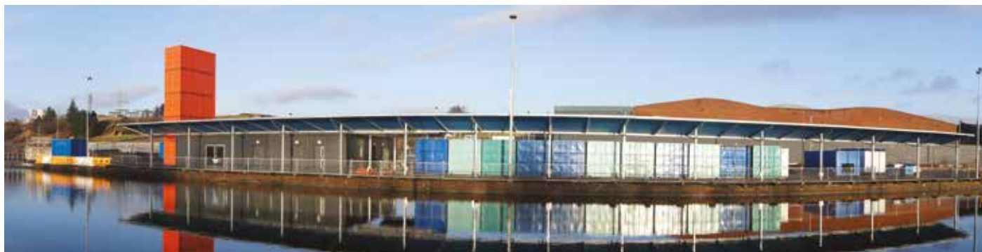
Above Pinkston Watersports Centre, Forth & Clyde Canal, Glasgow

Transport Scotland has continued to work with airlines and airports to develop international air links and in 2013 we helped secure new services from Edinburgh to Chicago, Philadelphia and Doha and worked with the Isle of Man Government to help restore a link between Glasgow and the Isle of Man.