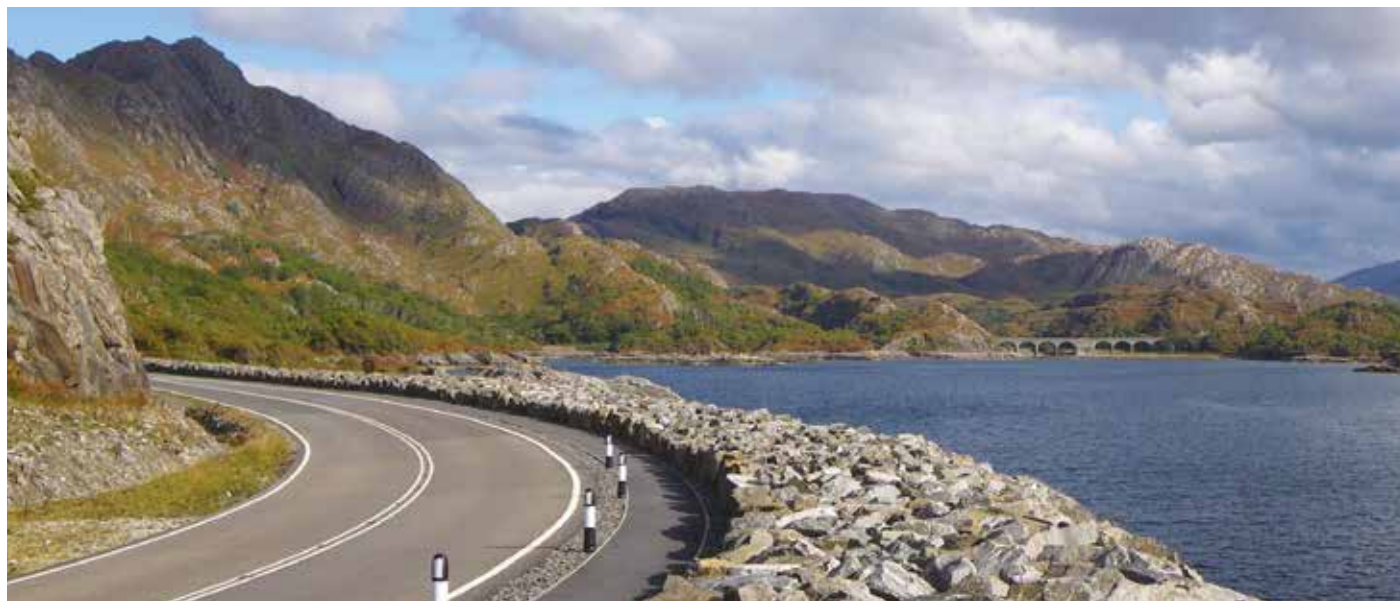
Above A830 Loch nan Uamh

We launched a new landscape policy document for Transport Scotland – Fitting Landscapes . This is a completely revised, refreshed and updated policy which builds on the success of the previous document ( Cost Effective Landscape: Learning from Nature ) and places greater emphasis on sustainability and design quality.