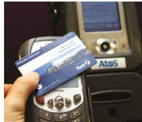
Above Smart ticket

Road Safety Scotland (RSS) has invested substantially in education resources, notably this year in the new Early Years approach, as well as other education and publicity resources for use at exhibitions and events by staff and external partners. RSS, in collaboration with the Scottish Government Marketing team, launched a Parental Influence social marketing campaign in July 2013. This was a ground-breaking campaign targeting parents and other adults who drive