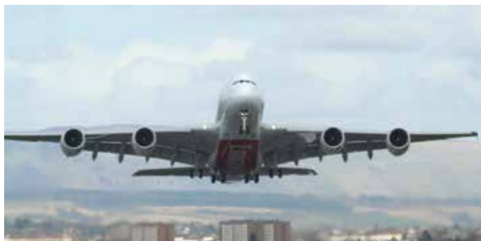
Above Airbus A830 over Glasgow