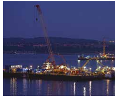
Left Forth Replacement Crossing Team record Above Forth Replacement Crossing right central tower construction

The Forth Replacement Crossing Project has seen a total of £145 million worth of savings since construction on the project commenced in June 2011. In September 2013, a new budget range for the Crossing was established as £1.4 – 1.45 billion (reduced from £1.45 – 1.6 billion).