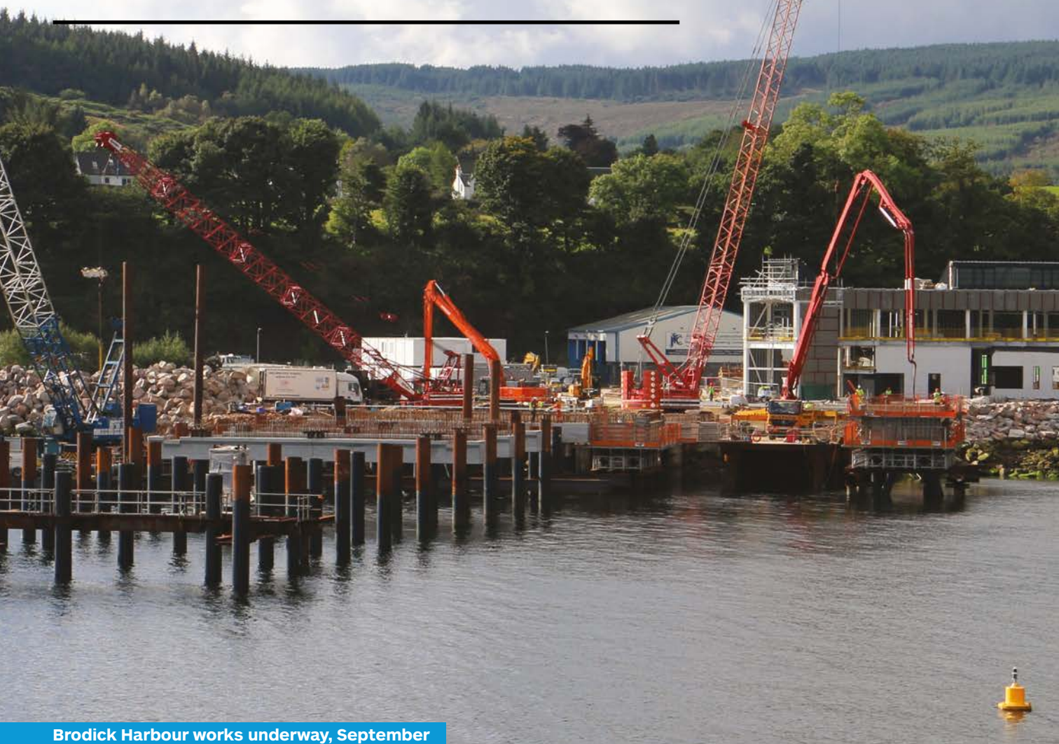
Brodick Harbour works underway, September

Building on our commitment to improve connectivity, maximise opportunities for tourism, business and leisure, whilst supporting sustainable economic growth, this year has seen highs of new charter routes around the world as well as the start of the new lifeline Clyde and Hebrides ferry services contract.