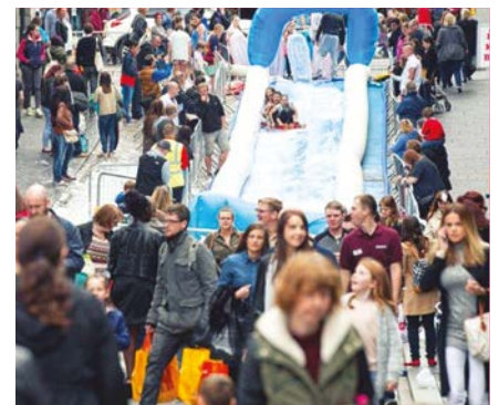
'In town without my car' SCSP event, Aberdeen

Local authorities have also been targeting potential behaviour change, with activities such as promotion of infrastructure, like cycle ways, or with events like 'town car free days'.