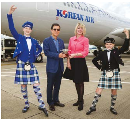
August saw the inaugural Seoul – Glasgow flight'.

Over the year the £800,000 grant for Mode Shift Revenue Support (MSRS) has supported eight rail freight flows, removing around 100,000 HGV journeys from our roads.