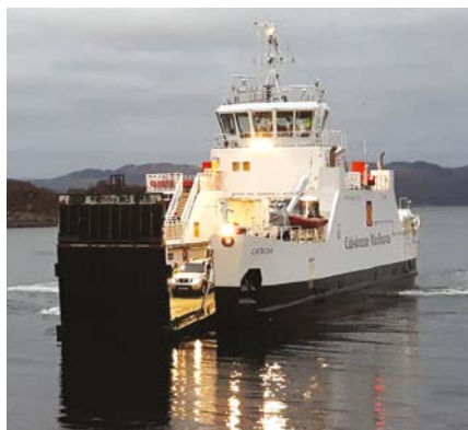
MV Catriona in service, Tarbert

The Cabinet Secretary for Rural Economy and Climate Change gave the opening address at the World Canals Conference. Hosted by partner organisation Scottish Canals in Inverness in September, it was attended by over 300 delegates from around the world.