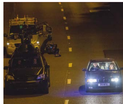
Trainspotting 2 filming session on A725 Motherwell/Bellshill