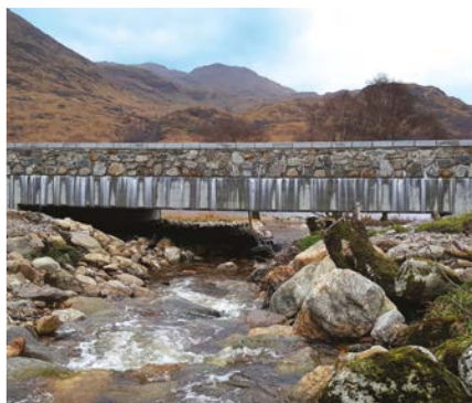
A830 'Road to Isles' Ranochan bridge restored using recycled stone

We were also pleased to support Scotland's filming industry, with a number of our scenic routes showcased on the big screen. Amongst the filming permissions granted and facilitated was the A1 in Steven Spielberg's 'BFG'; the A82 in Amazon's 'Grand Tour' and the Forth Bridge and A725 in Danny Boyle's 'T2 Trainspotting'.