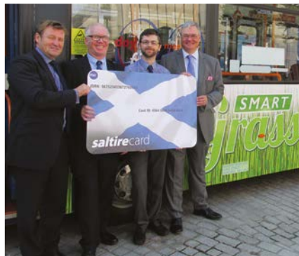
Multi-operator Smart ticketing launch in Aberdeen