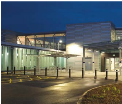
Edinburgh Gateway Interchange