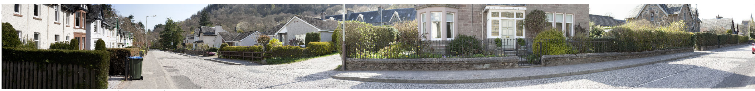
Viewpoint 6 - Perth Road, NCR 77 and Core Path, Birnam