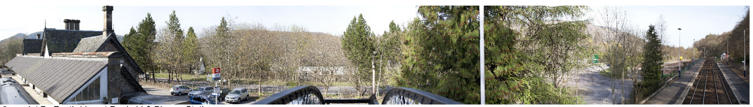
Viewpoint 7 - Footbridge at Dunkeld & Birnam Station