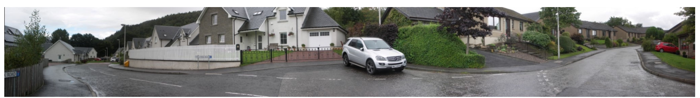
Viewpoint 8 - Telford Gardens, Little Dunkeld