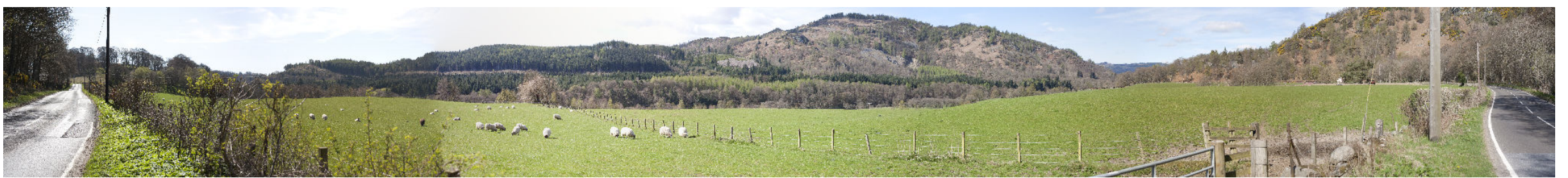
Viewpoint 3 - A984, near Newtyle Farm