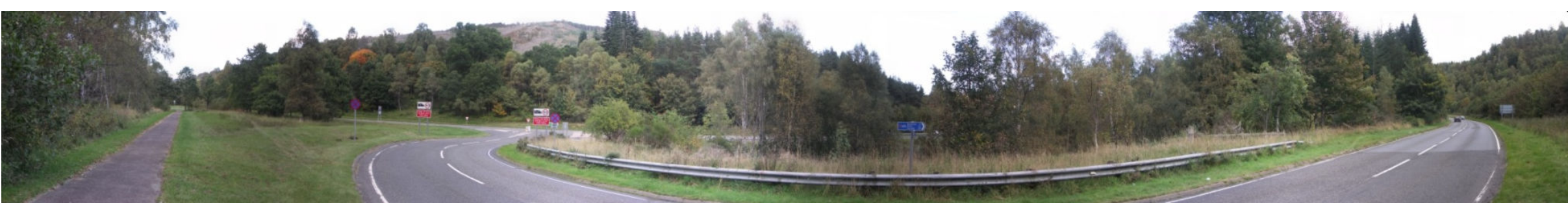
Viewpoint 4 - B867 / NCR 77