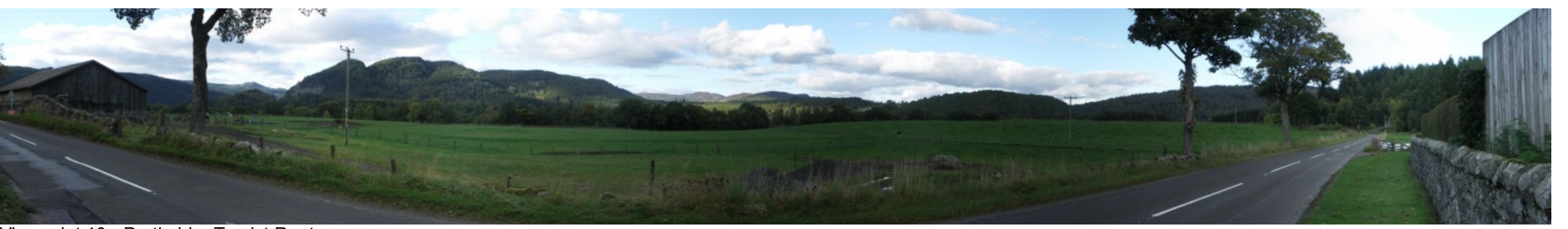
Viewpoint 10 - Perthshire Tourist Route