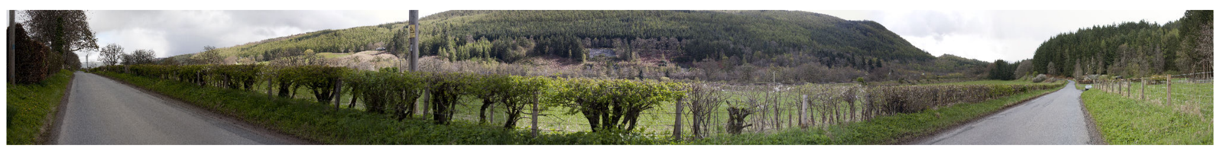
Viewpoint 18 - B898/NCR 77, Inchmagrannachan