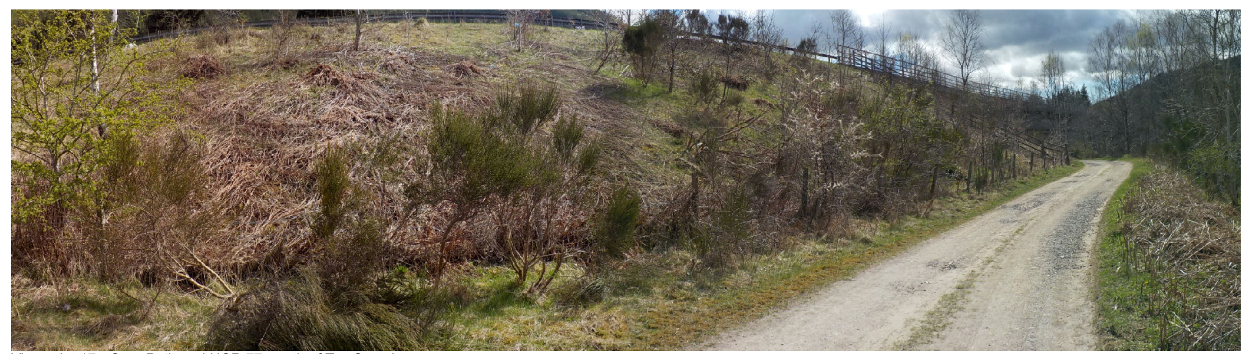
Viewpoint 17 - Core Path and NCR 77, north of Tay Crossing