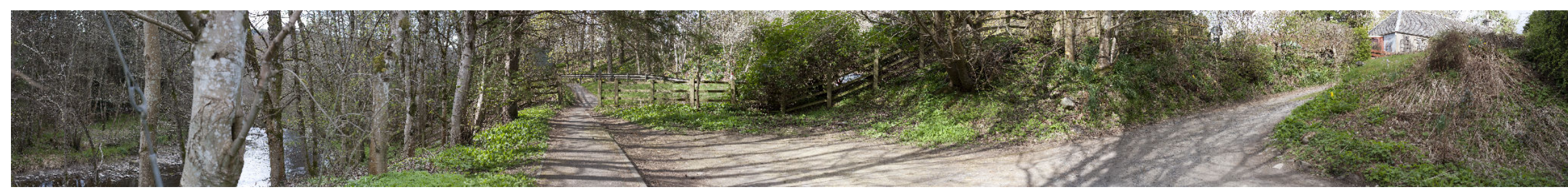
Viewpoint 13 - Core Path, northern edge of Inver