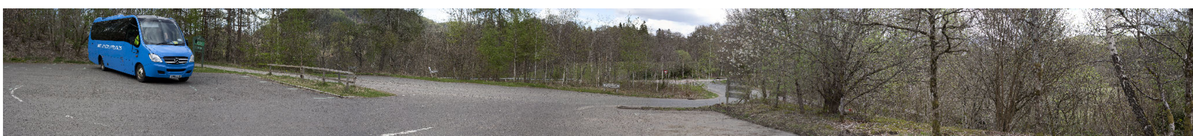
Viewpoint 14 - Car park at The Hermitage Garden and Designed Landscape