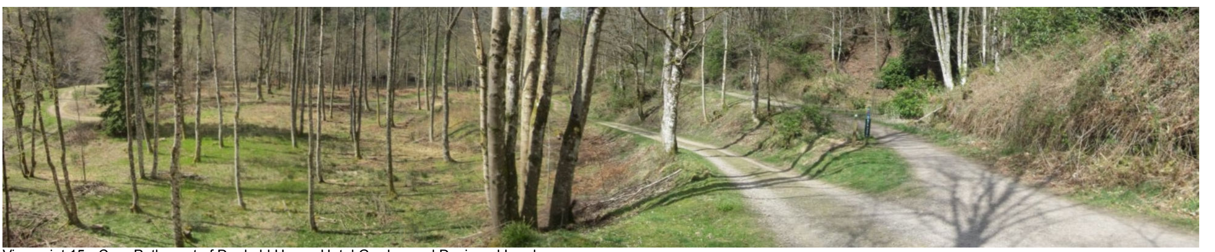
Viewpoint 15 - Core Path west of Dunkeld House Hotel Garden and Designed Landscape