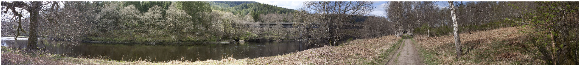
Viewpoint 16 - Core Path and NCR 77, south of Tay Crossing