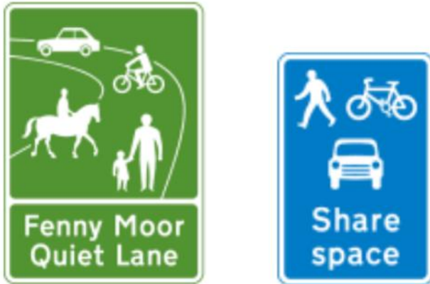
Figure 2 – Prescribed signs Diagram 884 and 886

Where a traffic sign is proposed which is not prescribed in TSRGD, this requires authorisation from Scottish Ministers through the non-prescribed sign process. There have, in the past, been various designs authorised for use for a similar purpose. This includes speed limit signs with associated non-prescribed plates, and variations to Diagram 886 to include an equestrian symbol and therefore provide a more “rural” impression.