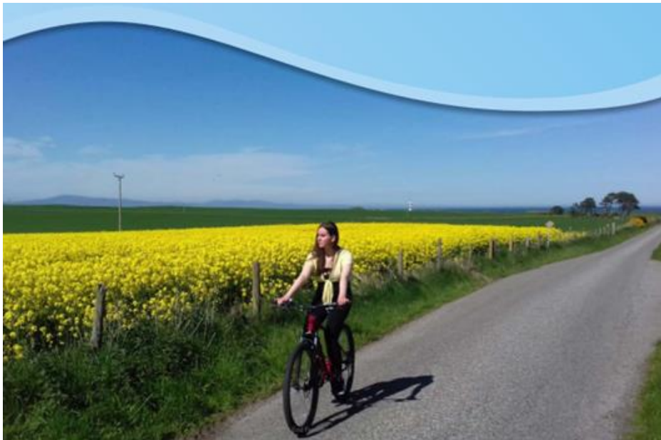
Figure 1 - Example of rural quiet route.

These routes are typically quiet (in terms of motor traffic), rural in nature, and narrow, therefore not encouraging high vehicle speeds. An example is illustrated in Figure 1.