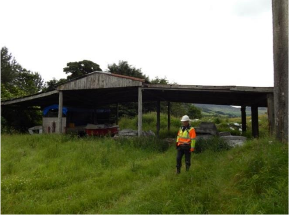
Photograph 6: General view on farmhouse from west