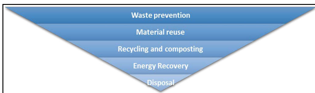
Figure 18-1: The waste hierarchy as applied to materials and waste

particular types of waste, where justified, in order to ensure this outcome and by reference to the overall impact of the generation and management of such types of waste ( Mitigation Item SMC – M3 ).