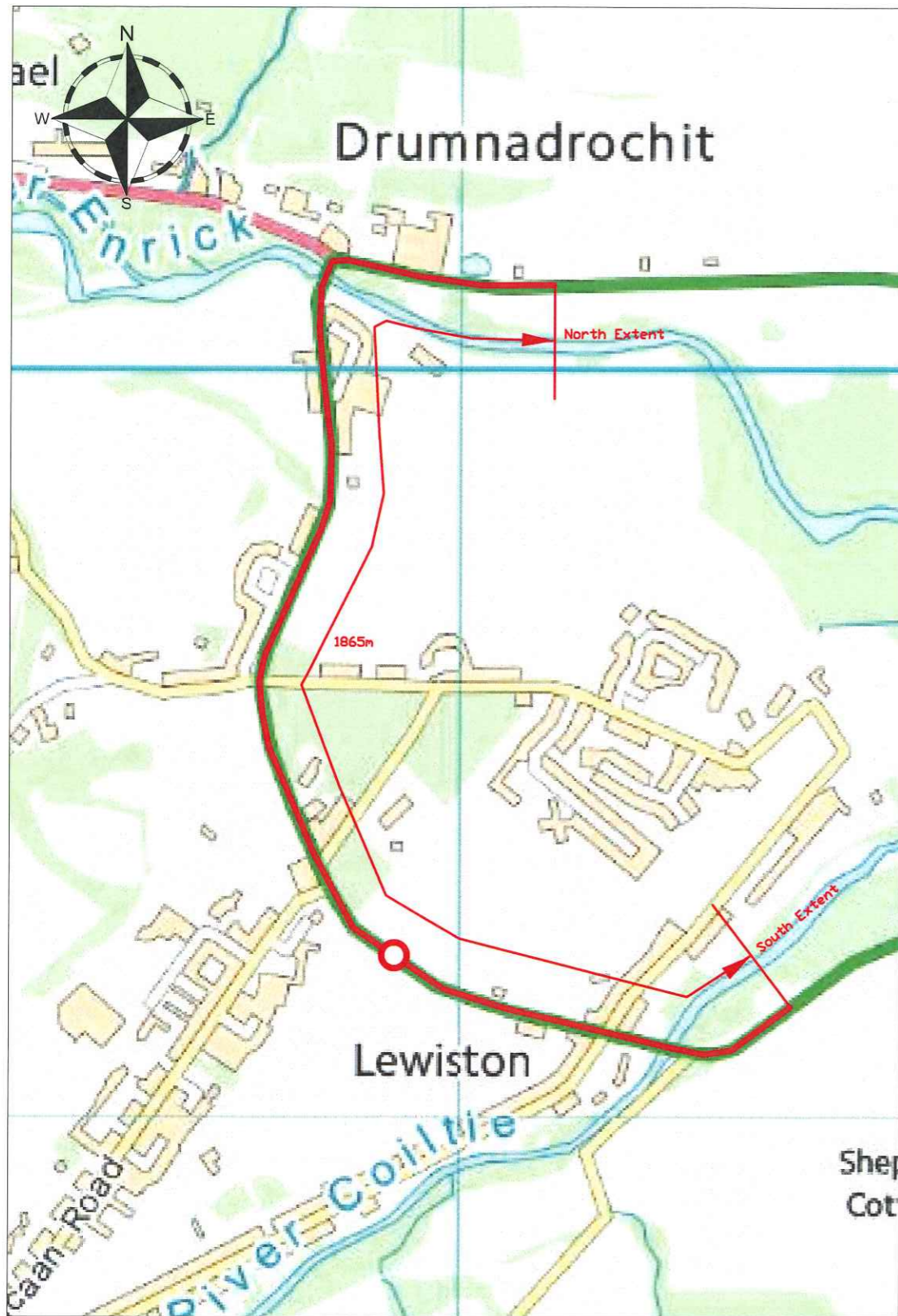
LOCATION PLAN Scale NTS