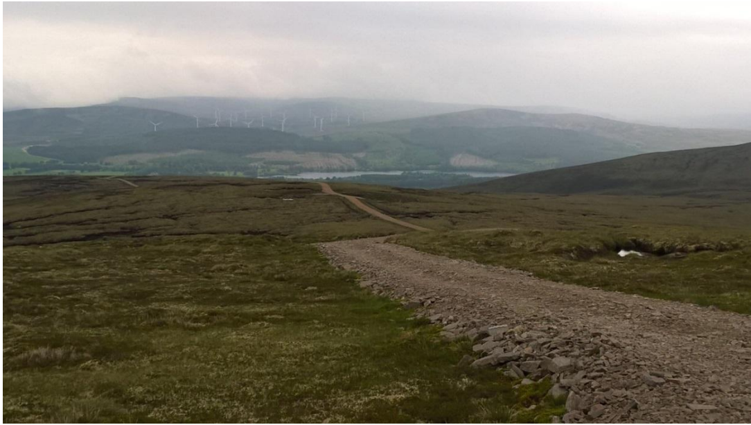
Plate 24: View from Other NMU Route P11 over the A9 at Dalmagarry