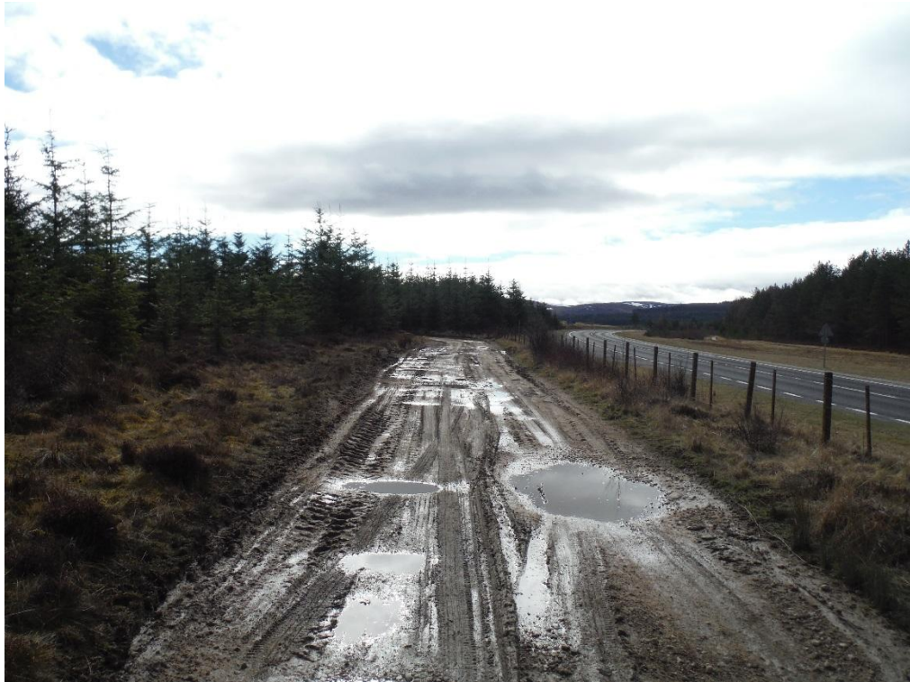
Plate 16: Other NMU Route P5 at Dalmagarry Quarry / Invereen