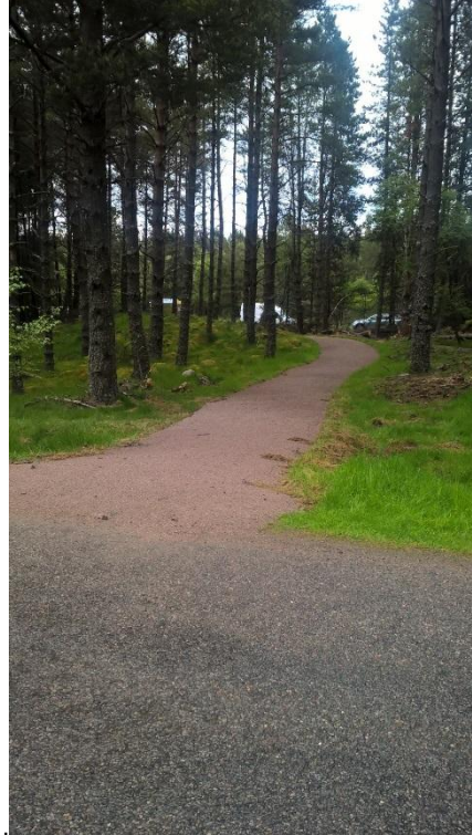
Plate 9B: Section 2 of the Planned Path Network no footpath in place