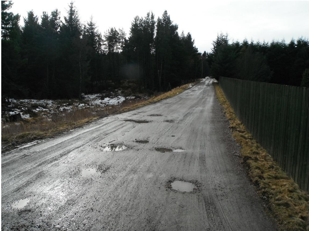
Plate 11C: Section 6 of the Planned Path Network; uses existing pavement