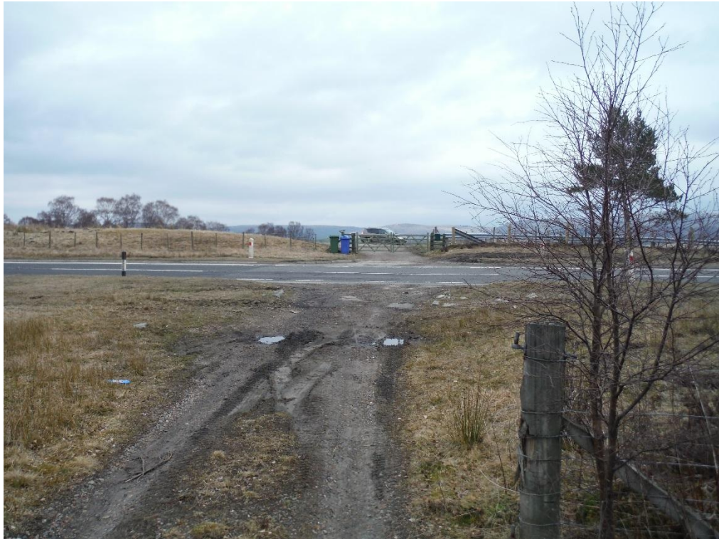
Plate 14: Other NMU Route P3 at Invereen