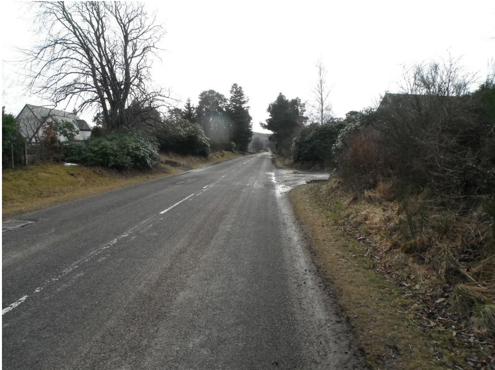
Plate 12: Railway Bridge at Invereen on Other NMU Route P2