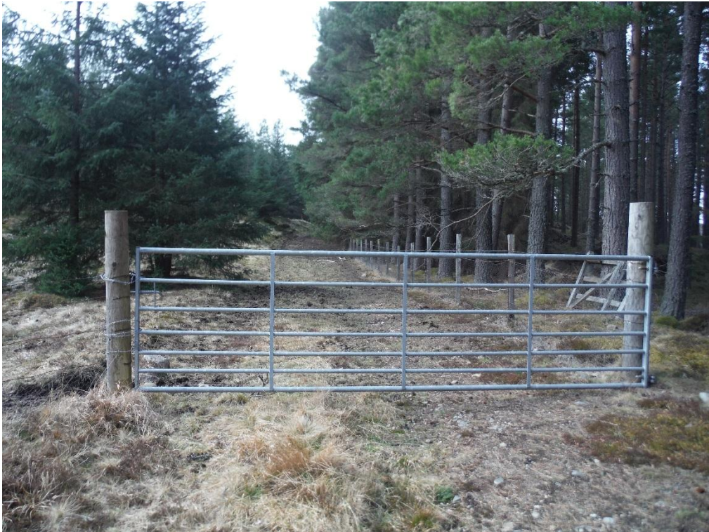
Plate 18: Other NMU Route P7 along Ruthven Road