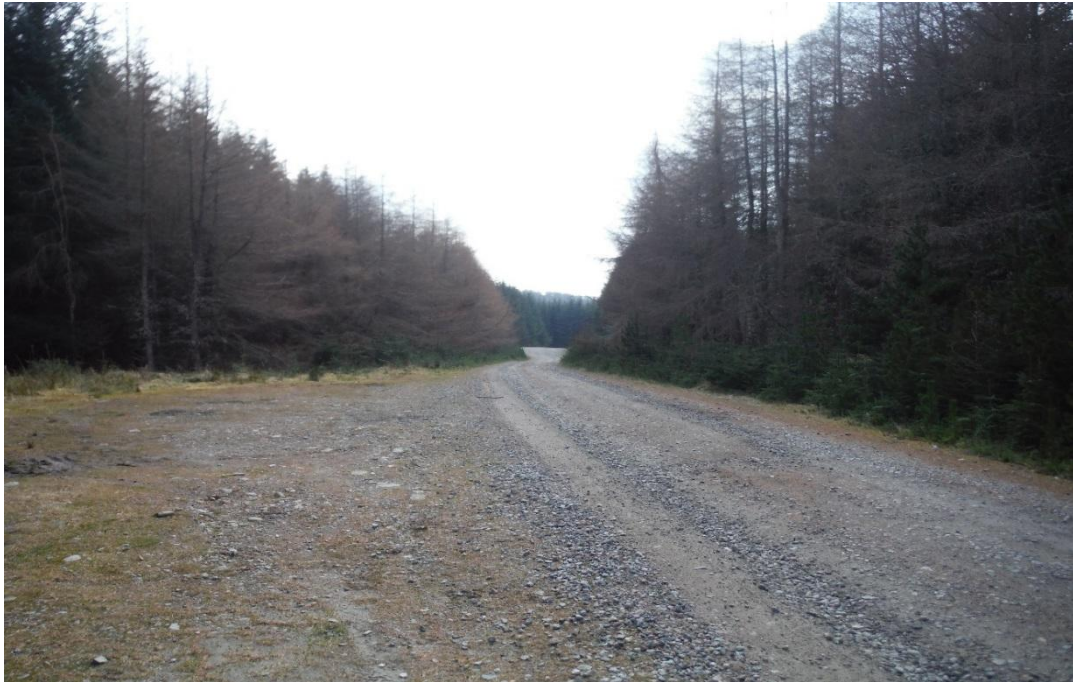
Plate 22: View from Carn Na H-Easgainn to the east from Other NMU Route P11