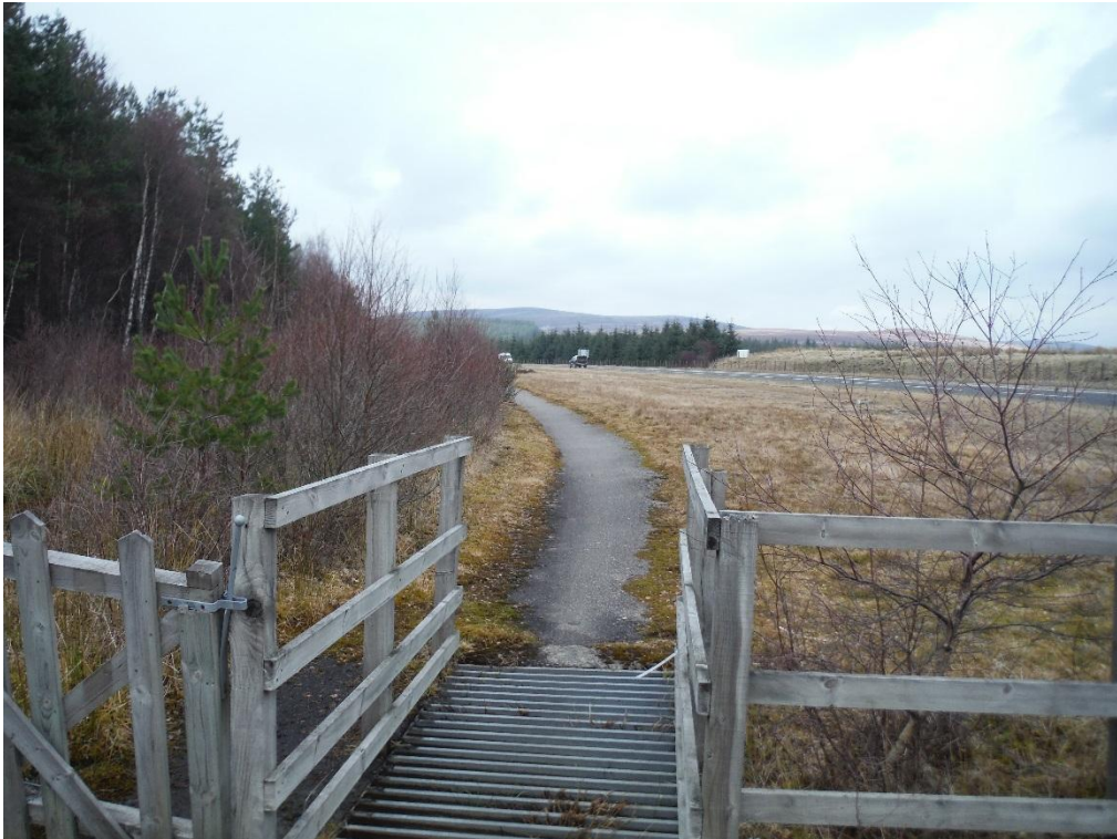
Plate 4: NCN7 at the Dalmagarry lay-by