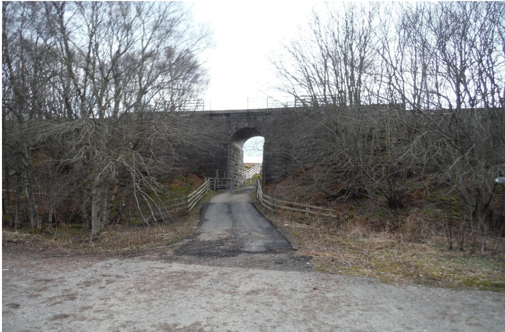
Plate 20: Other NMU Route P8 which routes from Dalmagarry to Carn na h-Easgainn