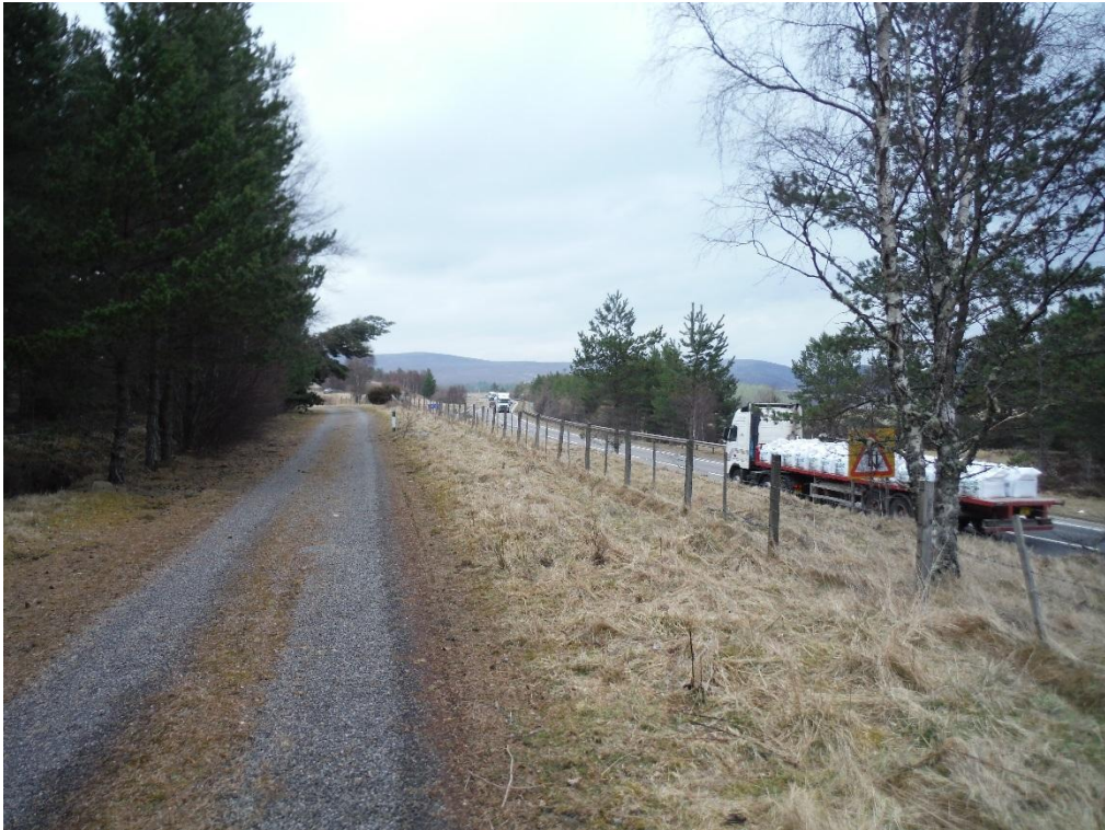
Plate 2: NCN7 to Invereen routing to the verge of the A9