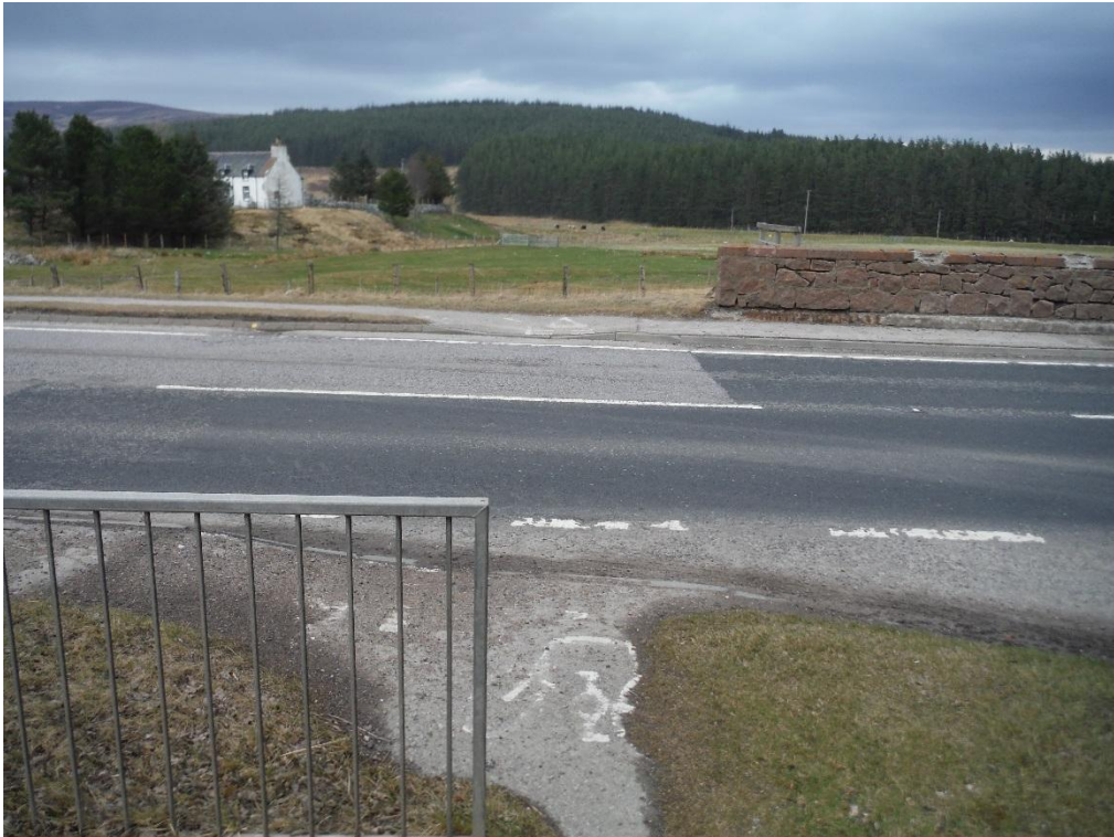
Plate 6: RoW HI43 at Lynebeg