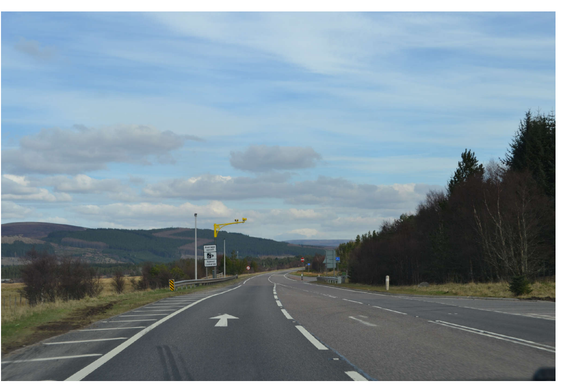
SB-02 Open views towards Moy Estate and distant hills (Beinn Na h-Iolaire)