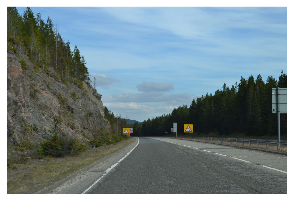
SB-01 Views enclosed by landform and forestry on lower slopes of Meal Mor