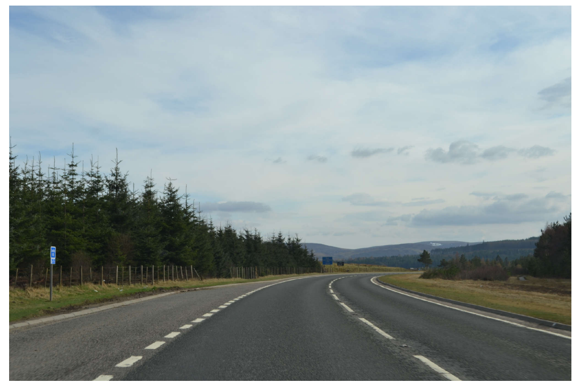
SB-07 Approaching entrance to Invereen Farm