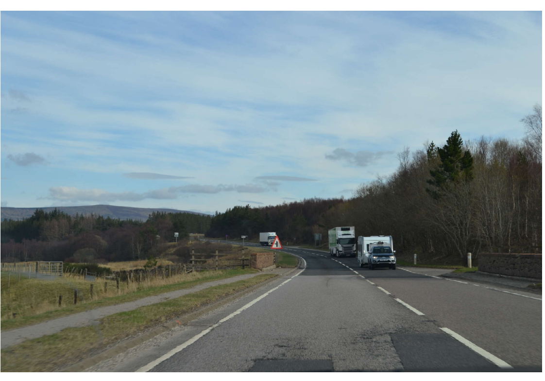
SB-06 Passing Dalmagarry Farm approaching the junction with Ruthven Road