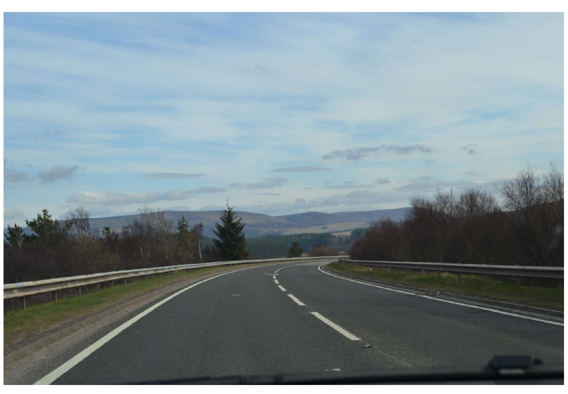
SB-04 Elevated view across Strathdearn towards distant hills