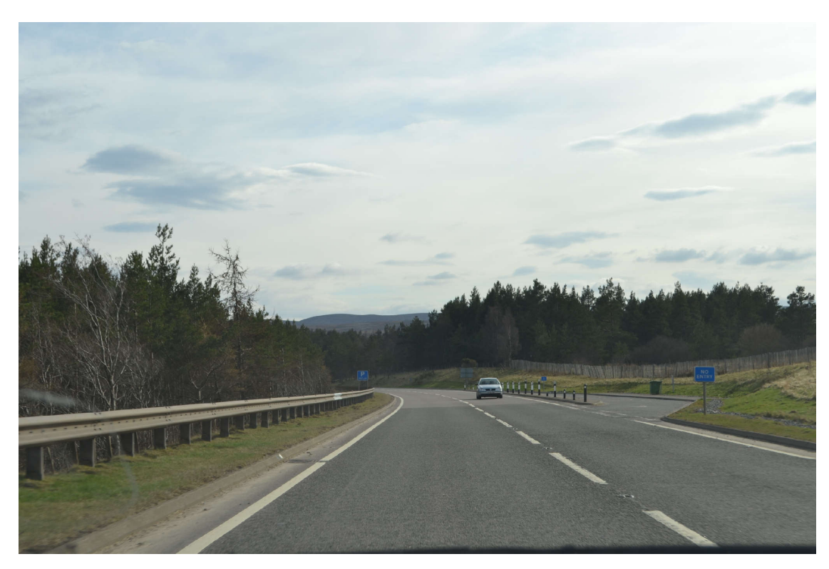
SB-08 Approaching northern end of Tomatin