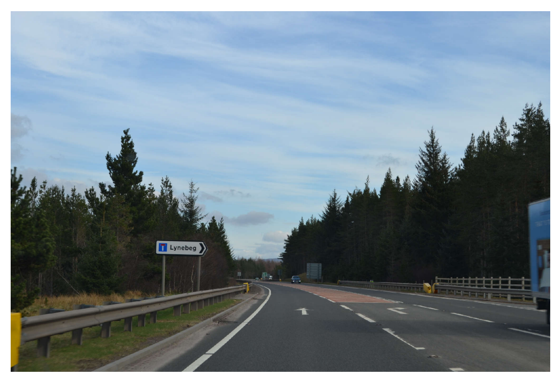
SB-03 Enclosed views passing to the west of Moy