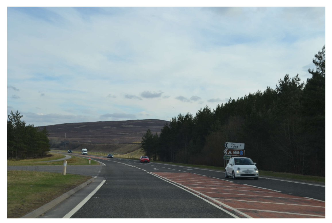
SB-05 Passing existing Moy junction with Tom Na Hulaidh forming noticeable feature