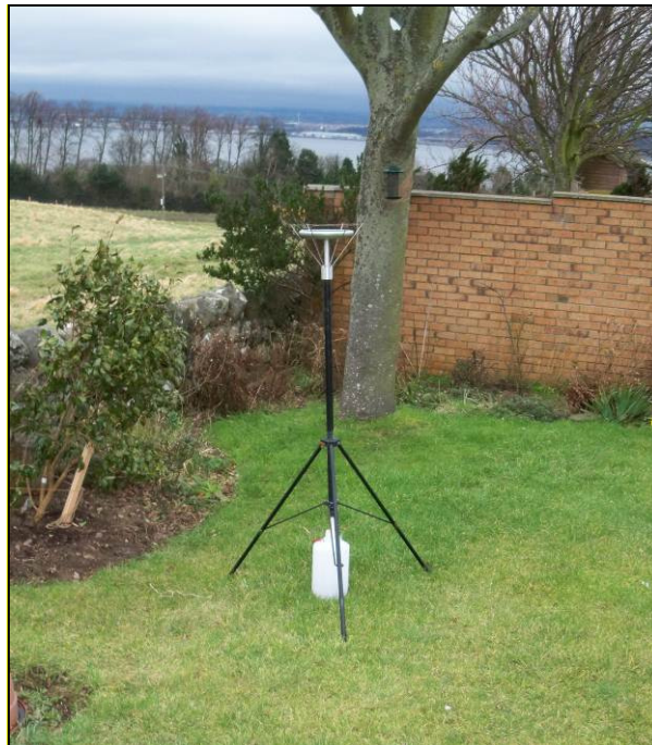
Figure 1: Example of an Installed Frisbee Gauge Meter