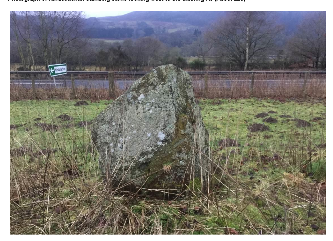
Photograph 5: Kindallachan standing stone looking west to the existing A9 (Asset 225)