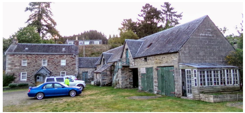
Photograph 11: Guay Farmhouse (Asset 216) viewed from the southbound carriageway of the A9

Guay Farmhouse (Asset 216, Figure 15.1c; Photograph 11), a Category B Listed Building, is dated to the first half of the 19th century. The building is located in a rural setting, immediately to the east of the existing A9 and the Highland Main Line Railway, and at the western edge of the small settlement of Guay. The building has had a road-side location since it was built, although the scale of the road has changed markedly over time. The building's cultural significance and special and architectural interest is derived from its remaining original built fabric, external appearance and the development of its historic context and the relationship it retains with its setting.