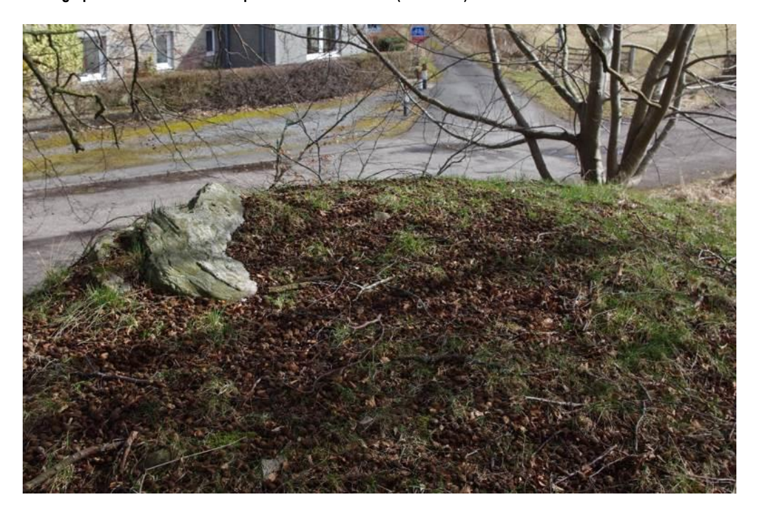
Photograph 4: View of Kindallachan cairn looking north-west (Asset 221)