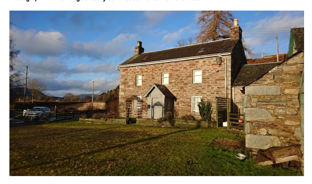
Photograph 14: The Range of Guay Farmhouse viewed from the west

7.1.17 The Range, conversely, is constructed from more uniformly-sized and shaped reddish sandstone blocks that are coursed more regularly than the Wing. The symmetrical façade of the Range with its sashwindows can be interpreted as a vernacular take on the polite Georgian architecture in fashion in the early part of the 19th century (see Photograph 14).