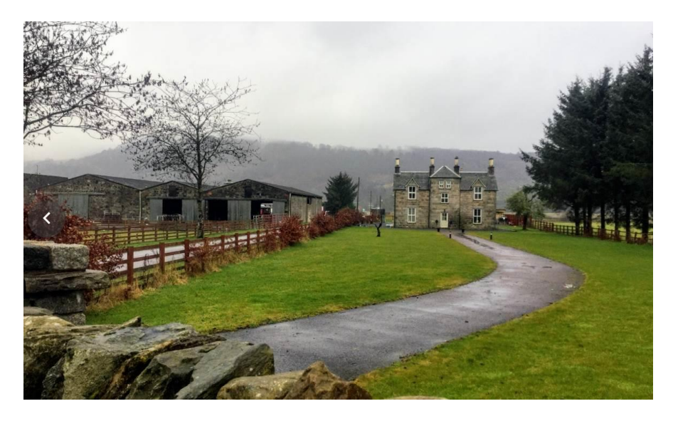
Photograph 16: Westhaugh of Tulliemet Steading horse gin