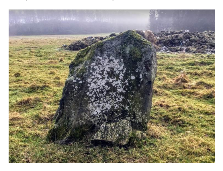
Photograph 1: Dunkeld House standing stone (Asset 633)

Clachan More Standing Stones (Asset 207, Figure 15.1c)