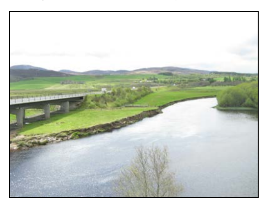
A) River Spey looking upstream from north embankment by Kingussie. The existing Spey crossing is seen to the left of photograph.