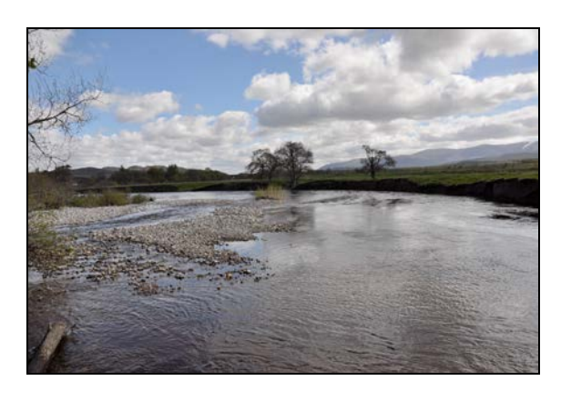
B) River Spey looking downstream. Confluence with the Gynack Burn to the left of photograph