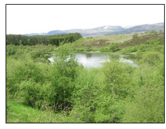
Photographs 11-11: Glebe Ponds (P9.18)