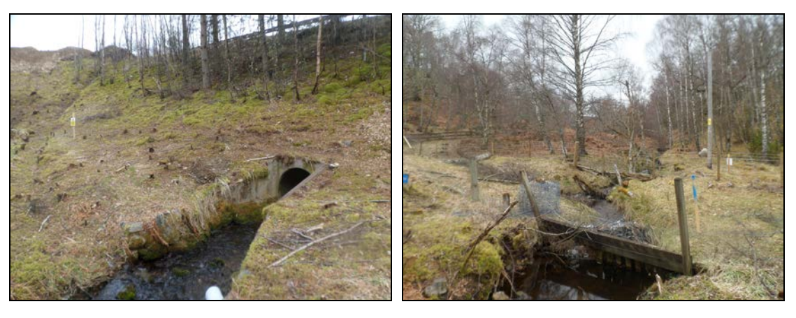
A) Upstream of A9 crossing (looking south)

B) Upstream of A9 crossing (looking north)