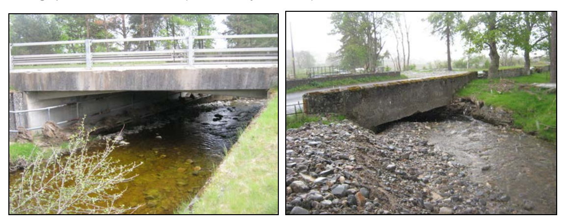
A) Upstream of A9 crossing (looking south)

Photographs 11-8: Raitts Burn (MW 9.14/ Hydro ID 162)