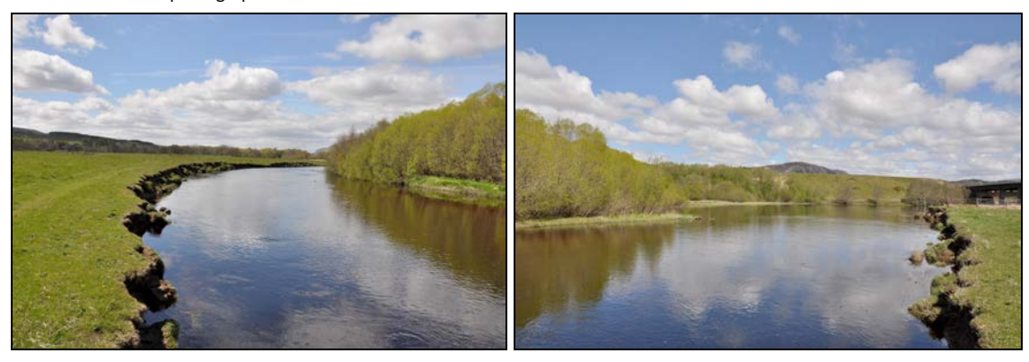
C) River Spey looking upstream from south embankment opposite to Kingussie.