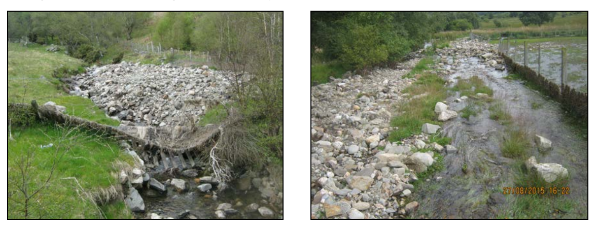
A) Large volume of deposited materials upstream of A9 crossing B) Out-of-bank flow and deposition of material downstream of A9

Photographs 11-7: Allt Cealgach (MW 9.12/ Hydro ID 157)