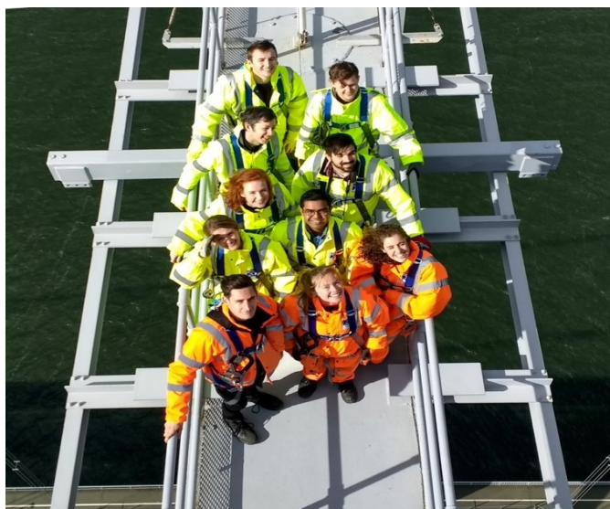
Graduate & Summer Placement Network Site Visit, Queensferry Crossing 2017

The Graduate Development Programme includes continuous assessment, requiring annual reports that must be completed on time and to an acceptable standard. As a participant you must demonstrate you have the potential to complete the Programme to the required level to enable you to undertake your Professional Review and obtain Transport Planning Professional or Chartered status. In the event that you fail to meet the required standard of performance you would be released from the Graduate Development Programme and would be moved to an available B2 generalist post. Your progression as Transport Planner or Civil Engineer within Transport Scotland and your potential progression to professional review would cease.