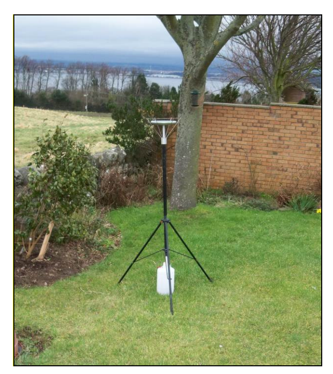
Figure 1: Example of an Installed Frisbee Gauge Meter