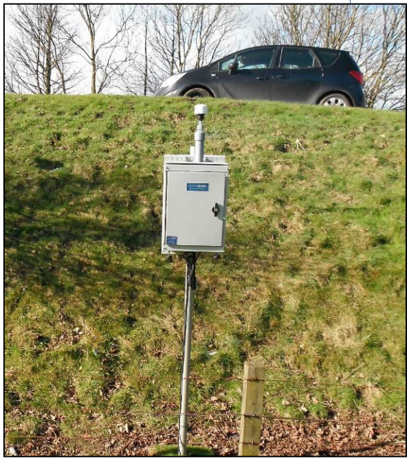
Figure 2: Example of an installed Automatic Light Scatter Dust Meter