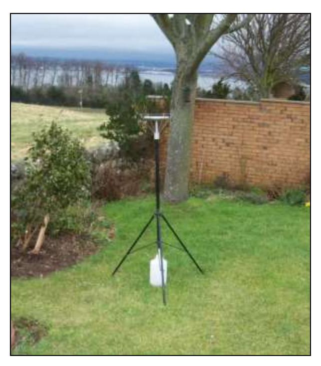
Figure 1: Example of an Installed Frisbee Gauge Meter