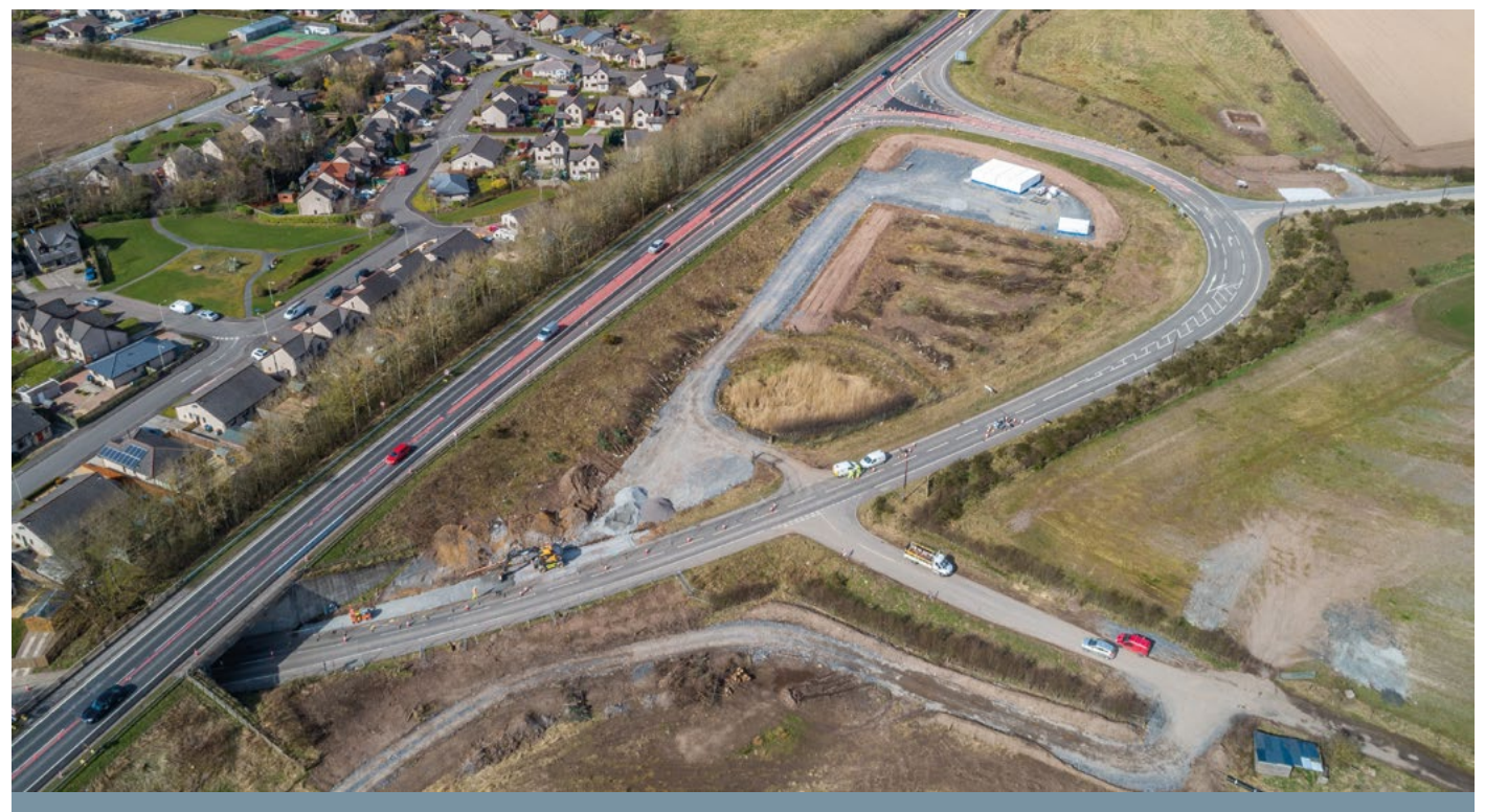
Construction underway to extend at Hunters Lodge Underbridge