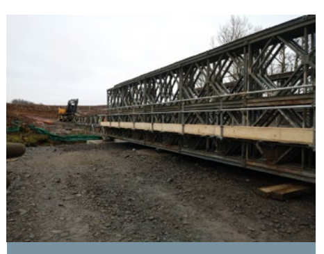
Bailey bridge with 'launching nose' attached at the Shochie Burn

The two Bailey bridges will remain in place for around a year until the major earthworks are completed.