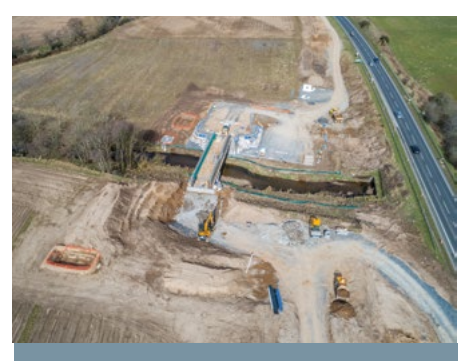
Bailey bridge in its final position at the Ordie Burn