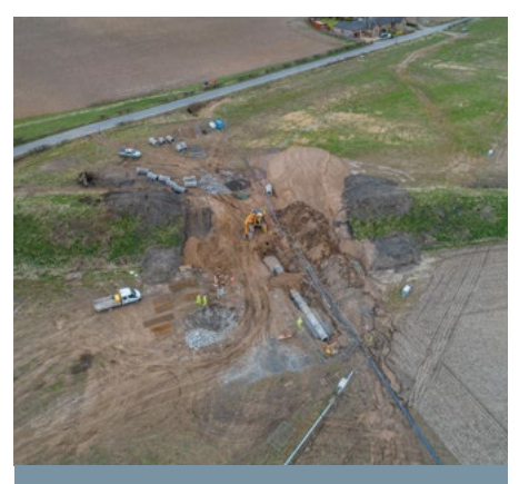
Drainage culvert installation Stanley Road

We are already starting to see significant changes and over the next quarter we will see works continue on structures and earthworks. Construction has commenced at the new Tullybelton/Stanley overbridge and the extension of Hunters Lodge underpass. In parallel, the roads team will commence stripping of topsoil and movement of bulk earthworks to create widened embankments and cuttings to accommodate the new dual carriageway, with 860,000 cubic metres of earth to be moved - enough to fill 344 Olympic swimming pools!