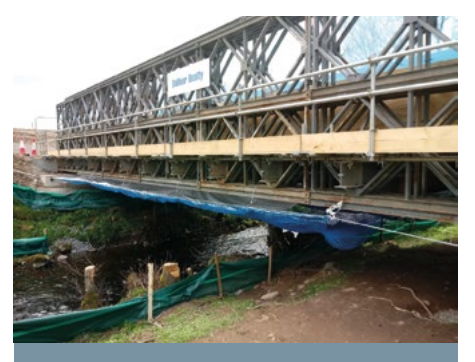
The catch net prevents debris from landing in the burn below