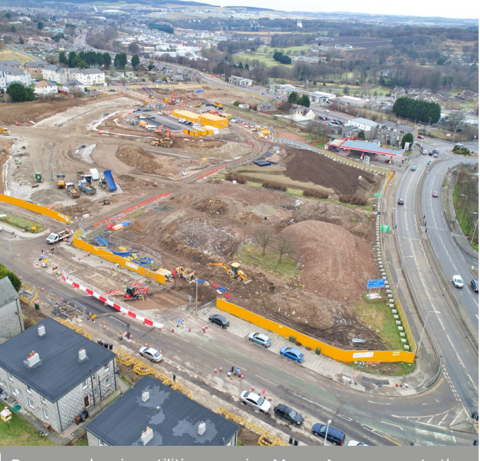
Progress showing utilities crossing Manor Avenue near to the junction with North Anderson Drive

The next stage will be to carry out a deep excavation to connect the detention basin to the adjacent Scatterburn, which is an underground watercourse that flows to the River Don.