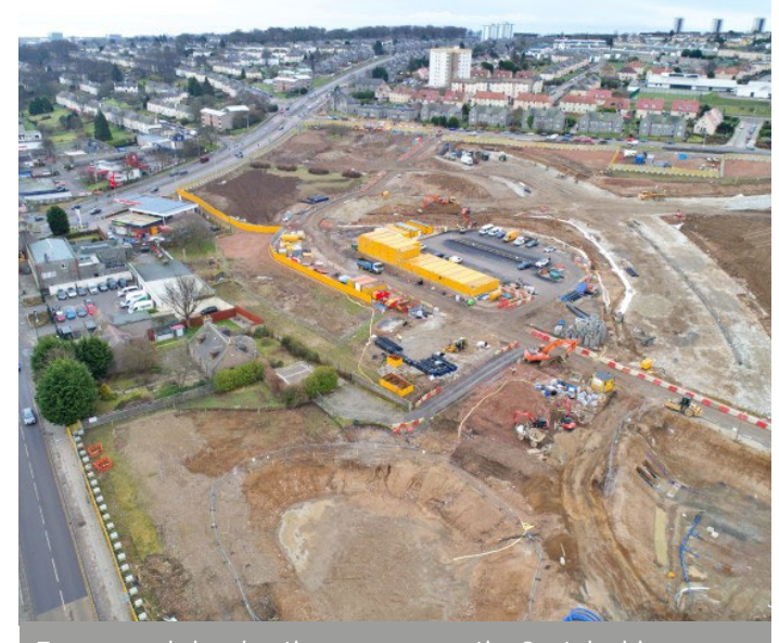
Foreground showing the progress on the Sustainable Urban Drainage System detention basin with the utility trench works on the right-hand side, also shows the new road alignment taking shape behind the Farrans site accommodation