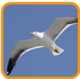
S _ _ _ _ _