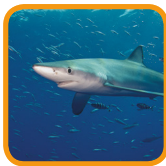
Sh _ _ _