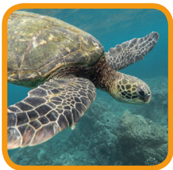
T _ _ _ _ _