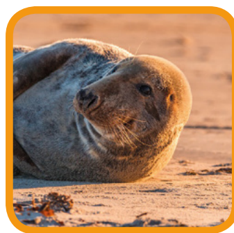
Grey S _ _ _