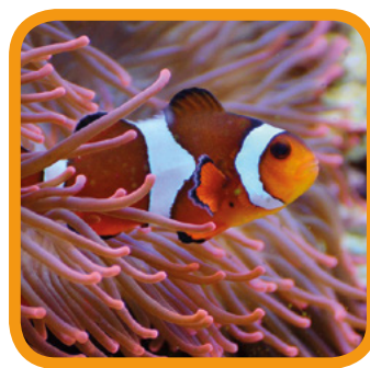
Cl _ _ _ F _ _ _