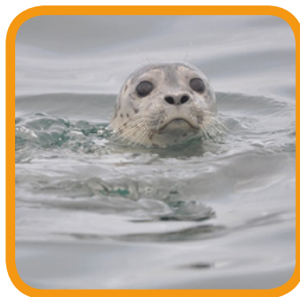
Harbour S _ _ _