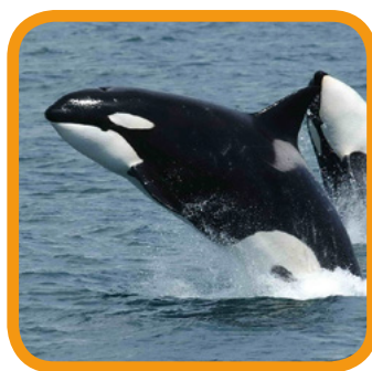
Or _ _ Wh _ _ _