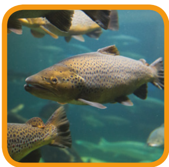
Salm _ _