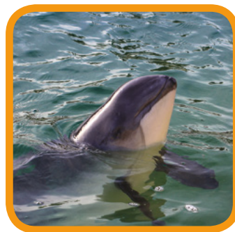
Porp _ _ _ _