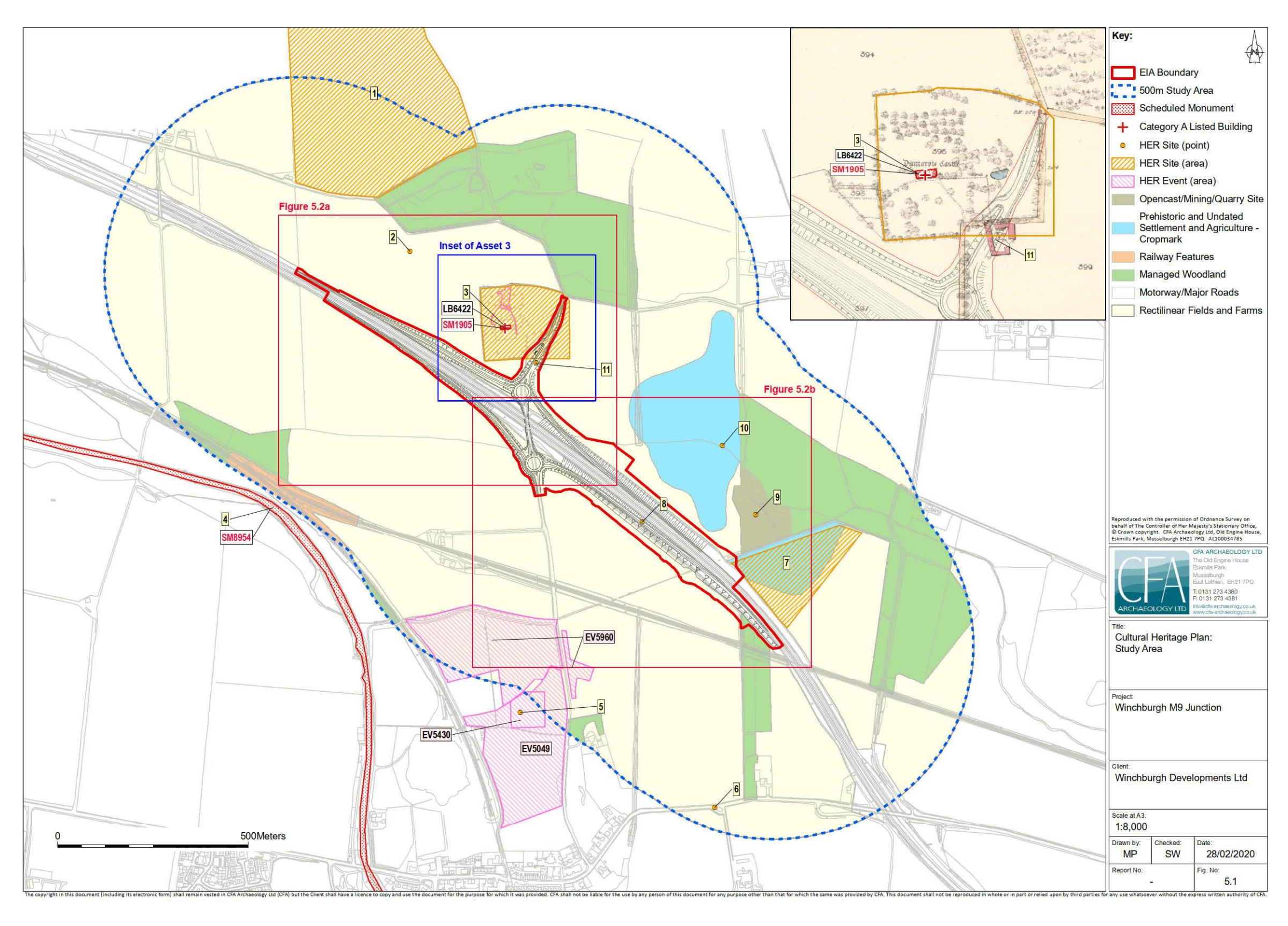
Figure 5.1: Cultural Heritage Plan: Study Area