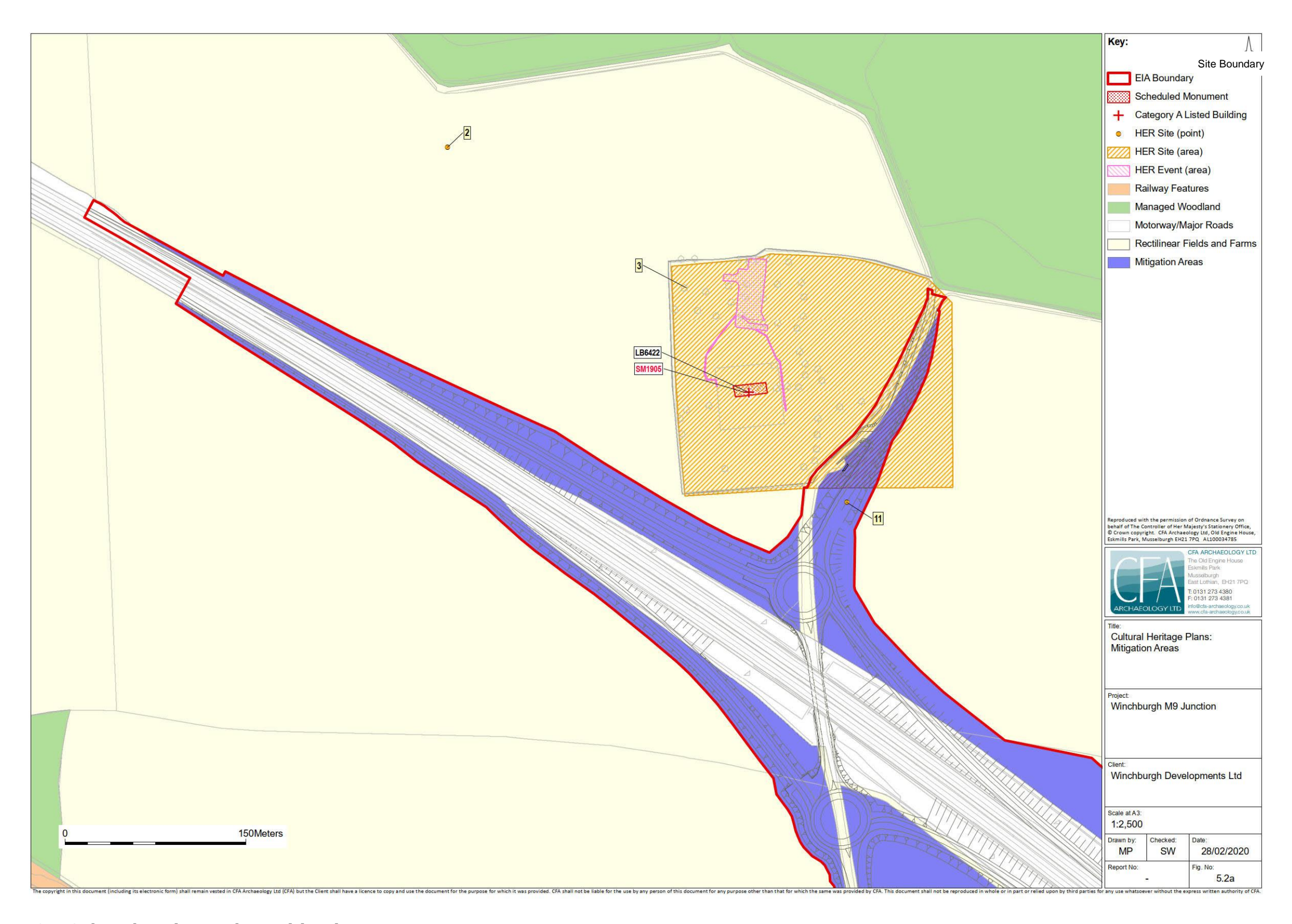
Figure 5.2a: Cultural Heritage Plan: Mitigation Areas