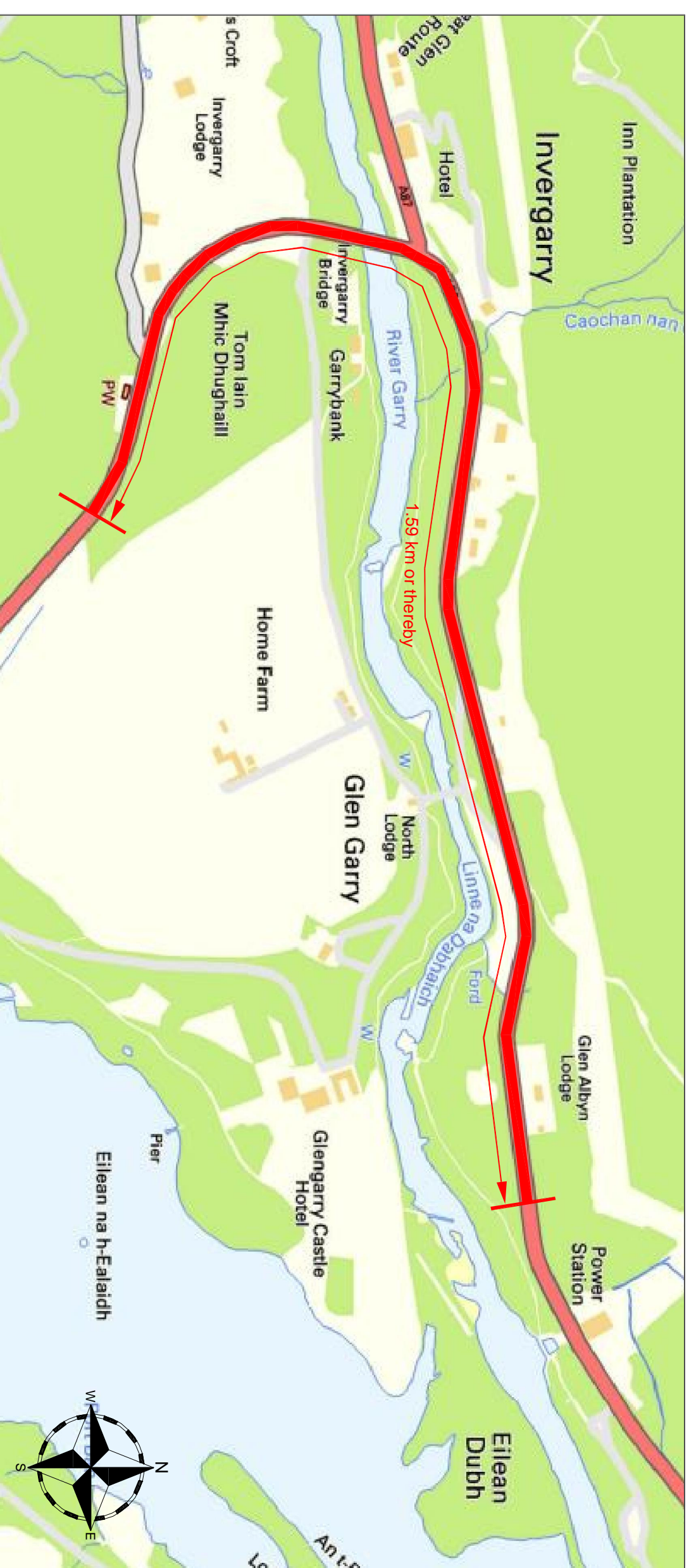
LOCATION PLAN - Scale NTS