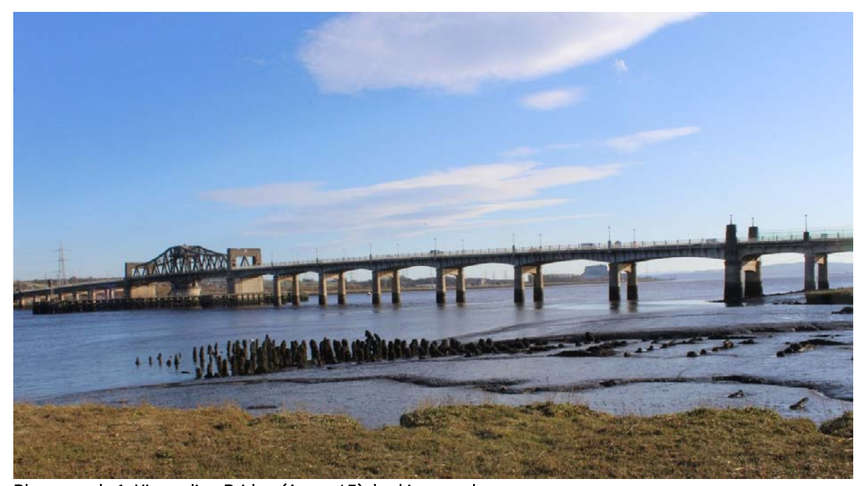
Photograph 6: Kincardine Bridge (Asset 15), looking south-east