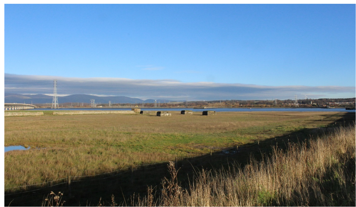
Photograph 13: Firth of Forth Intertidal Mudflats (HLT 4), looking north-east