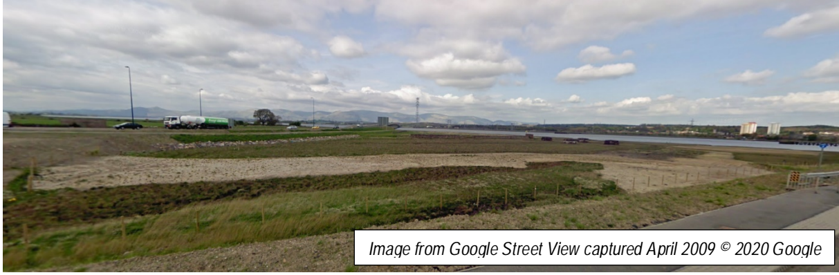
Photograph 5: Modern disturbance to the north of the southern approach to Kincardine Bridge (including former pylon base in background)