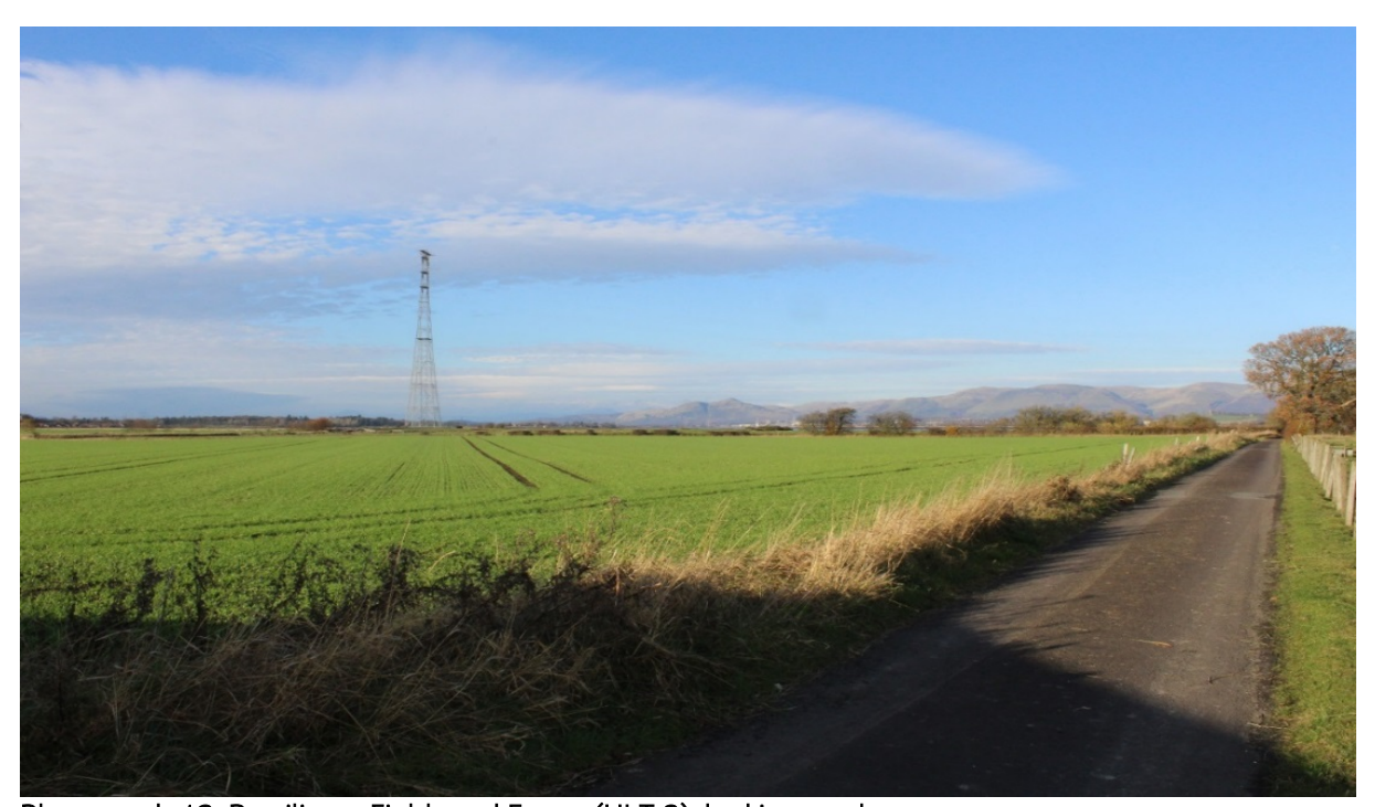
Photograph 12: Rectilinear Fields and Farms (HLT 3), looking north-west

5.56 The Firth of Forth Intertidal Mudflats (HLT 4; Photograph 13) comprises an area to the north of the study area, running south to north. This HLT is characterised by the mud flats above the Mean Low Water Spring (MLWS) of the Firth of Forth. In the study area, HLT 4 is characterised by the low-lying topography of the mudflats and saltings of the coastal salt marsh extending from the Clackmannanshire Bridge to the north, to south of Kincardine Bridge and includes meandering tidal burns and rough marginal grassland. This intertidal area is depicted on historic mapping, including the Roy Military Survey of Scotland (1750s) and First Edition Ordnance Survey mapping (1860s), as an area of rough or heathy pasture and mud.