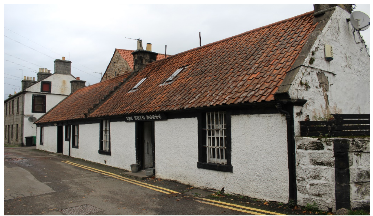
Photograph 9: Ye Old House Inn, 25-26 Forth Street (Asset 25), looking north

Our understanding, appreciation and experience of both the domestic and public buildings described above is enhanced by their settings and in consideration of this, and their designations as Category B Listed Buildings, these nine cultural heritage assets have been assessed to be of medium value.