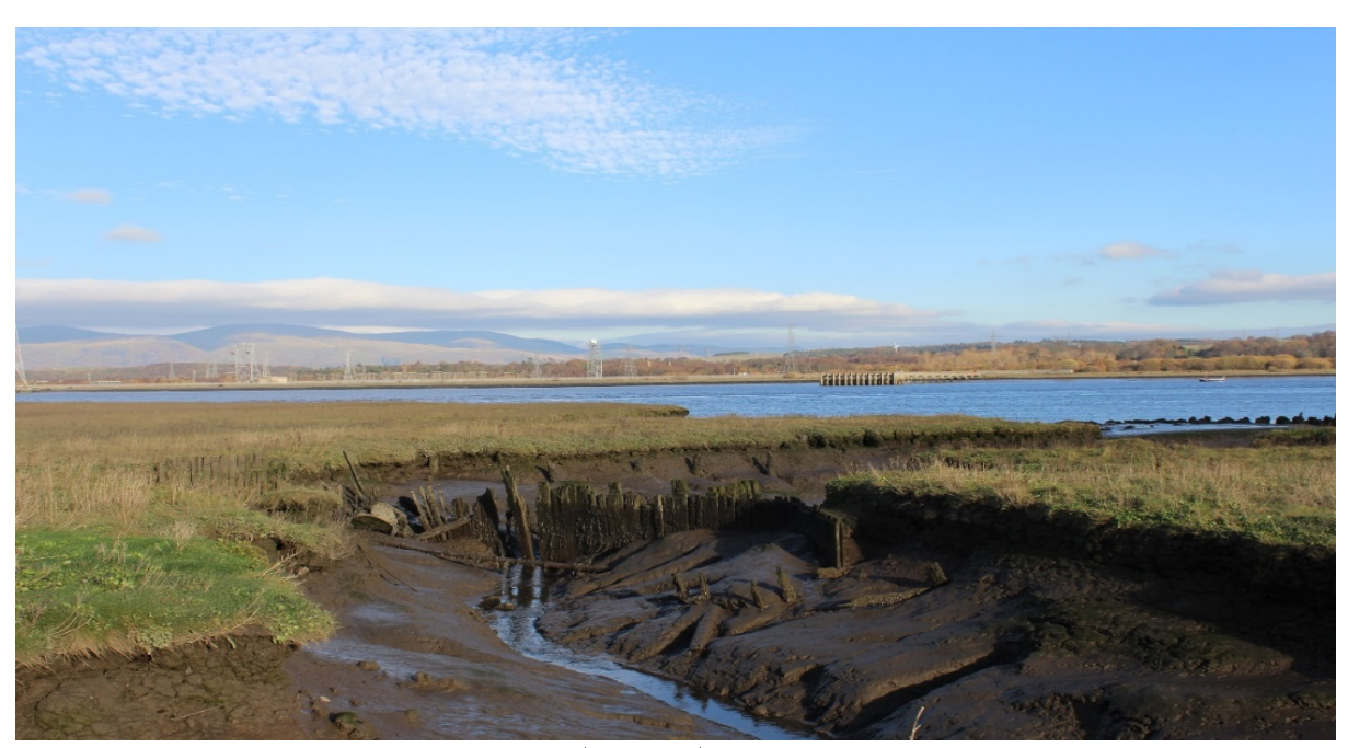
Photograph 1: Higgins' Neuck Landing Point (Asset 11) and remains of the timber-built sluice, looking north-east

The Higgins' Neuck Ferry Pier (Asset 14; Photograph 2) comprises the remains of the wooden piles of the ferry pier, adjacent to the landing point (Asset 11). A ferry pier at this location is depicted on historic mapping including a plan of the Firth of Forth opposite the Tulliallan Estate (1828) as a 'New Pier' and First Edition Ordnance Survey mapping (1860s). The pier continued to be depicted on mapping until the 1960s and aerial photographs dating from the 1940s and 1970s show the pier as a series of parallel rows of timbers. The remains the wooden piles belonging to the ferry pier are still visible at low tide.