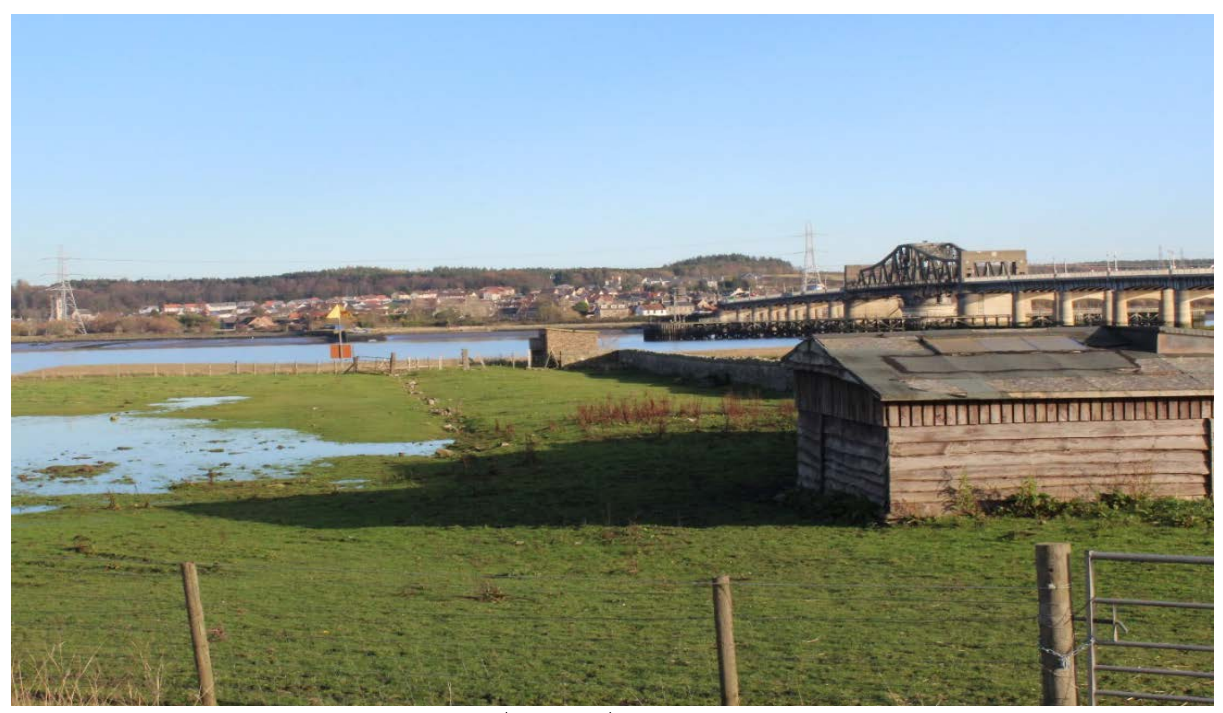
Photograph 3: Higgins' Neuck Drove Road (Asset 13), looking north-east

The Higgins' Neuck Drove Road (Asset 13; Photograph 3) comprises the remains of a walled road running from the Keith Arms Inn (Site of) (Asset 3) to the ferry crossing and evidences the use of the crossing by drovers during the 18th and 19th centuries to bring their animals to market south to Falkirk Tryst. The road is depicted terminating at Higgins' Neuck on a number of historic maps of this date, including the Roy Military Survey of Scotland (1747-1755), a plan of the roads from Airth (c.1772) and Glossom's map of Scotland (1817-1819). Where the walled drove road ends the alignment is marked by kerbs and revetments to the edge of the mud flats, aligning with the wooden piles of the ferry pier (Asset 14). Only a short length of the wall remains extant due to its removal during the construction of the Clackmannanshire Bridge (2006 to 2008); however, a length of coursed rubble stone wall and the remains of the foundations of a parallel wall to the north remain extant.