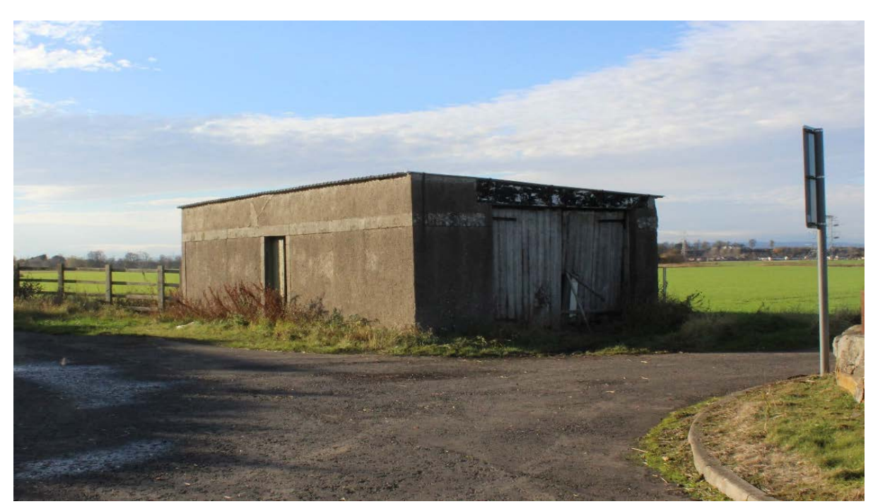
Photograph 11: Higgins' Neuck Ferry House (Asset 4), looking north-west