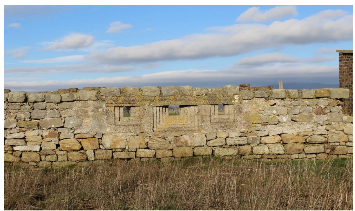
Photograph 4: Higgins' Neuck Machine Gun Post (Asset 12), looking north