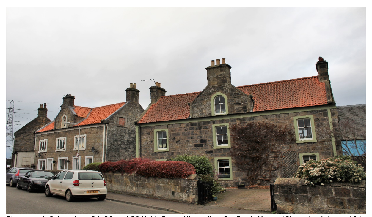
Photograph 8: Numbers 26, 28 and 30 Keith Street Kincardine-On-Forth (Asset 18) on the right; and 34 and 36 Keith Street (Asset 17) on the left, looking north-west