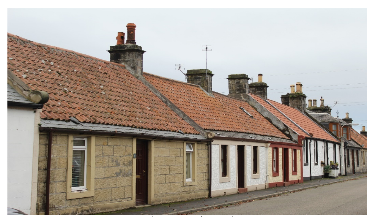
Photograph 10: Number 17 (and 19 to 23) Keith Street (Asset 19), looking south-west