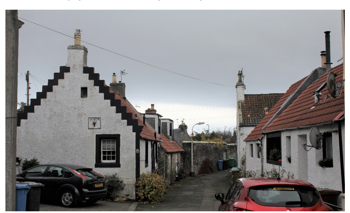
Photograph 7: View towards Kincardine Bridge looking south-west along Excise Lane at the heart of the Conservation Area (Asset 16)

5.36 In consideration of the well preserved and distinctive historical character of the Conservation Area, and the positive contribution it makes to the historic built environment of West Fife, Kincardine Conservation Area is assessed as being of medium value.