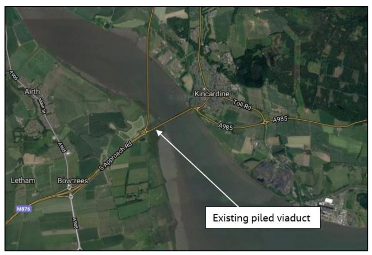
Image 1: A985 Kincardine Bridge Refurbishment: Piled Viaduct Replacement – Site Location and Context