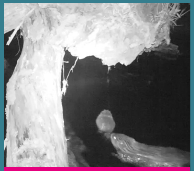
A beaver with kit spotted on our wildlife cameras

Click on these links to view the footage of the beaver or the otter!