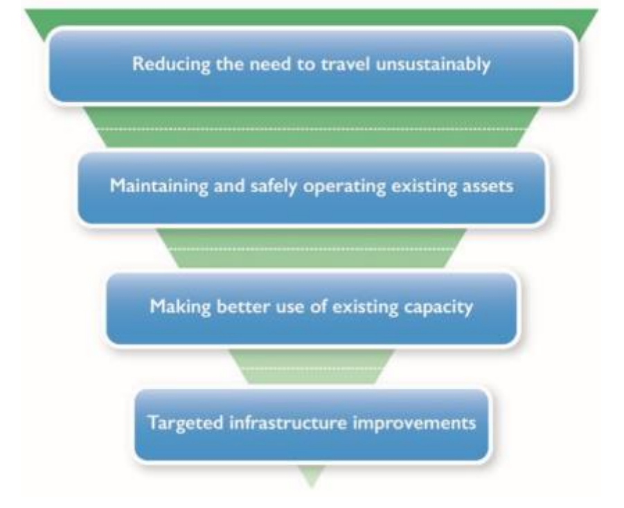
Diagram 3: National Transport Strategy: Sustainable Investment Hierarchy

• similarly, embed the Sustainable Investment Hierarchy to inform future investment decisions and ensure transport options that focus on reducing inequalities and the need to travel unsustainably are prioritised