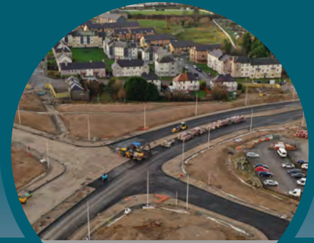
Overview of the new link road