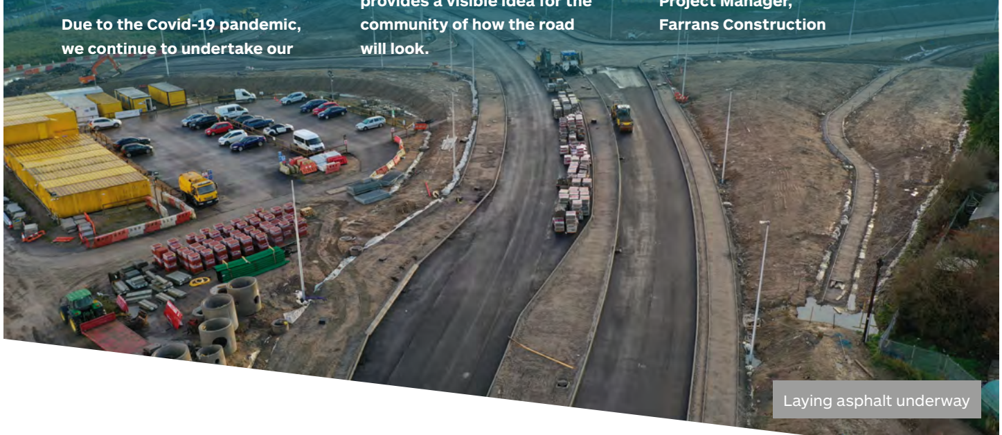
Laying asphalt underway