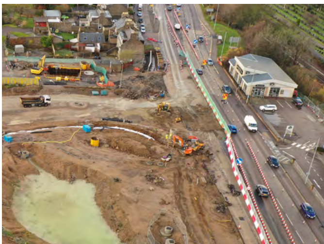
Contraflow traffic management on the A96, allowing works to progress to connect the new link road junction, retaining wall and works on drainage basin to continue

A contraflow system is in place on both trunk roads; the A92 North Anderson Drive and A96 Auchmill Road to allow work on the new link road junction, the retaining wall and the drainage basin to progress in the vicinity of the existing road. Having the contraflow in place will also improve safety for the site operatives and road users. We appreciate that this may cause some inconvenience at times and would like to apologise for this and reassure the community that the work has been planned to minimise disruption as much as possible.