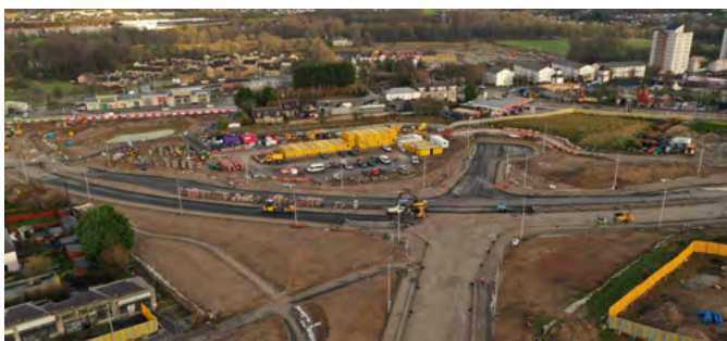
Laying asphalt underway on the link road and the new bus turning area which can be seen in the background

Work to divert the equipment for a number of utilities including water, gas and electricity is now 90% complete.