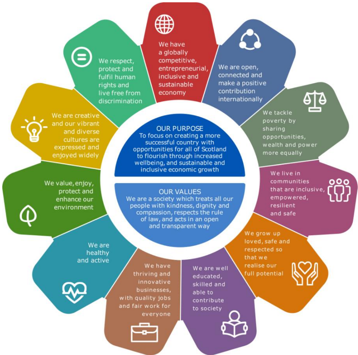
Figure 1-3 Scotland's National Performance Framework