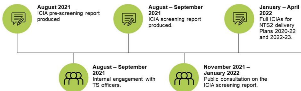
Figure 1-1 Timeline for ICIA activities

This screening report has been produced, alongside a consultation report, prior to a period of consultation on the ICIA and the other impact assessments between November 2021 and January 2022. The feedback and findings of the consultation will contribute towards completing a full ICIA on both the 2020-2022 NTS2 Delivery Plan and 2022-2023 NTS2 Delivery Plan in April 2022. Figure 1-1 sets out the key activities and timescales for undertaking the ICIA.