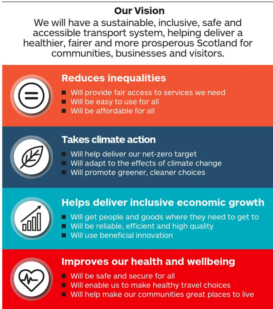
Figure 1-2 NTS2 Delivery Plan Vision and Priorities 2020-22

The first NTS2 Delivery Plan sets out 199 broad actions the Scottish Government (SG) is taking to deliver on its vision and priorities to the end of March 2022, taking account of the impact of COVID-19. The second Delivery Plan (for 2022-23) will be published in Spring 2022 and will outline SG’s actions for delivering the four priorities to the end of March 2023. Delivery Plans will be published on an annual basis from 2022 onwards.