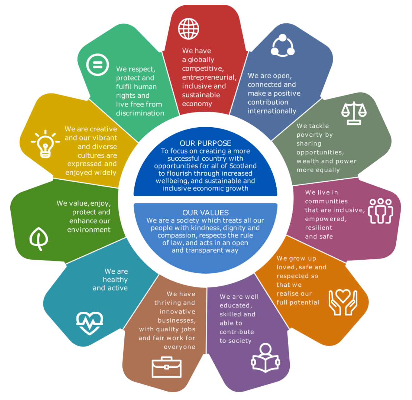
Figure 1-3 Scotland's National Performance Framework

The actions within the NTS2 Delivery Plans will also contribute to achieving the Scottish Government's National Outcomes contained within the <u>National</u> <u>Performance Framework</u> as shown in Figure 1-3.