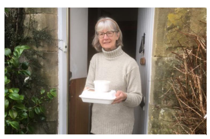
Volunteers delivered festive themed boxes

The Stanley Development Trust (SDT) annual Christmas Lunch Club meal in December 2020 was conducted in a different format to the traditional sit-down meal format. Balfour Beatty worked with the Care and Wellbeing project coordinator at SDT to support the delivery of Christmas Afternoon Tea boxes for the lunch clubbers. Each box contained a hearty soup, festive themed filled rolls and a selection of cakes and sweet treats.