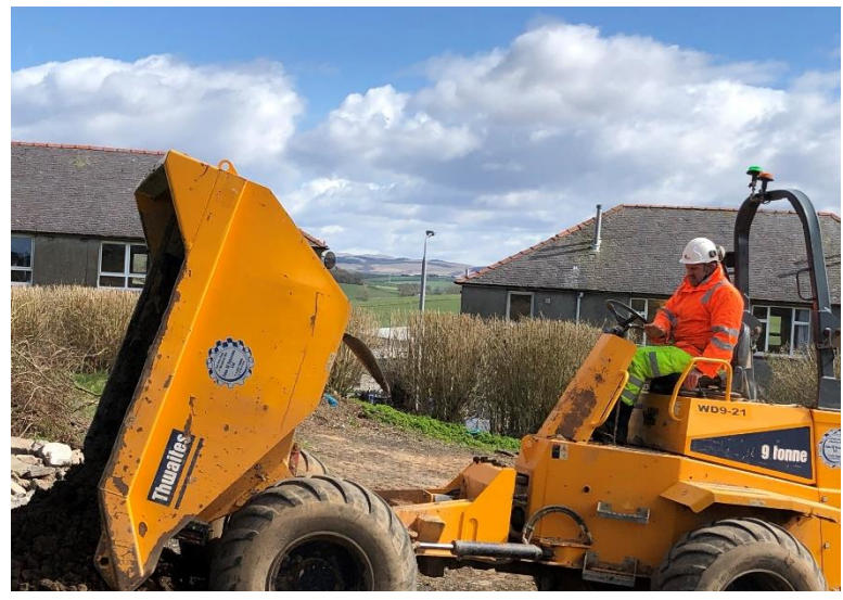
Topsoil was provided to assist the Carrick Community Food Garden in growing their own produce

Maybole. This initiative has been established to support and benefit foodbank users and others affected by social, economic and health issues. offering them the opportunity to create and maintain the community garden. Produce from the garden will be made available for use by the foodbank and the community. The contractor was pleased to assist with a donation of topsoil and provided site staff to assist with the levelling of the donated material.