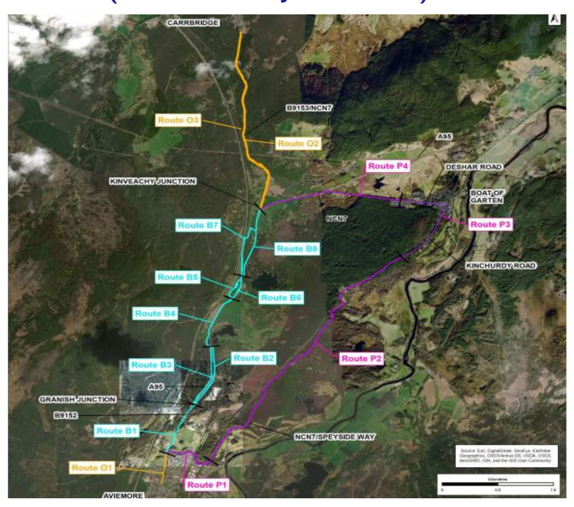
Plan of route options on the scheme