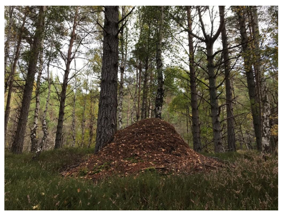
Wood ant nest within woodland surveyed as part of proposed Aviemore to Carrbridge Non-Motorised User scheme

Lot 3 - 10 A9 Dualling Environmental Steering Group Meetings were held virtually to engage with Historic Environment Scotland, NatureScot, Cairngorms National Park Authority, The Highland Council, Perth & Kinross Council, Perth & Kinross Heritage Trust, Scottish Environmental Protection Agency.