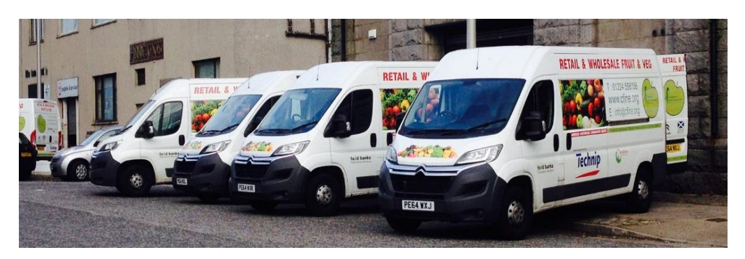
The CFINE fleet - ready for deliveries