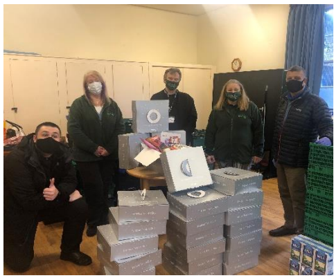
Virtual Halloween party