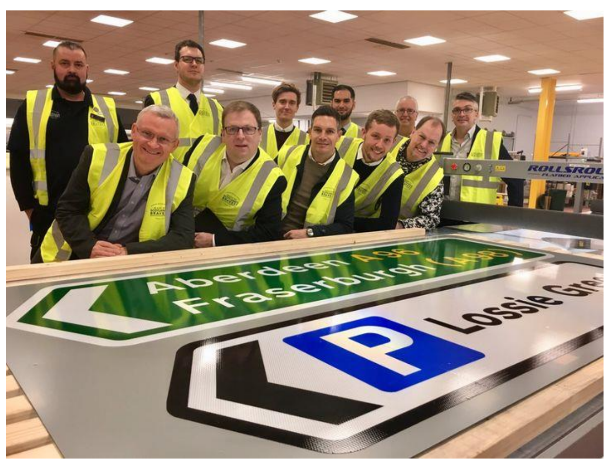
BEAR Scotland and Scotland's Bravest Manufacturing Company - an award winning partnership