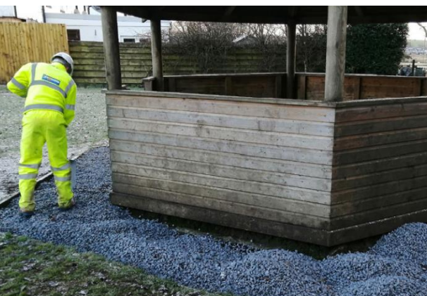
Hard at work moving 10 tonnes of gravel by hand