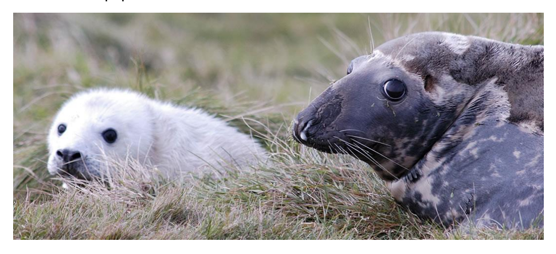
Grey Seals in Orkney

The winter is grey seal breeding season in Orkney and Shetland when seals come ashore to give birth to fluffy white seal pups. The operator supports the Sanday Seal Cam, so that the cycle of birth, feeding, weaning, and the first swims of the pups can be observed without disturbance.