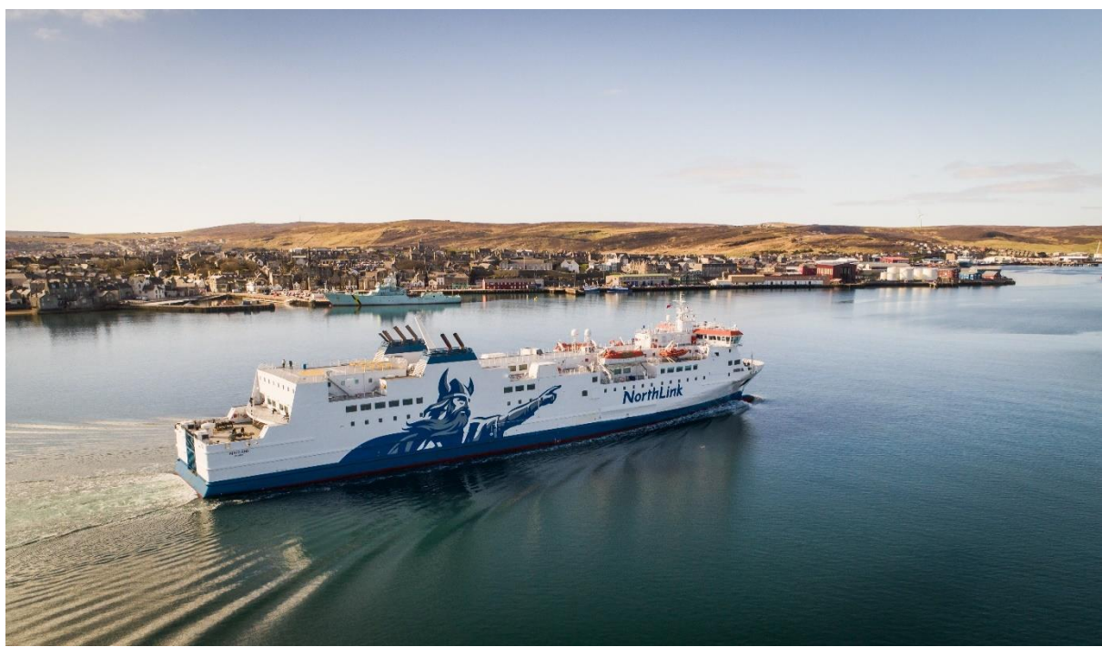
NorthLink Ferries MV Hjaltland, Lerwick