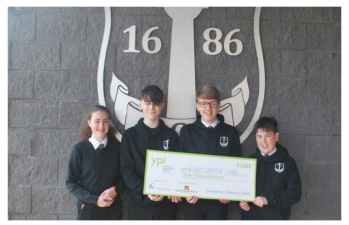
Pupils from Campbeltown Grammar School, one of the schools partnered in the Youth and Philanthropic Initiative, collect an award for their involvement on the scheme.