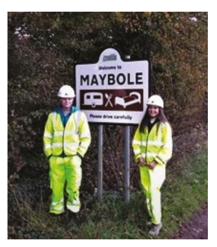
Two new apprentice graduates on the project are local to Maybole.