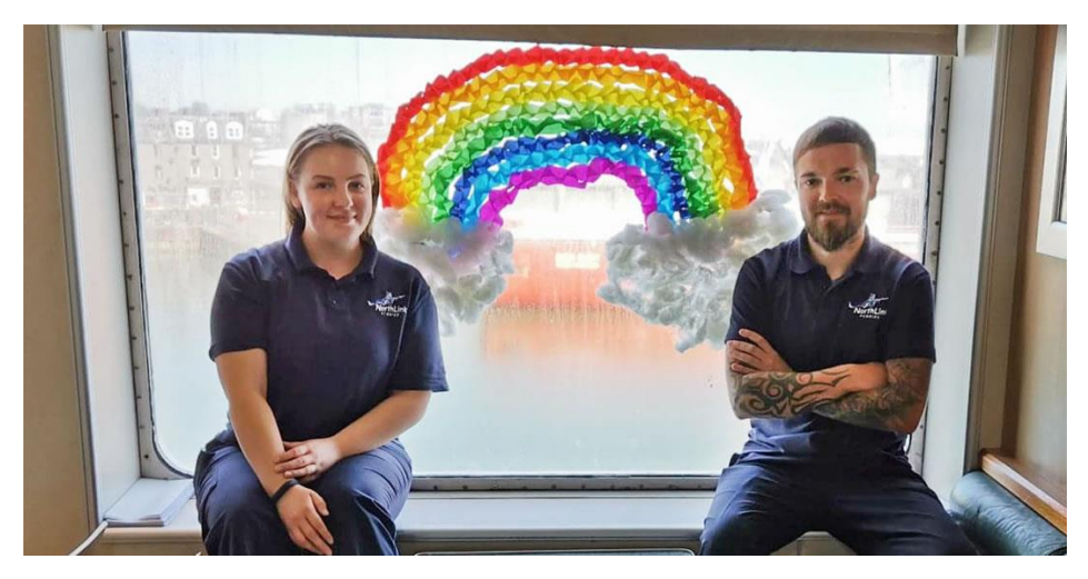
Staff on board the M.V. Hjaltland created a rainbow of hope on the ship