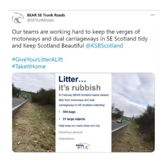
A 'tweet' promoting #takeithome