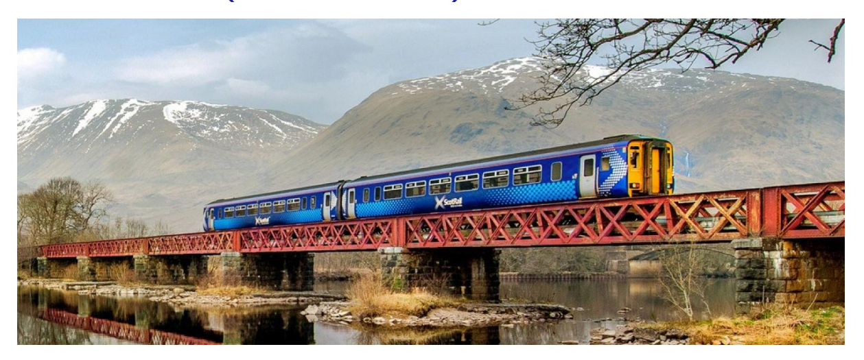
Train travelling on the pictures que West Highland Line