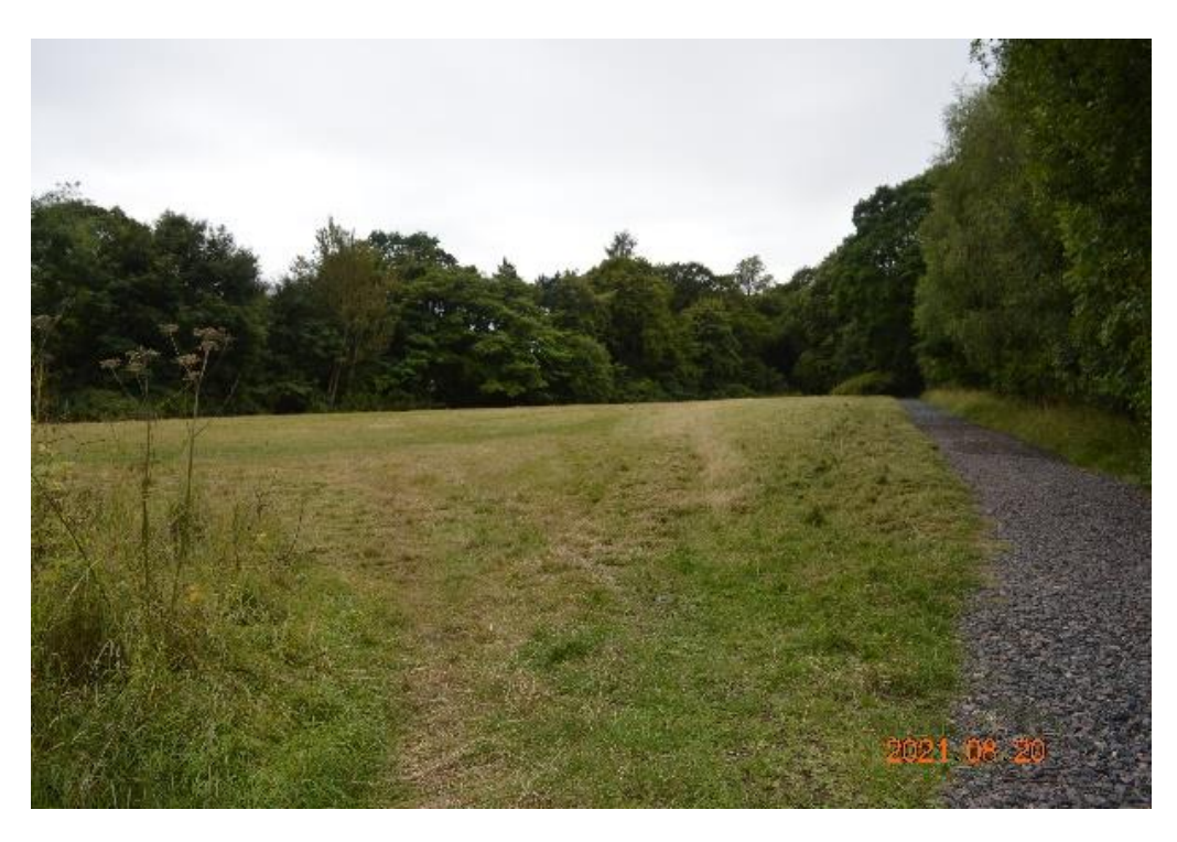
Renewed footpath at Viewpark Conservation Group