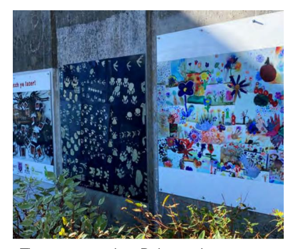
The new artwork at Dalry station

ScotRail ran an Impact Arts 'Creative Pathways' for primary school pupils to work on creating nature related crafts. This resulted in new station artwork following the joint project between Dalry station adopters and a group of 16-17 year olds.