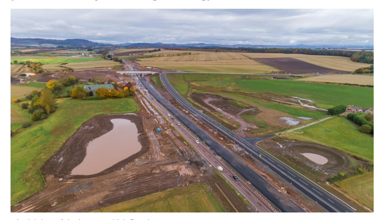
Aerial view of the Luncarty Link Road