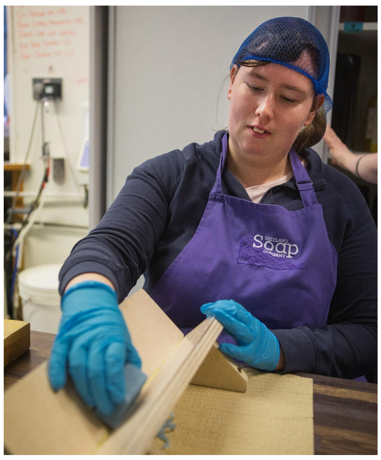
The Shetland Soap company have supplied the Northern Isles Ferry Service for the last 12 years