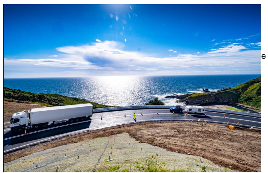
The new improved section of the A9 at Berriedale Braes opened to traffic in August 2020