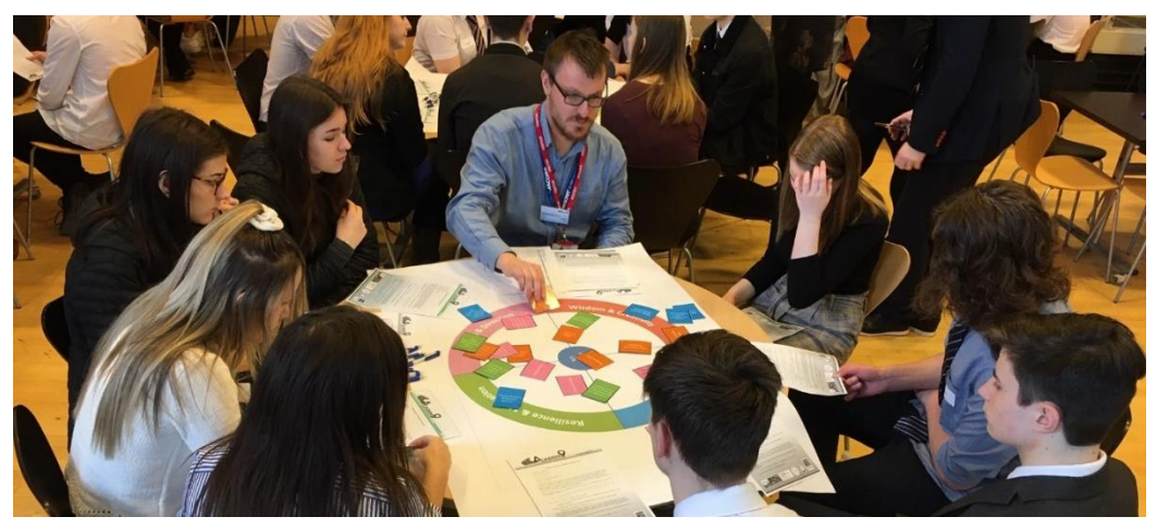
Next Steps Conference at Kingussie High School. Photo taken pre-Covid-19.