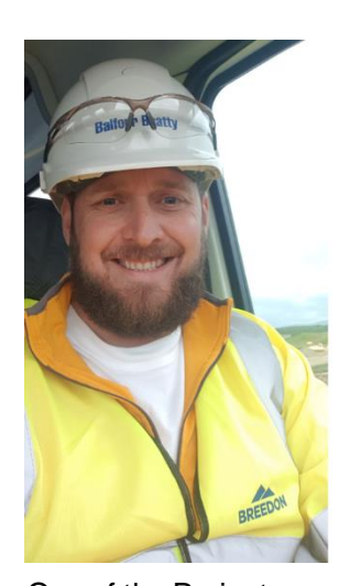
One of the Project Recce participants received two job offers after his placement

To the end of March 2021, eight veterans had completed placements, resulting in two job offers from project supply chain partners. Further details are available in the <a href="Autumn 2020 Project Newsletter">Autumn 2020 Project Newsletter</a>