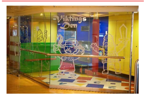
Figure 8: Recently refurbished Vikling's Den children's area

developed and we will maintain 'Press Reader' for customers. NorthLink have already introduced the 'Press Reader' facility to enable free of charge newspapers and magazines to be available for viewing on mobile phones, tablets and laptop computers.