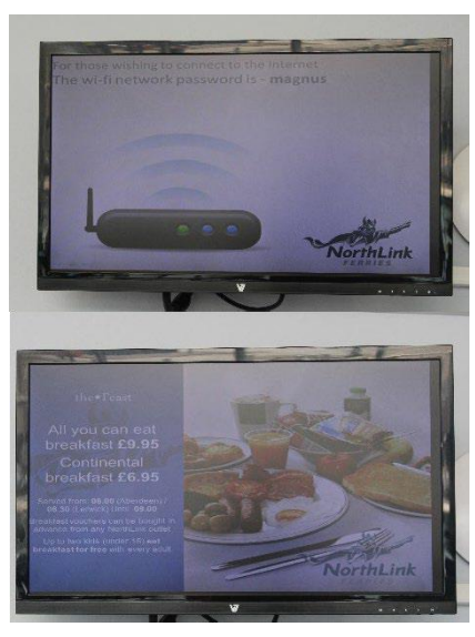
Figure 2: Passenger terminal information screens

There will also be real time information feeds provided by our travel business partners including ScotRail, Stagecoach and Traveline Scotland. As part of our work in engaging customers with accessibility issues, we will ensure that the positioning height, font size and contrast for visually impaired customers will be