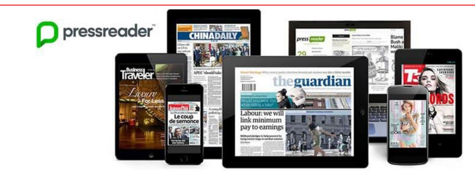
Figure 4: A sample of the content available on the 'PressReader' app

We will continue to maintain the complimentary 'Press Reader' facility, which is an app that our customers can download on their device and download newspapers and magazines using the ship's Wi-Fi This also has the added benefit of reducing the use of printed materials.