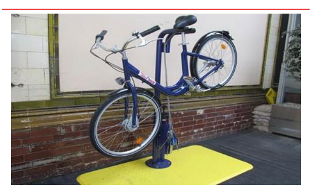
Figure 3: Investing in facilities for cyclists

Coach passengers will be dropped off in a