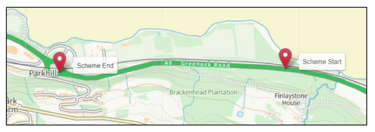
Figure 2 - Scheme Extents