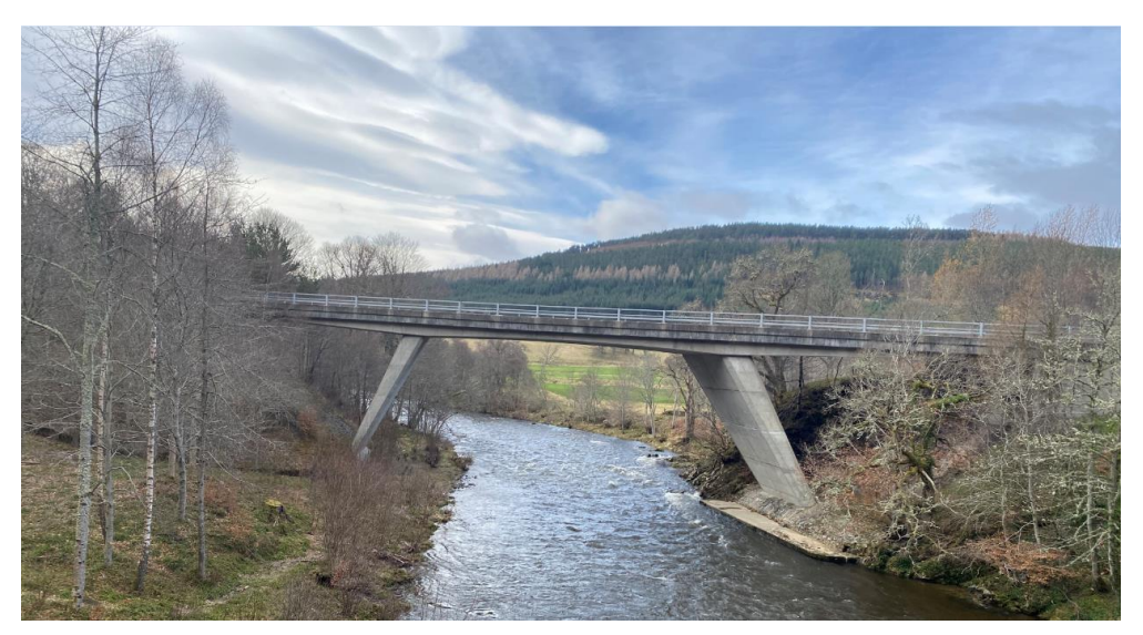
Figure 2. A95 130 Bridge of Avon.