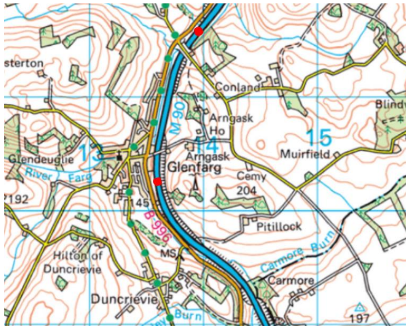
Figure 2: Site Location, Regional Scale