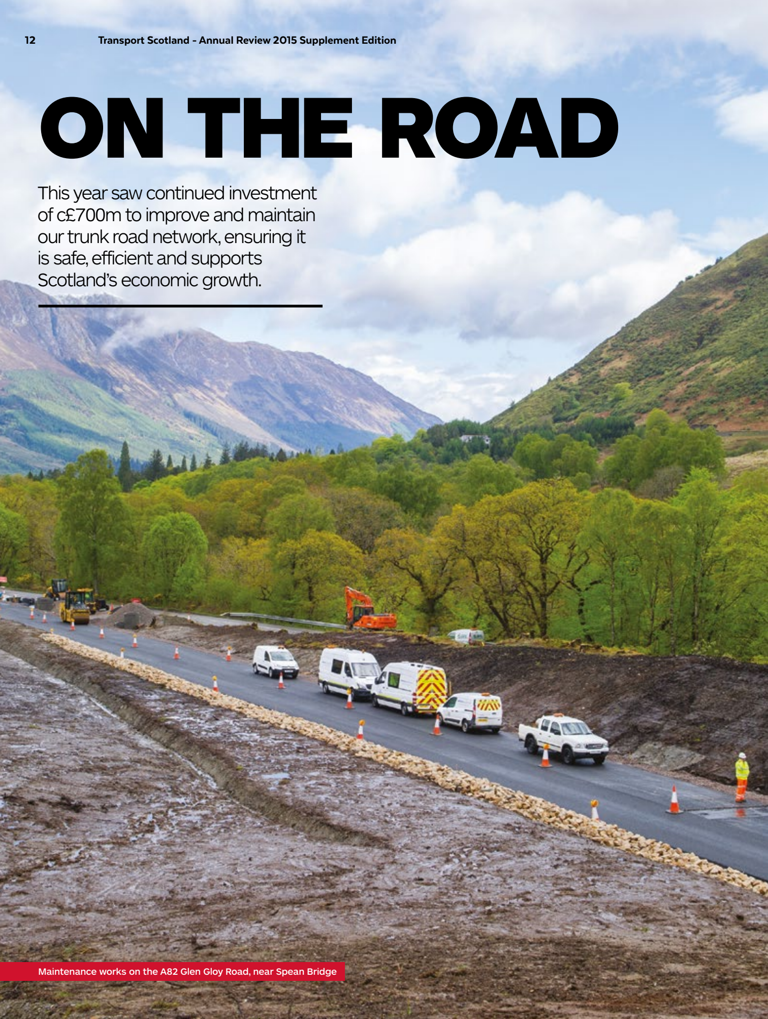
Maintenance works on the A82 Glen Gloy Road, near Spean Bridge

This year saw continued investment of c£700m to improve and maintain our trunk road network, ensuring it is safe, efficient and supports Scotland's economic growth.