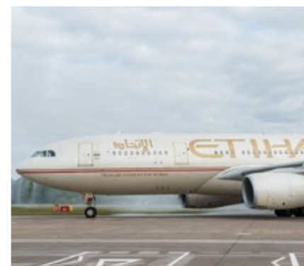
New Etihad Edinburgh – Abu Dhabi route secured

Following purchase of two new twin otter aircraft in 2014, these were delivered and put to use on the HIAL routes in May this year, further demonstrating our commitment to these lifeline services.