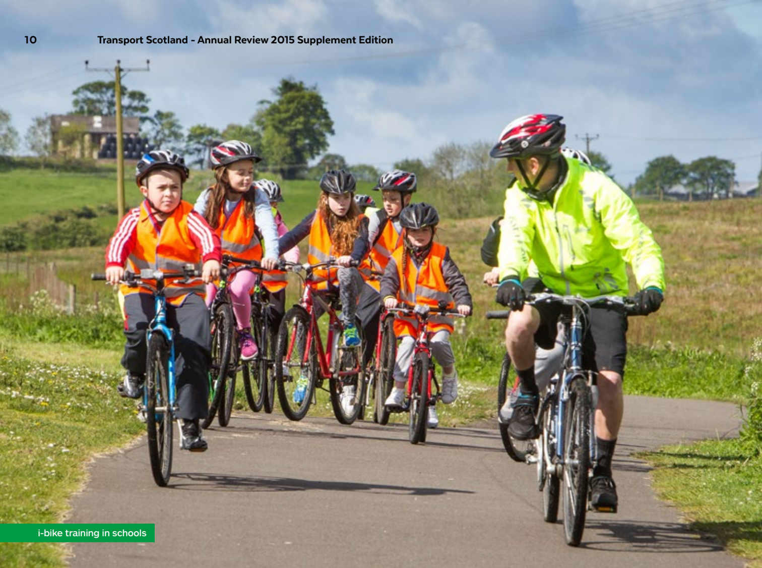
i-bike training in schools