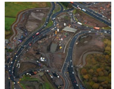
M8 M73 M74 Motorway improvements