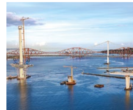
Queensferry Crossing reaches new heights

Good progress has been made on the A82 Tarbet to Inveraran scheme, with the preferred option being presented to the public in October 2015.