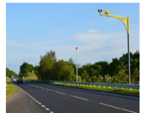
Average speed cameras on the A9

Partnership with public transport operators is delivering saltirecard smart ticketing across Scotland. During 2015 we saw the successful rollout of smart ticketing to school transport in some areas, along with the launch of Orkney air smart ticket in June. The award of the Abellio ScotRail franchise has also pushed forward a “Summer of Smart” programme, due to roll out over 2016.