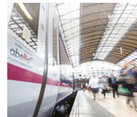
The ScotRail Abellio Franchise launched in April

The project upgrades 16 miles of line to double-track and makes signalling improvements. Provisions have also been made for two new stations at Dalcross and Kintore along with the redevelopment of Forres station.