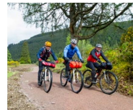
Great Glen Cycleway

Following significant damage caused by an overheight vehicle, the new M8 Hillington Footbridge was opened in Sept 2015. An accessible combined footway and cycleway bridge made using recycled materials, the footbridge links Cockles Loan in Renfrew with Hillington Industrial Estate and is a vital link across the M8 motorway. Extensive consultation with Renfrewshire Council, Glasgow Airport and other stakeholders enabled this £2.6m structure to be constructed adjacent to the old bridge which was demolished on completion of the new structure.