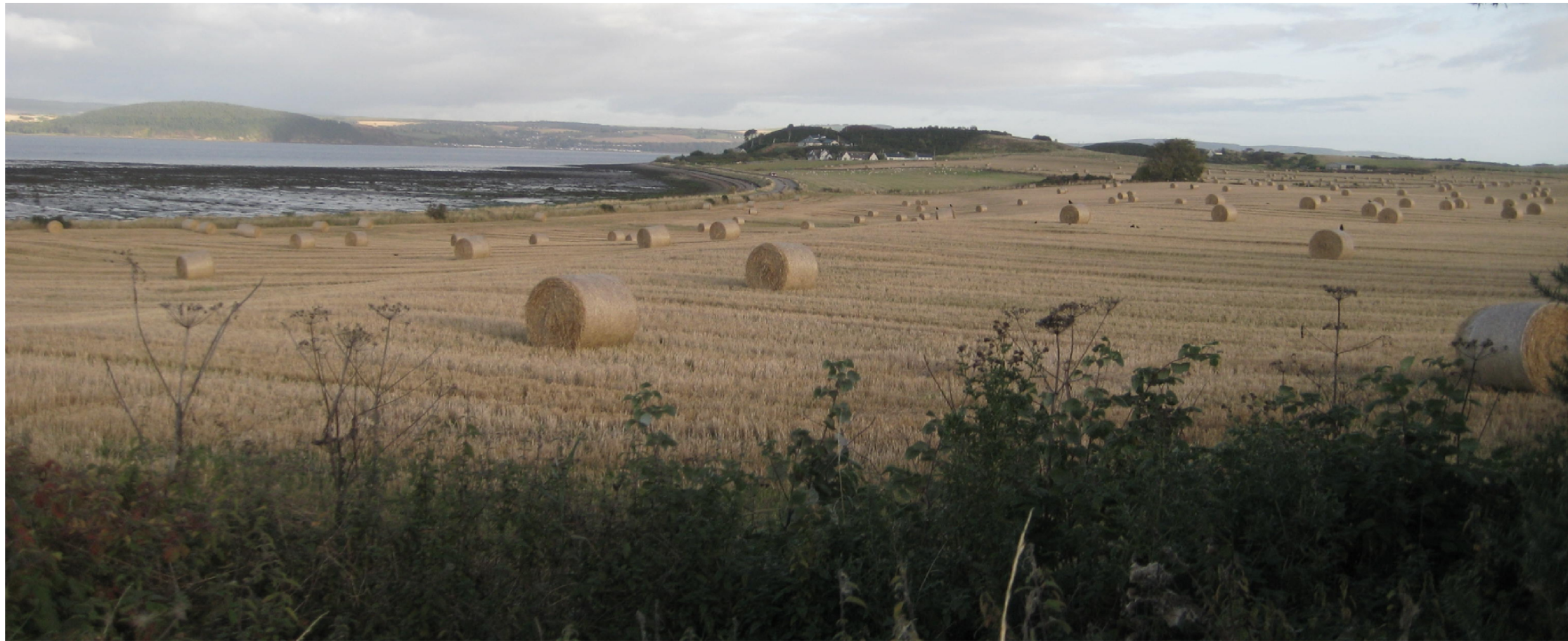
LLCA Viewpoint 3 - Typical view of the Enclosed Firth LLCA - View adjacent to Allanfearn Waster Water Treatment Works looking north - Photo taken 20/10/2015