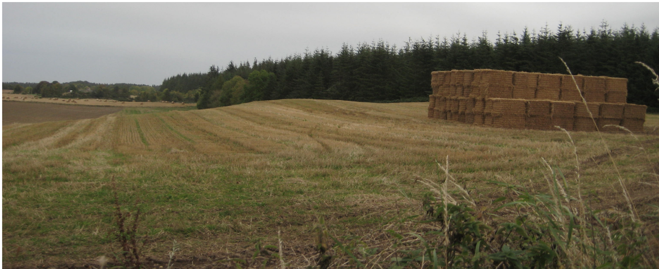
LLCA Viewpoint 4 - Typical view of the Forest Edge Farmland LLCA - View from C1024 Tornagrain Road looking north-east - Photo taken 20/10/2015