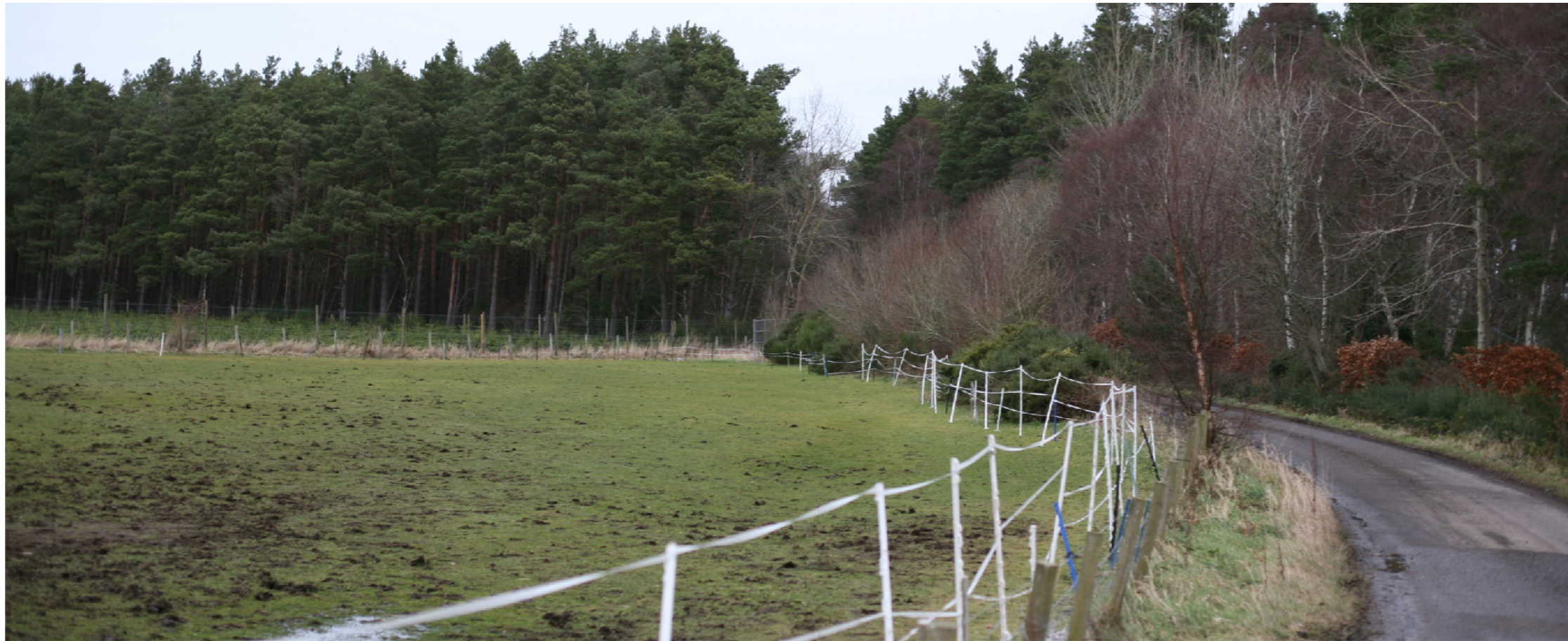
LLCA Viewpoint 13 - Typical view of the Hardmuir Forest Edge Farmland LLCA - View from Woodend looking south-west - Photo taken 17/2/2015