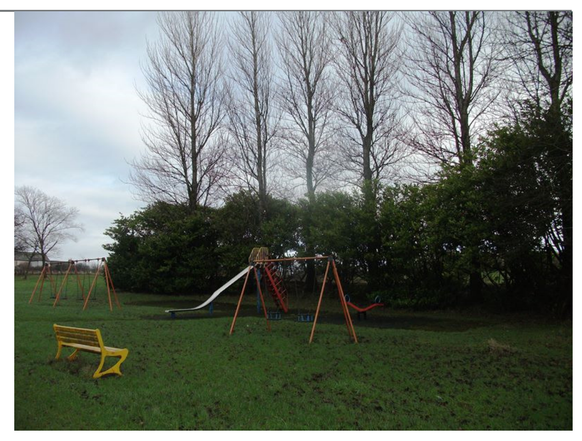
Photograph 14:1: Children's play area in green space adjacent to Larch Terrace