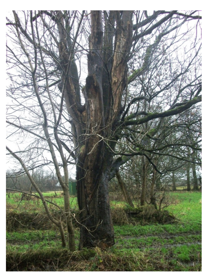
Photograph 9:4: Category 1 tree located south of Spier's Old School Ground

trees or with potential for use by a single bats". Photographs 9:4 and 9:5 detail the features that determined the classification as a category 1 tree. The remaining trees in the area are classified as category 3 trees as they have no features that would support a bat roost.