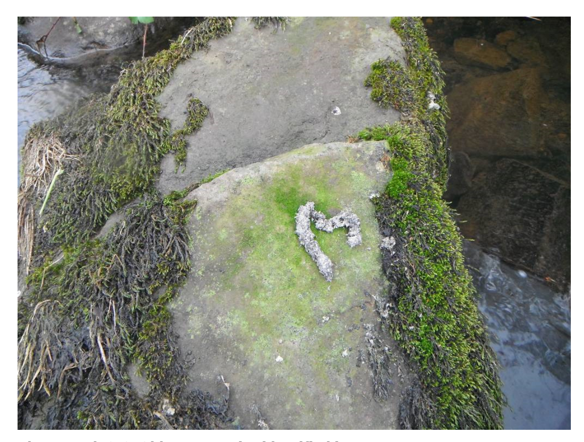
Photograph 9:6: Old otter spraint identified in Powgree Burn

9.3.31 This survey was not repeated in 2015 due to Powgree Burn being outside the survey area and the final design not affecting the burn (approximately 230m at the closest point). All other watercourses within the study area are of no interest to otter because they are considered to be too small and offer no value in terms of prey species etc. Therefore otter are scoped out of any further assessment.