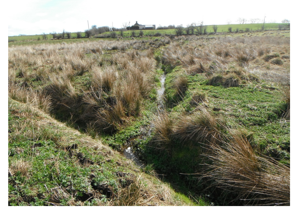
Photograph 9:7: Network of ditches with abundant vegetation

9.3.32 The phase 1 habitat survey identified a network of ditches at the northern extent of the study area, these are shown in Figure 9.1 within the Phase 1 Habitat Survey Report (located in Appendix 9.1) and in Photograph 9:7.