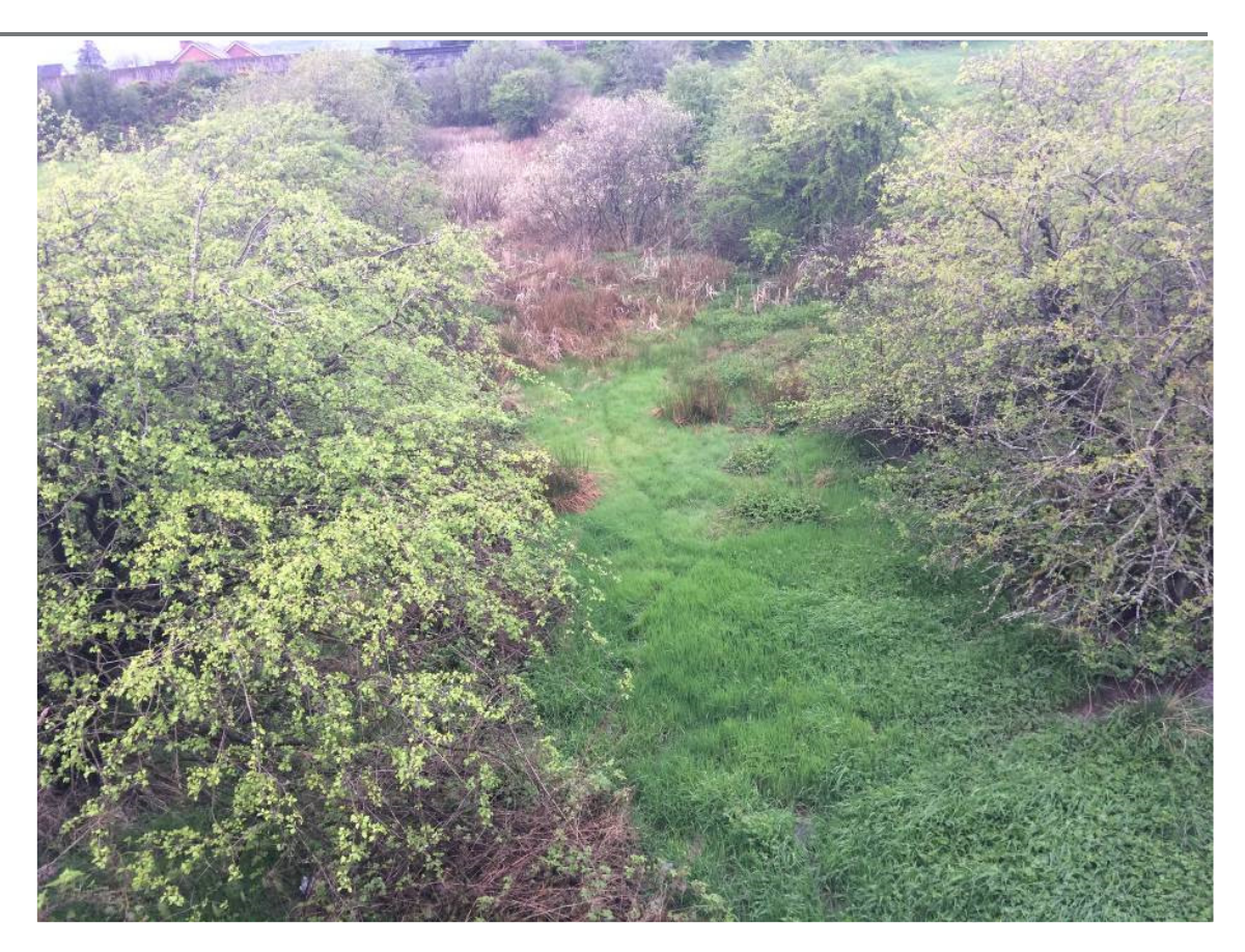
Photograph 9:2: Mammal pathway in the disused railway line

9.3.12 Consultation with Scottish Badgers recommended identification of setts as early as possible to mitigate appropriately and create a badger protection plan. The repeated survey did not record any definitive field signs within the survey area. Therefore it is considered that badgers are not an ecological receptor that will be affected by the scheme and are not assessed further.