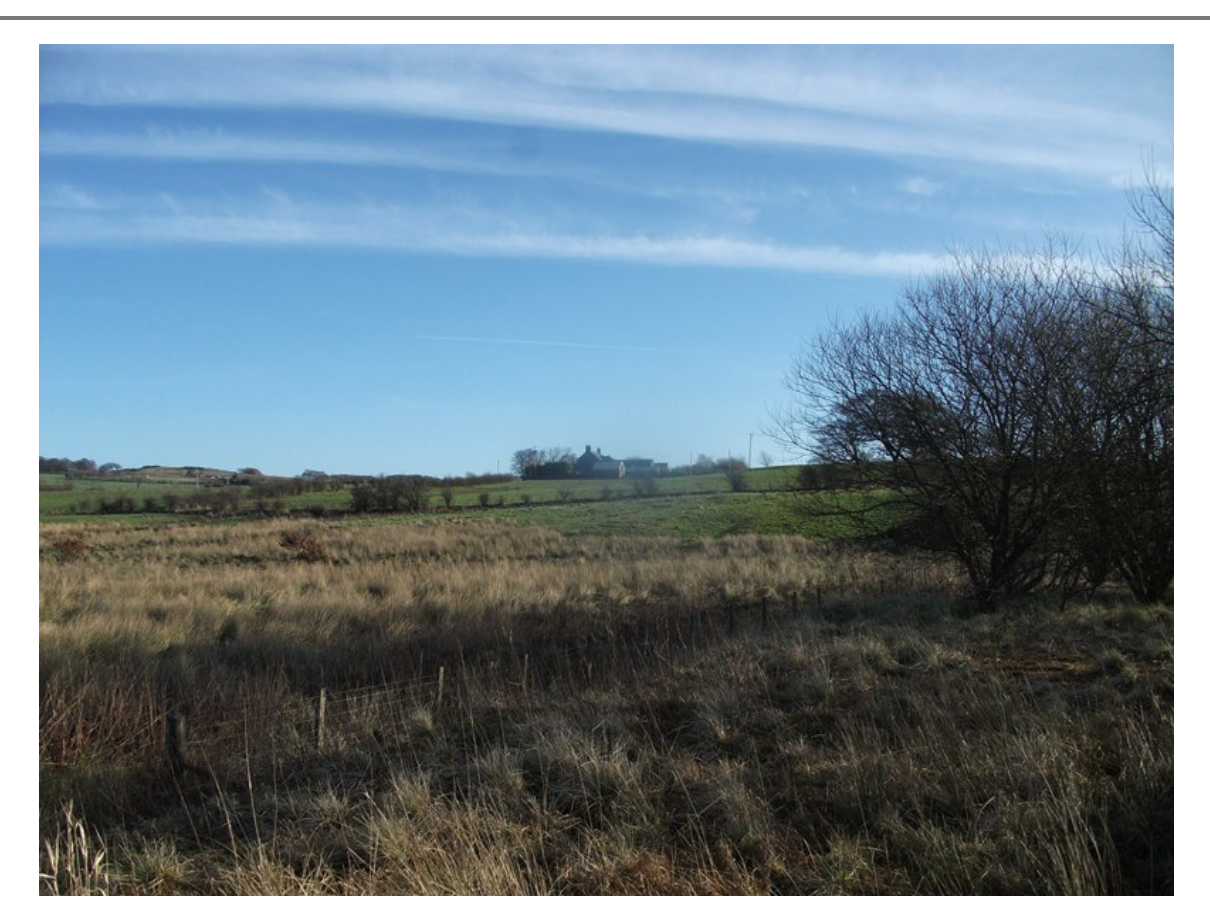
Photograph 8:7: View of farmhouse at Hill of Beith looking east