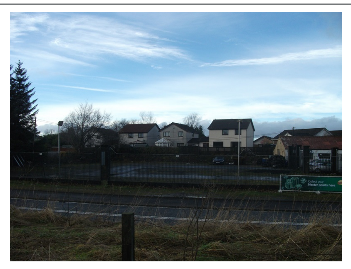
Photograph 8:25: View of Aitken Avenue looking west