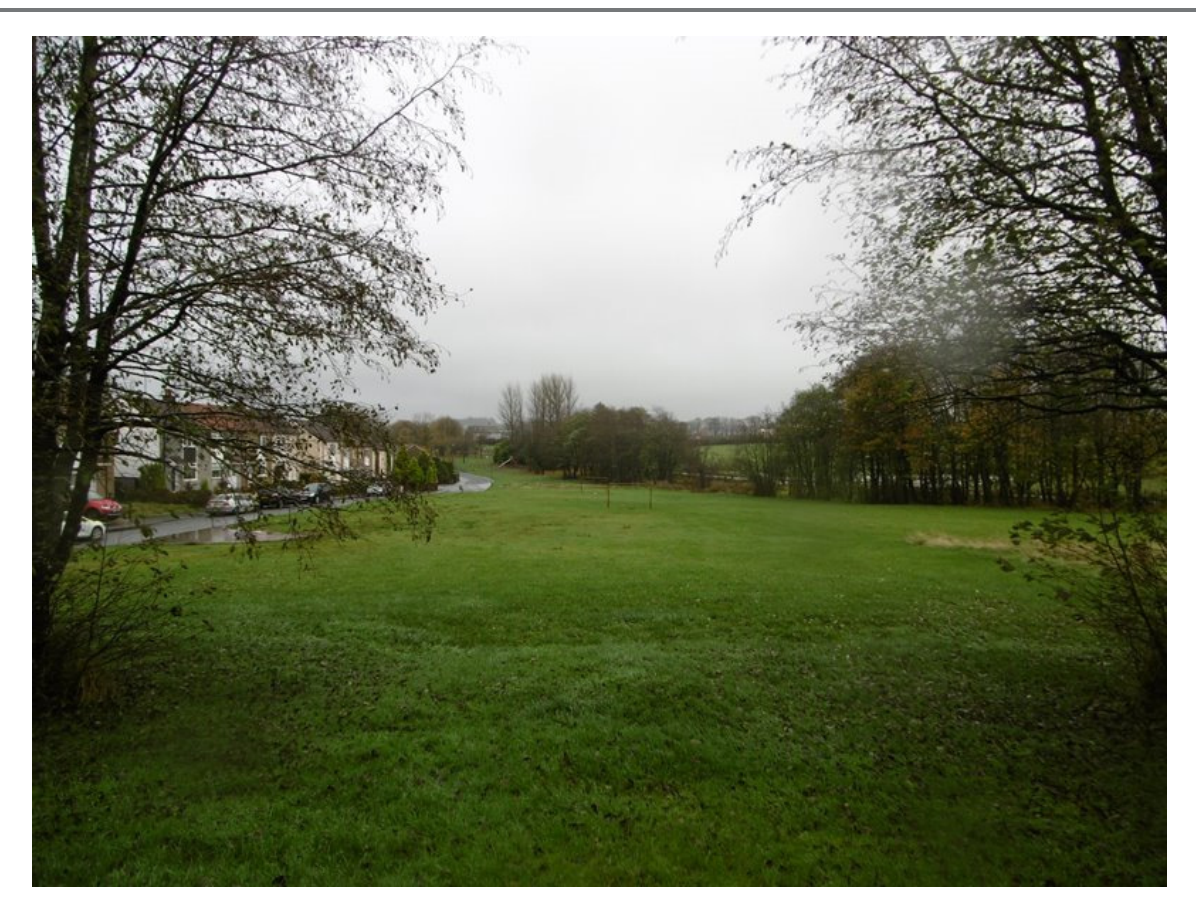
Photograph 8:23: View of play park looking northeast

Properties 1–12 Wardrop Terrace, 1-2 Wardrop Street and 32, 34, 36 and 55 Head Street