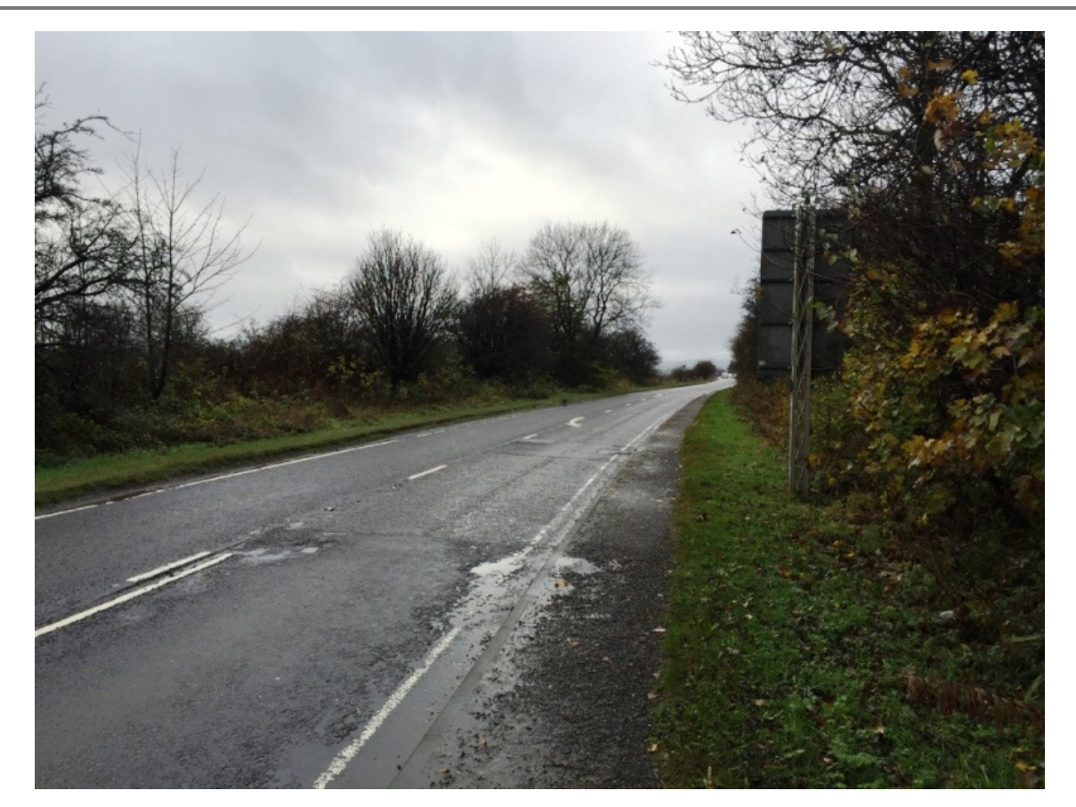
Photograph 8:4: View of the A737 looking southwest