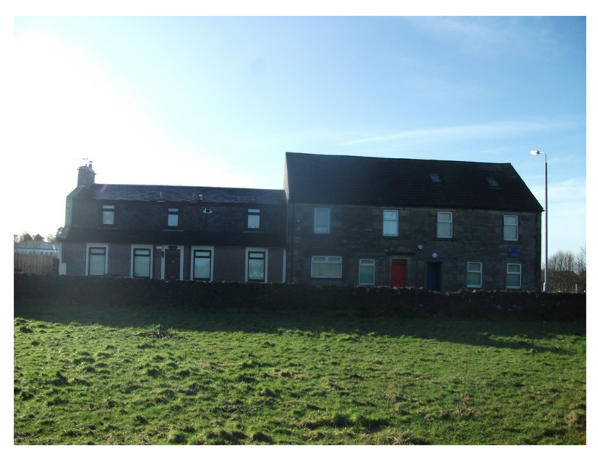
Photograph 8:8: View of 18-20 Wardrop Street looking south

8.3.28 Properties 18-20 lie at the western extent of Wardrop Street and consist of a mix of detached and semi-detached dwellings. All three of the properties are situated immediately on the roadside on the southern edge of Wardrop Street. No boundary treatments separate the properties from the footway. The properties experience oblique views of the A737 looking northwest and southwest, and direct, elevated views of Wardrop Street and farmland immediately to the north. Photograph 8.8 illustrates the view of the receptor from the proposed alignment of Wardrop Street. The sensitivity of this receptor is determined to be high.