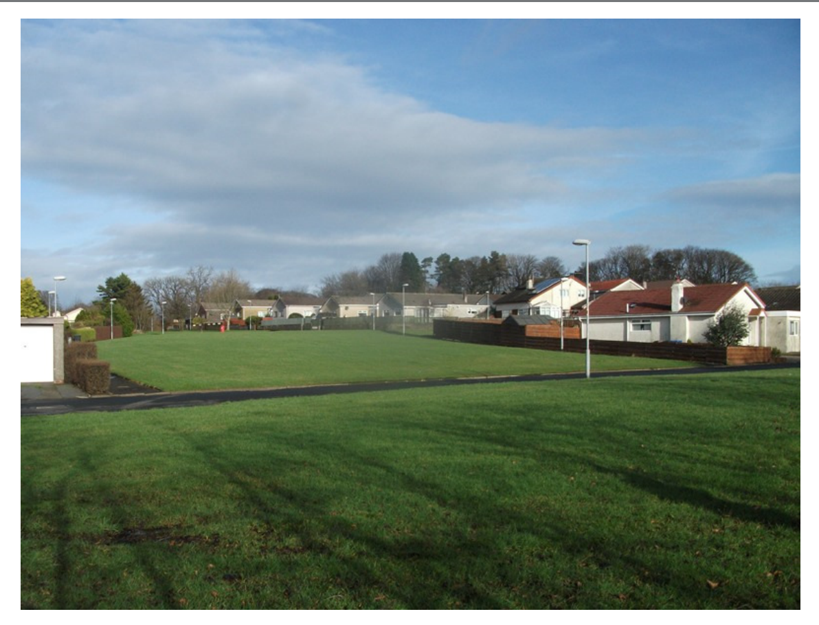
Photograph 8:18: View of grass area and properties on Glebelands Way looking northeast

Properties 27, 29, 31, 33, 35, 37, 39, 40, 41, 43, Glebelands Way and 40, 40a, 46 Glebe Road