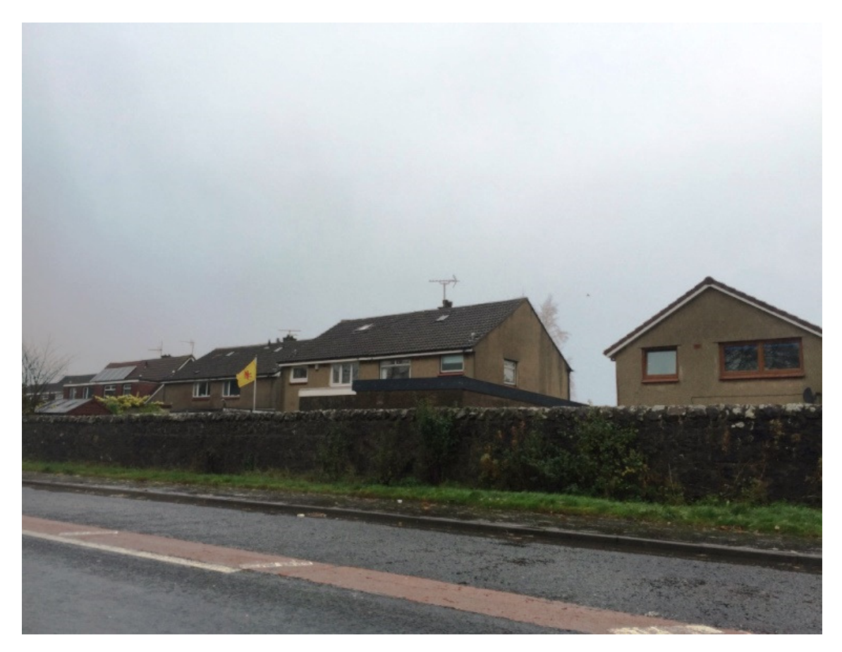
Photograph 8:27: View of Crummock Gardens looking west

of the road looking east from both floors. Birchbank is a detached residential property which lies slightly north of Crummock Gardens on Bigholm Road. The property is surrounded by tall trees and vegetation which restricts its views in all directions. A small gap in the vegetation provides limited views of the existing A737 for this receptor looking southeast. Photograph 8.27 illustrates the view of properties 17-26 from the existing A737. The sensitivity of this receptor is determined to be high.