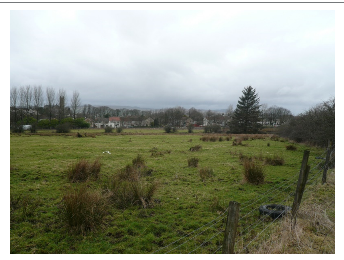
Photograph 8:3: View of landscape from Geilsland School looking southwest