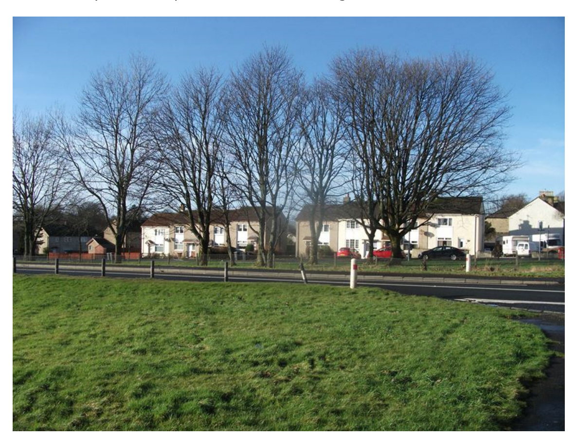
Photograph 8:22: View of Larch Terrace looking southwest

immediately opposite the properties hosts a selection of mature deciduous trees, primarily along the boundary to the A737. Tree species include ash Fraxinus excelsior, alder Alnus glutinosa, sycamore, poplar Populus spp and cherry Prunus avium. All of the properties on Larch Terrace will experience a direct view of the A737 in winter and screened views in the summer when trees are in leaf. Photograph 8.22 shows the properties from the approximate centre line of the proposed Head Street Roundabout. The sensitivity of this receptor is determined to be high.