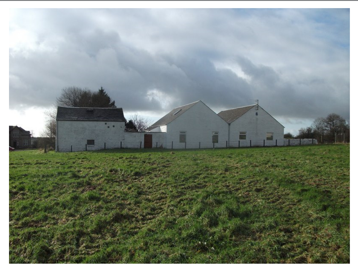
Photograph 8:11: View of 16 Barrmill Road looking southwest