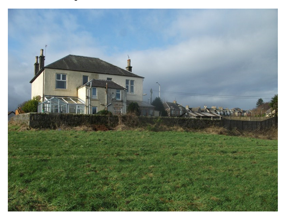
Photograph 8:10: View of 12 and 14 Barrmill Road looking southwest

delineates the boundary of the properties with a small access road to the front. An area of farmland lies immediately to the rear. Both properties have direct unobstructed views of the existing A737 to the west and experience open, elevated views of farmland and woodland to the east, northeast and southeast. Photograph 8.10 illustrates the view of the properties from the centre line of the proposed A737. The sensitivity of this receptor is determined to be high.