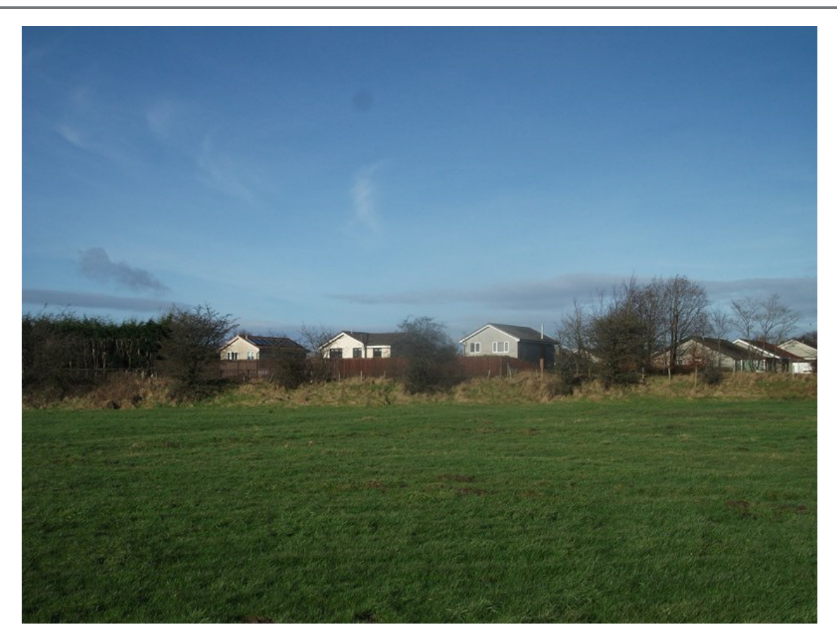
Photograph 8:17: View of 8-14 Glebelands Way looking northwest