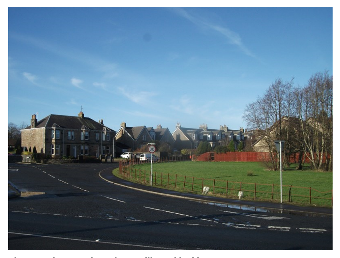
Photograph 8:21: View of Barrmill Road looking west

Properties 10a, 10b, 10c 10d, Barrmill Road