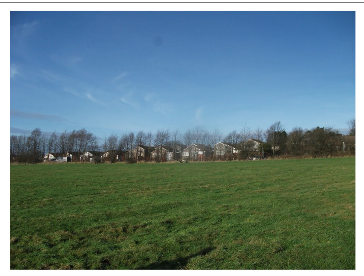
Photograph 8:19: View of properties Glebelands Way looking northwest

Properties 42, 42a, 44 and 58 Glebe Road