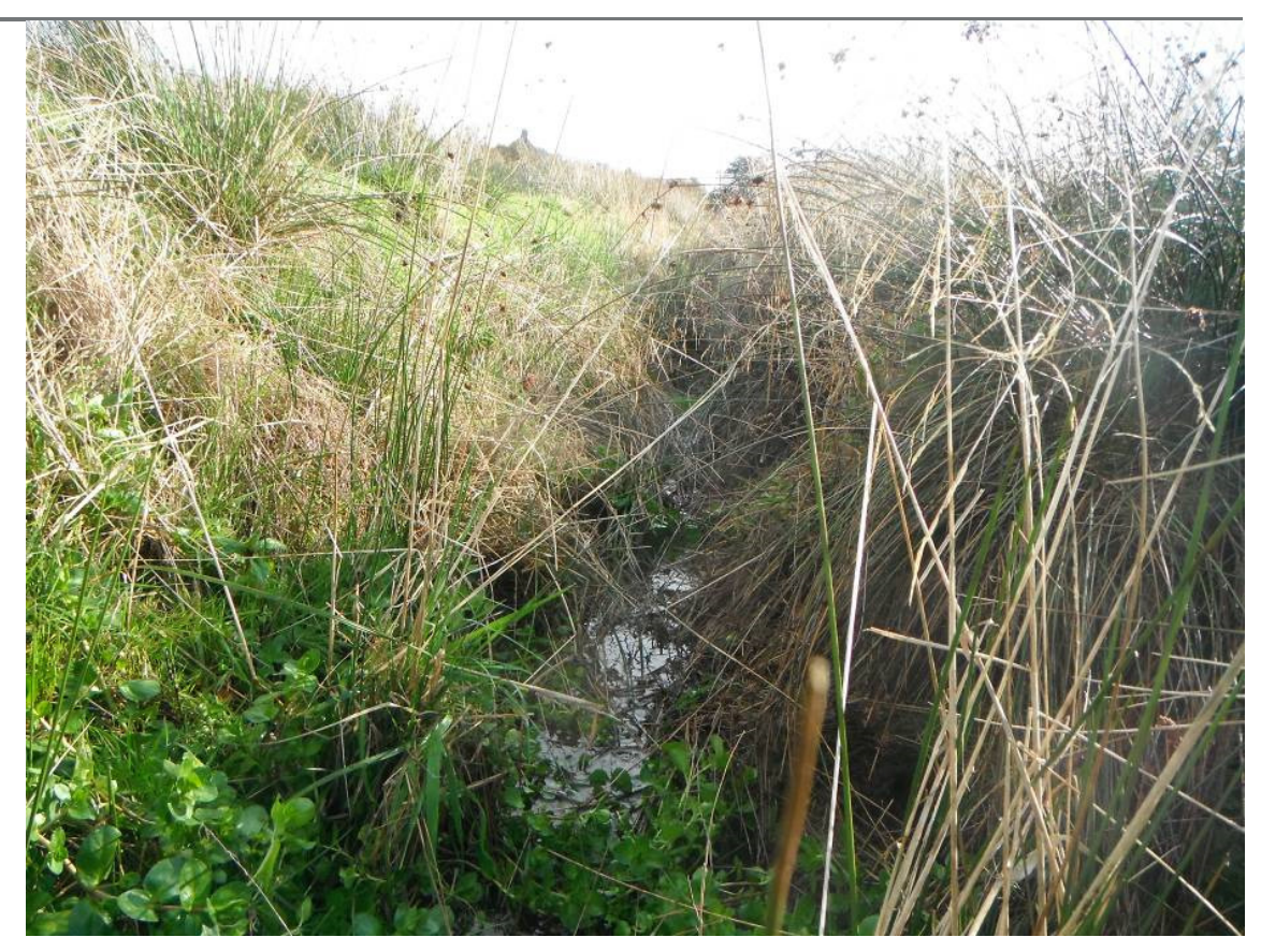
Photograph 9:8: Ditch located in northern area of the study area surveyed for water vole

9.3.35 The water vole survey was repeated in 2015 to support the Environmental Statement due to the ditches being impacted by the scheme. However, during subsequent surveys it was re-evaluated as having a low quality habitat for water vole due to the high likelihood of burrows being trampled by horses in the field. There were numerous small mammal field signs, including pathways and droppings identified during the survey, however none were definitively water vole, and more likely to be the more common field vole Microtus agrestis . As the surveys did not identify the presence of water vole in the area, this species is scoped out and is not considered as an ecological receptor in this assessment.