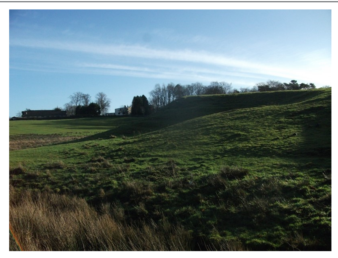
Photograph 8:1: View of farmland to the east of the A737