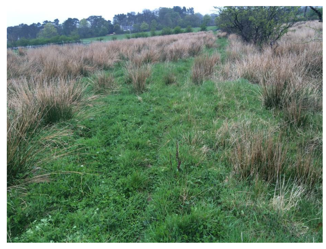
Photograph 9:1: Mammal pathway in the north of the survey area

9.3.11 The survey systematically checked an area up to 500m east of the existing A737 (detailed in Chapter 2 The Project and Alternatives Considered). Although there were no definitive badger field signs identified, there were a number of mammal pathways throughout the area in various fields and in the disused railway line, shown in Photograph 9:1 and 9:2. No records of badger in the study area were received from The Scottish Badgers.