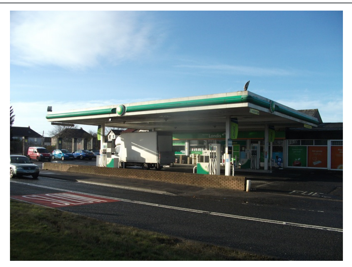
Photograph 8:26: View of Thomson of Beith looking west

Properties 14, 16, 18, 20, 22, 24, 26, 28, 30, 32 and 71 Aitken Avenue