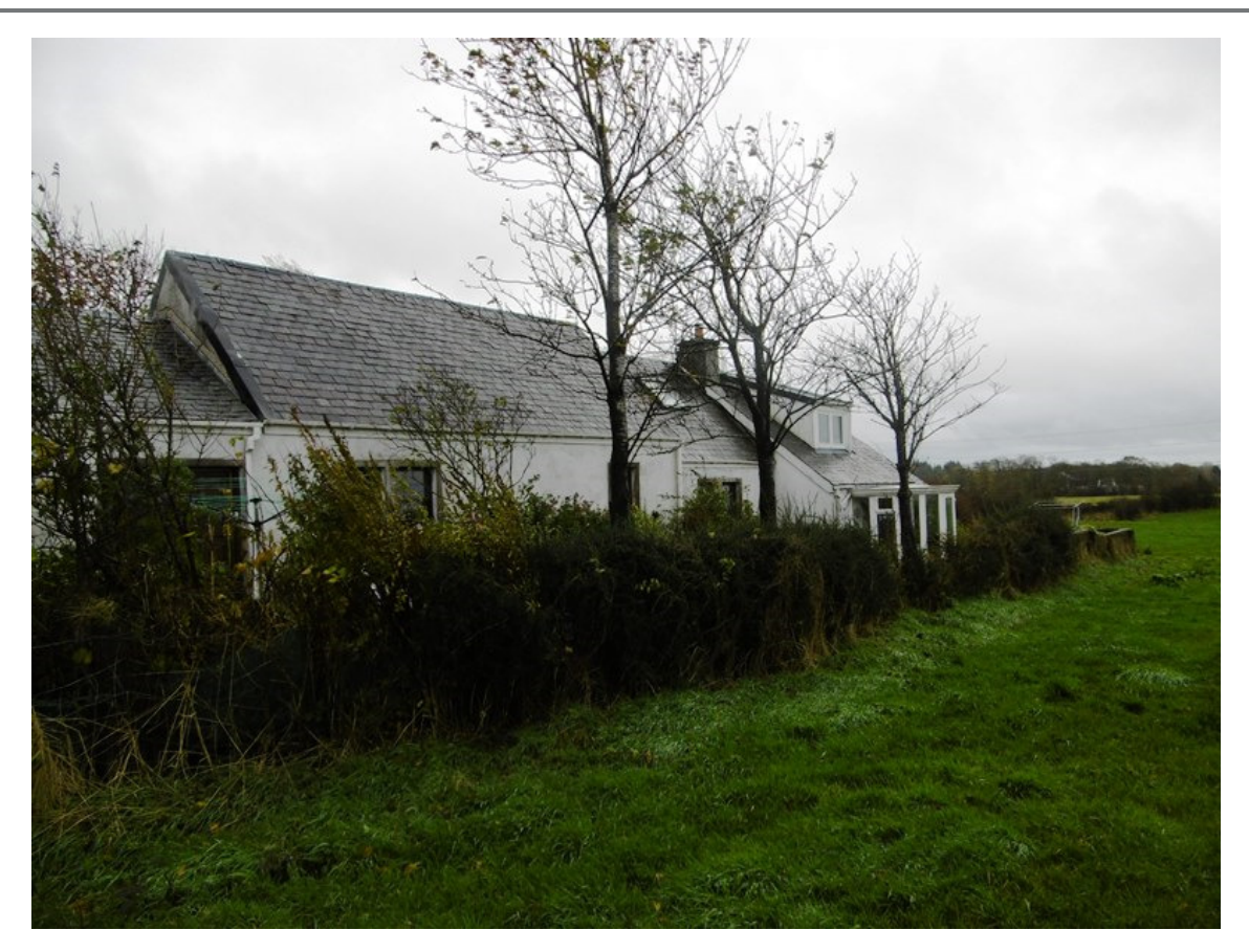
Photograph 8:13: View of 2 Spiersland Way looking southeast