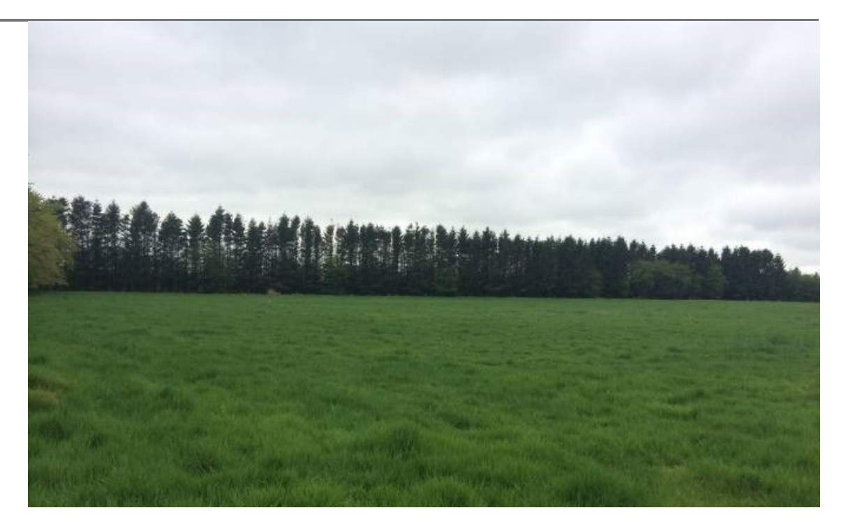
Photograph 9:3: Treeline at the edge of Spiers Old School Ground