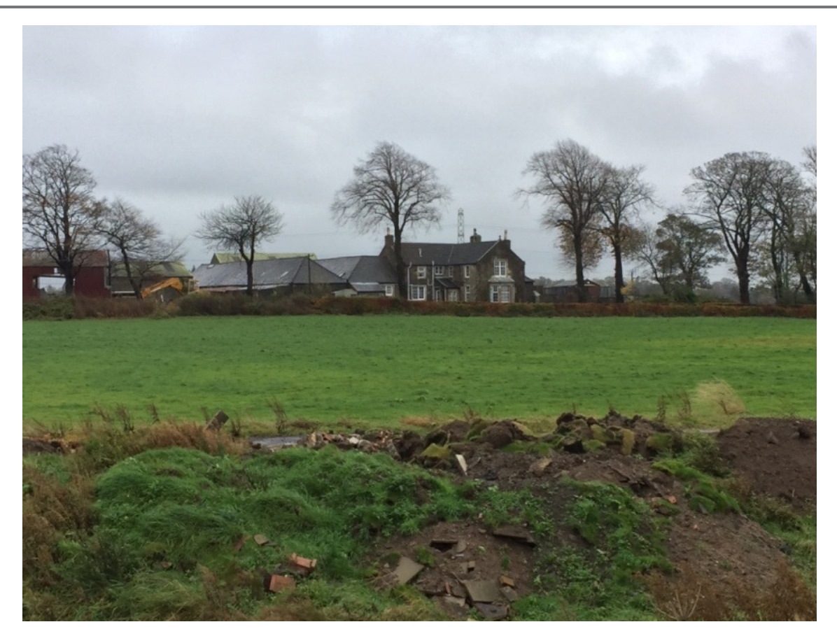
Photograph 8:14: View of Manrahead farm looking southeast

Group of properties Jamieson Way, Dalry Road, Manuel Avenue, McMillan Crescent, Spiers Avenue and St Andrews Place