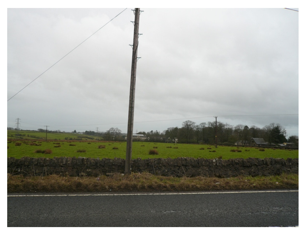
Photograph 8:5: Stone wall and agricultural land to the north of Wardrop Street

shown in Photograph 8.5. As previously noted, the area predominantly contains small to medium sized fields and the field boundaries consist of hawthorn hedgerow and scrub. In the southern extent of the study area there are remnants of field boundaries within the larger fields. Chapter 7 Cultural Heritage provides further information on the area's cultural heritage.