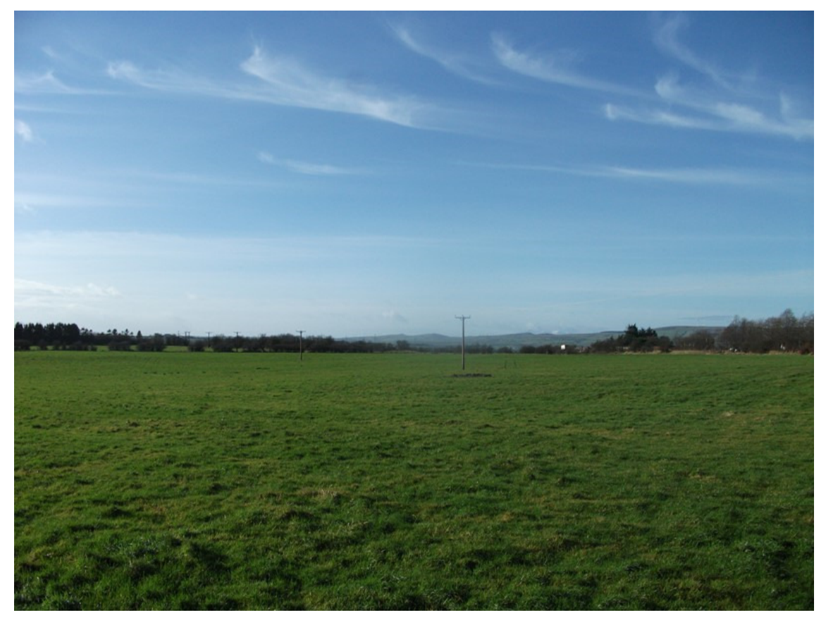
Photograph 8:2: View of landscape from Spiersland Way looking southwest