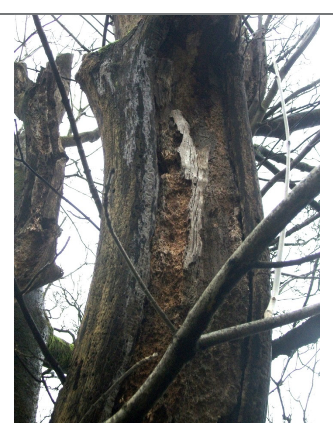
Photograph 9:5: Cracks and holes in tree south of Spier's Old School Ground with bat roost potential

9.3.17 All bat species found in Scotland are European protected species and are fully protected under the Conservation (Natural Habitats, &c.) Regulations 1994 (as amended). Furthermore, common pipistrelles were identified in the surveys which are identified within the SBL and the LBAP (and have a SAP associated with them). Considering this and the use of the area by bat species and the high potential for a bat roost in a tree south of Spier's Old School Ground, the nature conservation value for bat species is of local importance (see Table 9:9). This is due to the lack of features that could be considered imperative to the population of bats such as maternity roots, in accordance with Table 9:1 which defines the criteria of a nature resource value. The Bat Survey Report is included within Appendix 9.3.