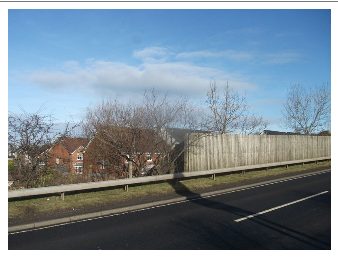
Photograph 8:16: View of Grahamfield Place looking north