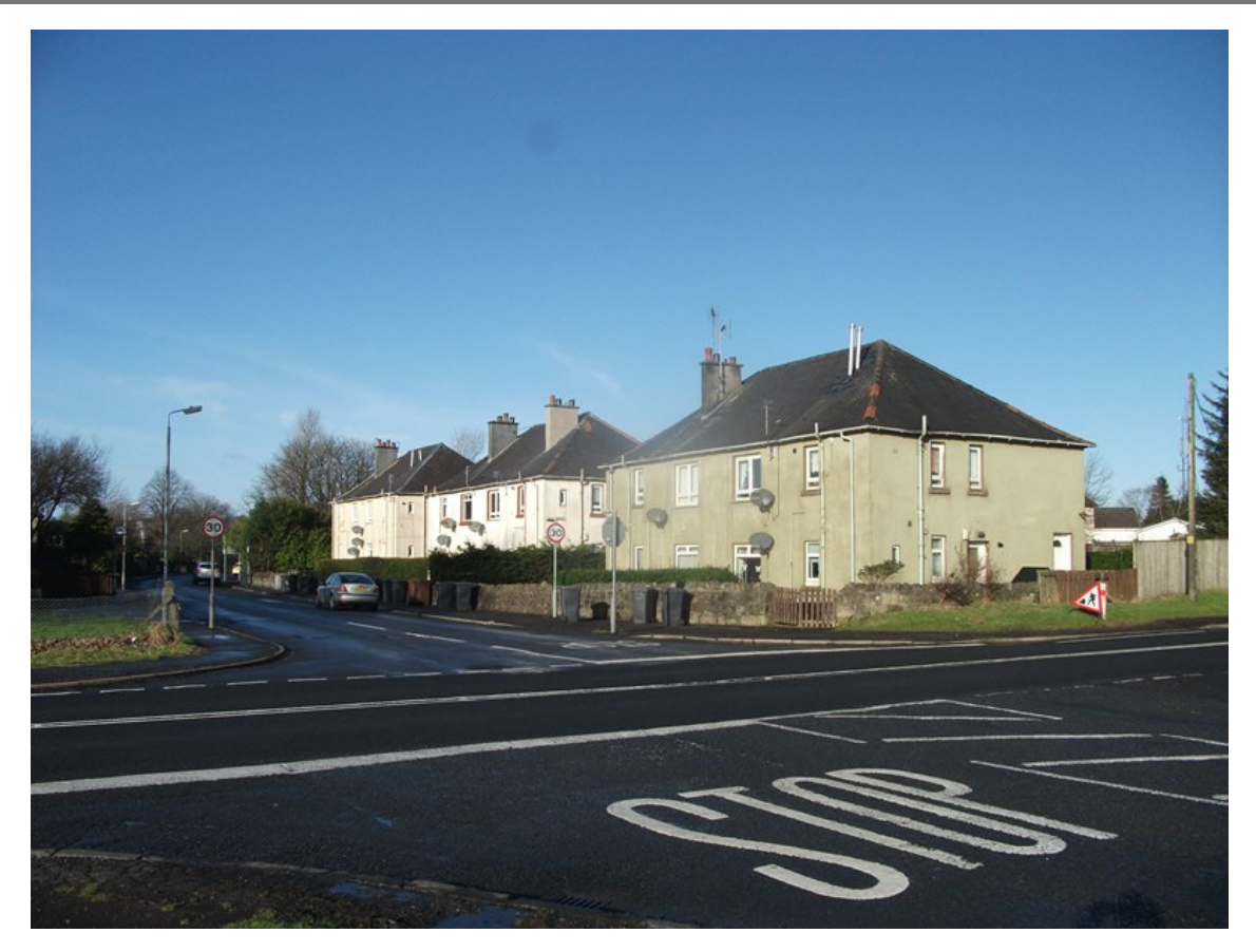
Photograph 8:24: View of Wardrop Terrace looking northwest