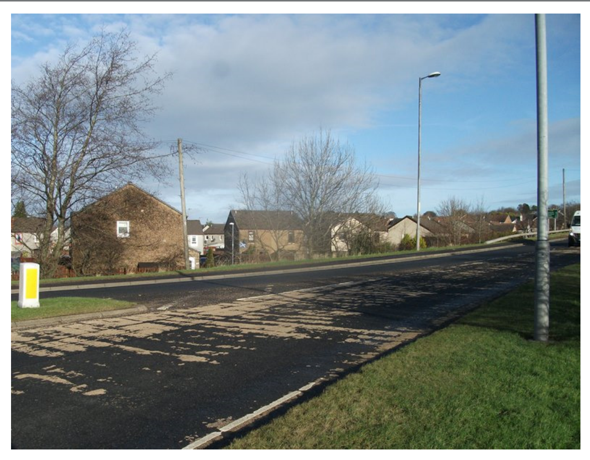
Photograph 8:15: View of properties on McMillan Crescent looking northeast

Properties 46-57 Grahamfield Place and 46 Balfour Avenue