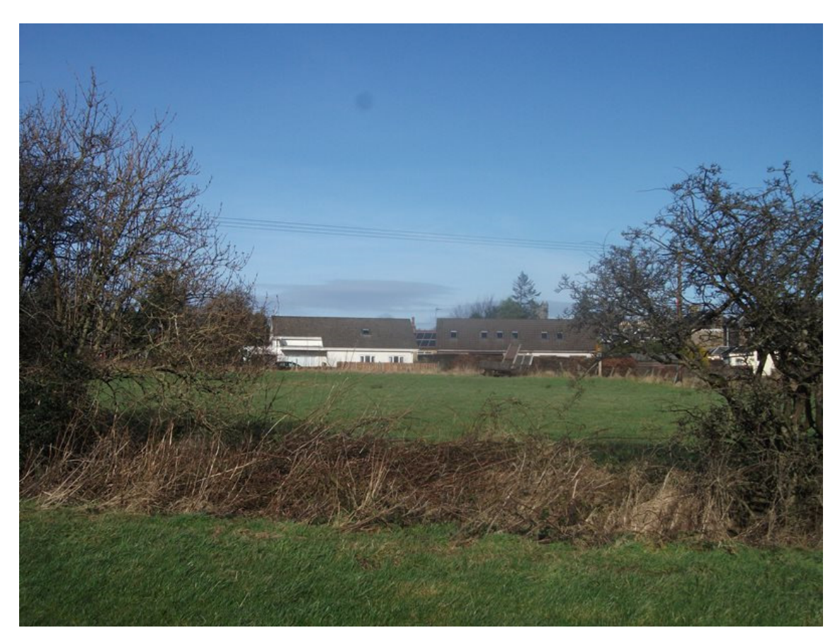
Photograph 8:20: View of 42 and 42a Glebelands Way looking north

Properties 13, 15, 17, 19, 21, 23, 25, 27, 29, 31, 33, 35, 37, 39, 41, 43 Barrmill Road