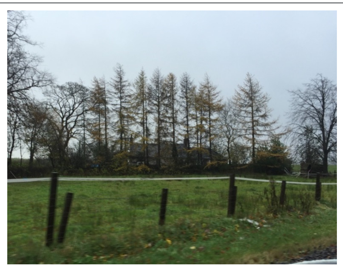
Photograph 8:6: View of Crummock farm looking east