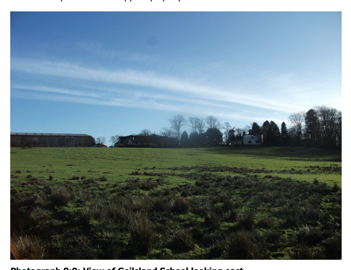
Photograph 8:9: View of Geilsland School looking east

8.3.29 Geilsland School lies to the east of the A737, located between Wardrop Street and Geilsland Road. It consists of a two storey main building and numerous single storey outbuildings, many of which have fallen into a dilapidated state. The school grounds are extensive and contain mature trees and a mix of native hedgerow. The school has varying views of the existing A737. To the northwest the school experiences distant open views of the road, while to the southwest the view is obstructed slightly due the natural topography of the land. Photograph 8.9 illustrates the view of the school from the proposed A737. The sensitivity of this receptor is determined to be moderate as viewers from the receptor will not occupy the property full time.