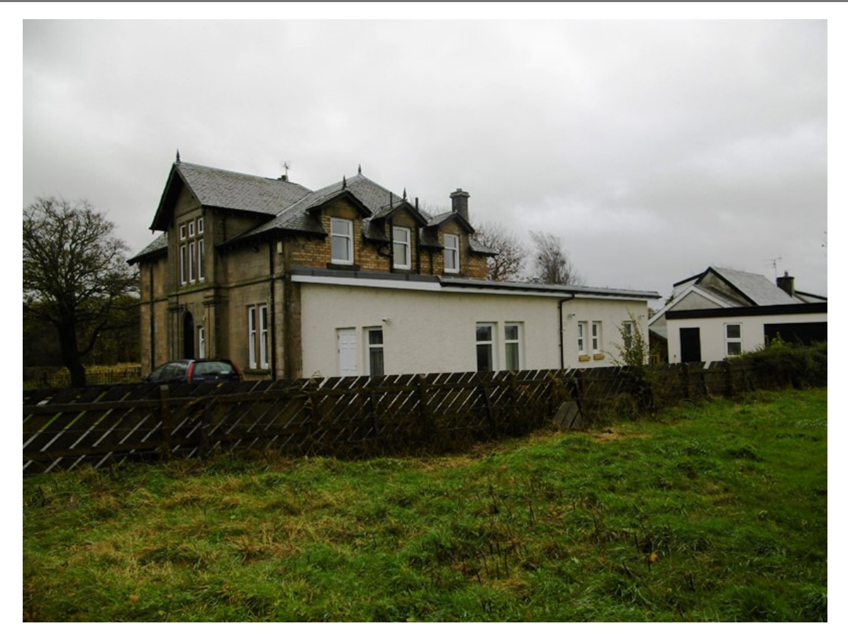
Photograph 8:12: View of 45 Barrmill Road looking southeast