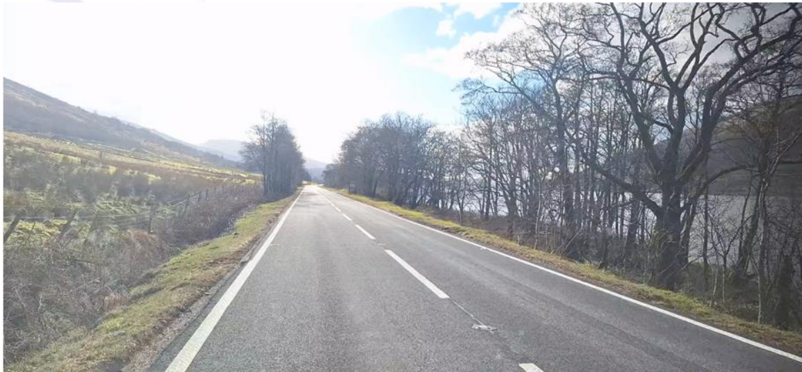
A83 Glaschoine Road Resurfacing