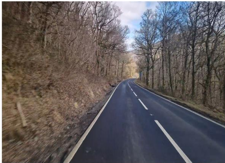
A83 Ardenavan Road Resurfacing