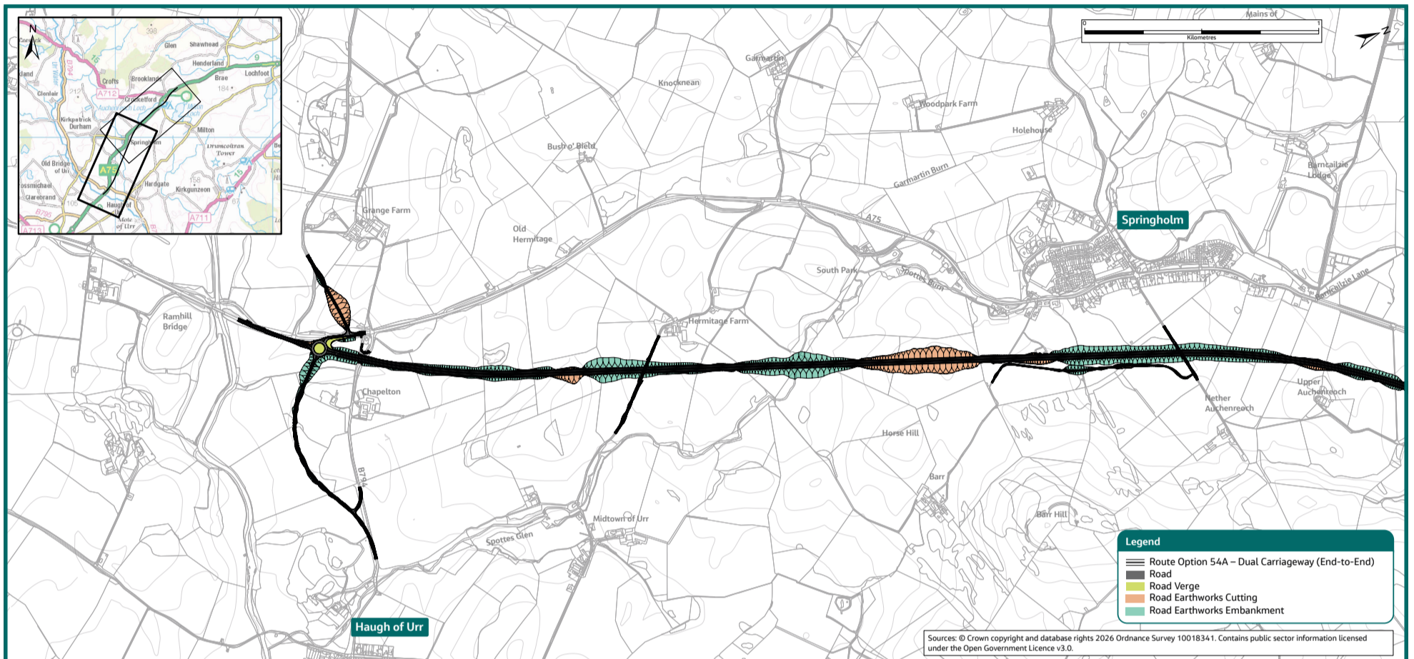
Dual carriageway (end-to-end) route option 54A from Urr Water to Larglea southern extent